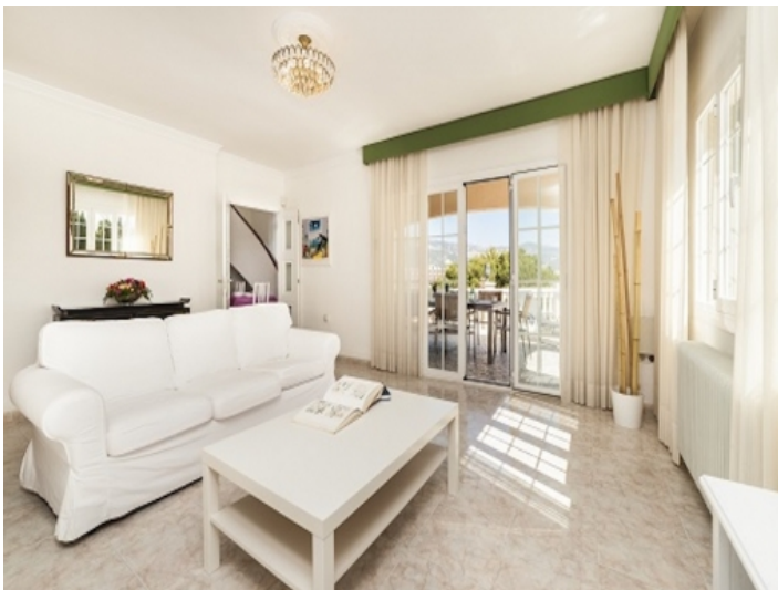
Modern living area