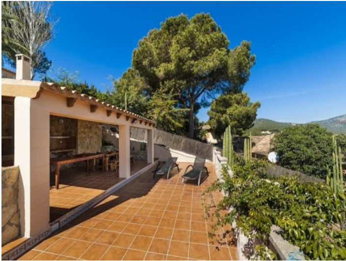
Mallorquin barbecue area