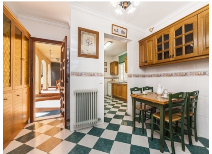
Dining area of the kitchen