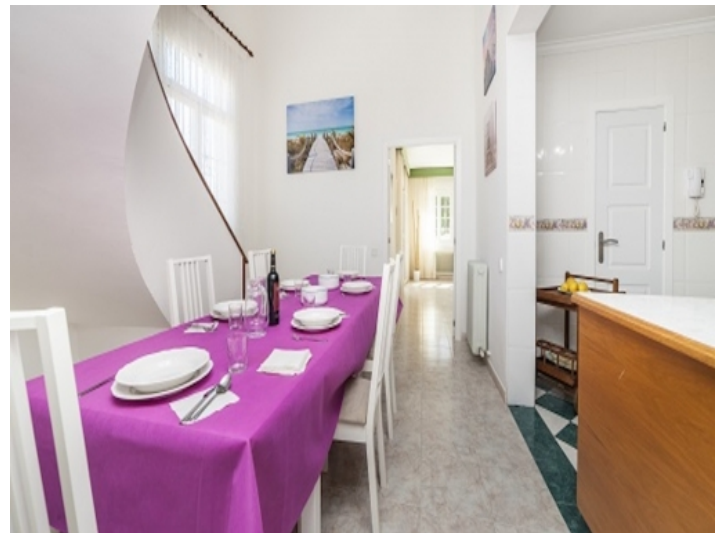
Open kitchen and dining area