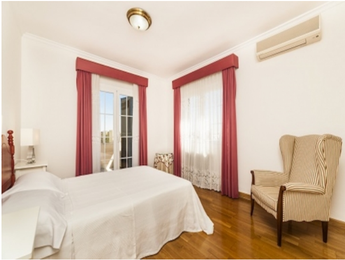
Bedroom with panoramic windows