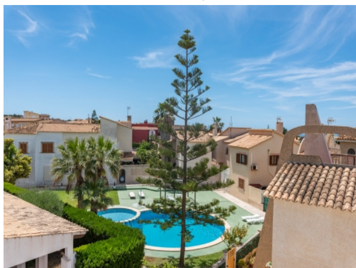
View to the community pool