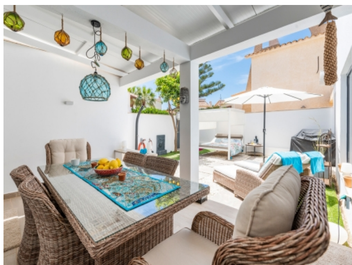
Covered dining area