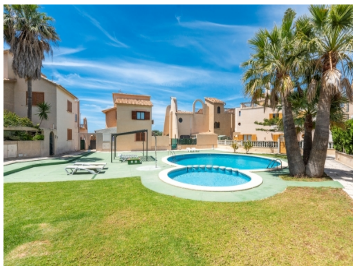
Green garden and pool area