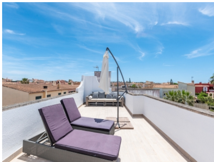
View of the terrace