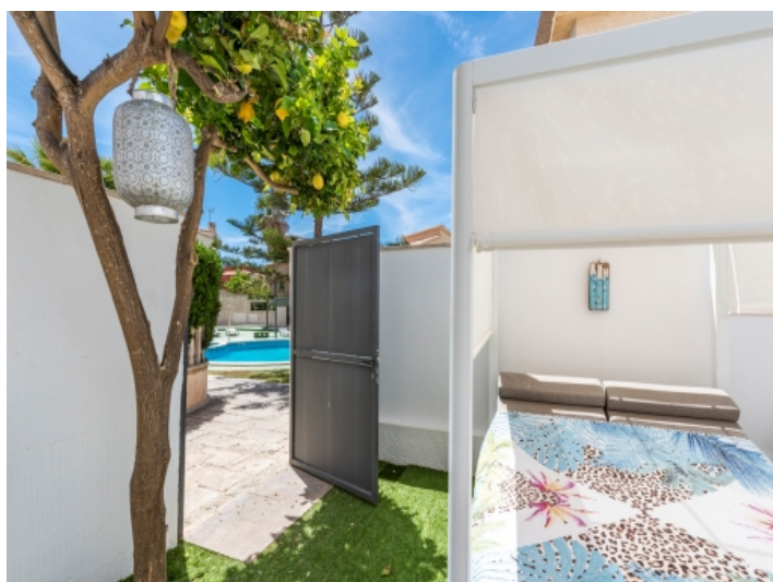
Access to the community pool