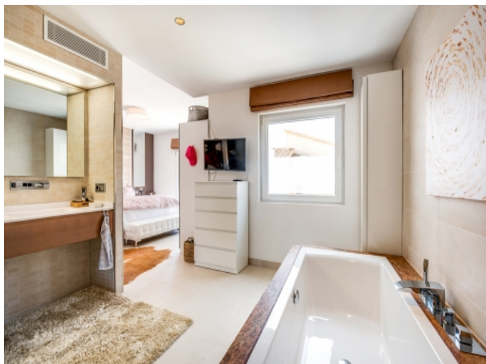
Fantastic bathroom en suite