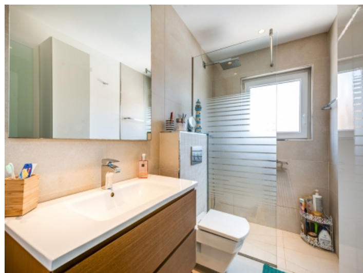
Light flooded bathroom with shower