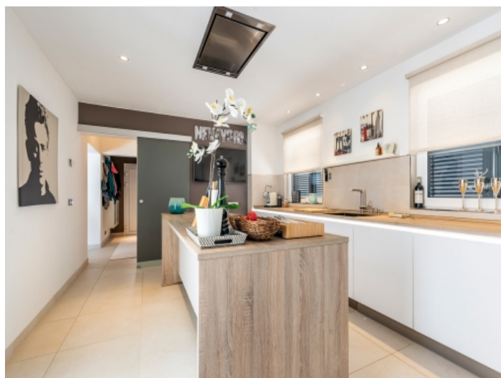
Alternative view of the kitchen