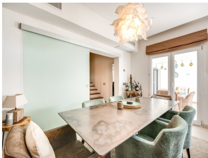
View of the dining area