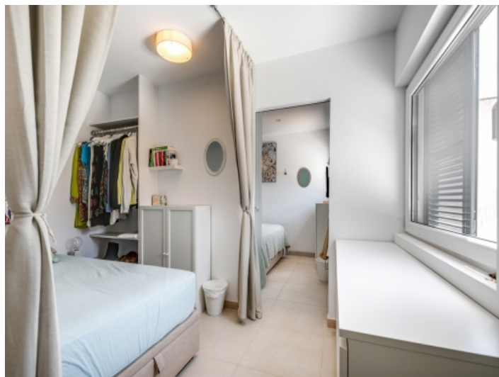
Spacious double bedroom