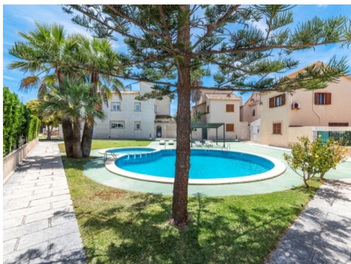
Inviting community pool