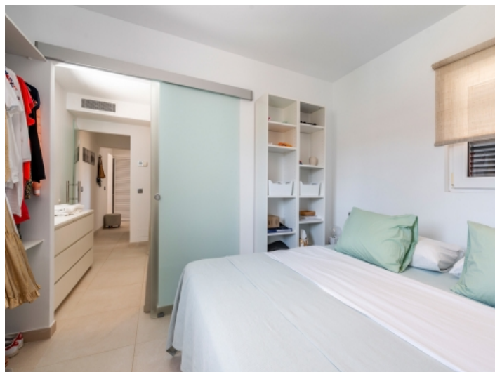
Alternative view of the bedrooms