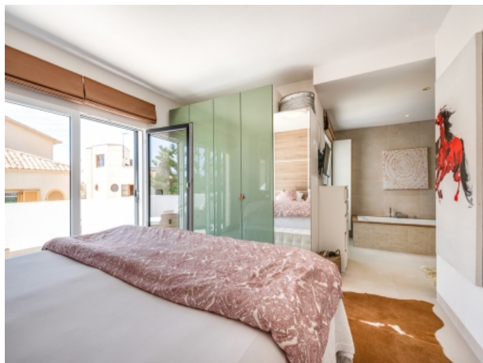
View to the bathroom en suite