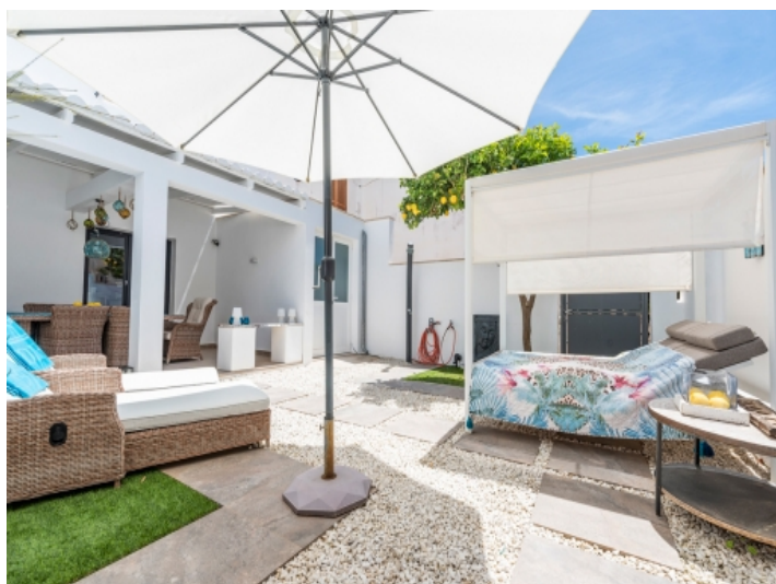
View of the terrace