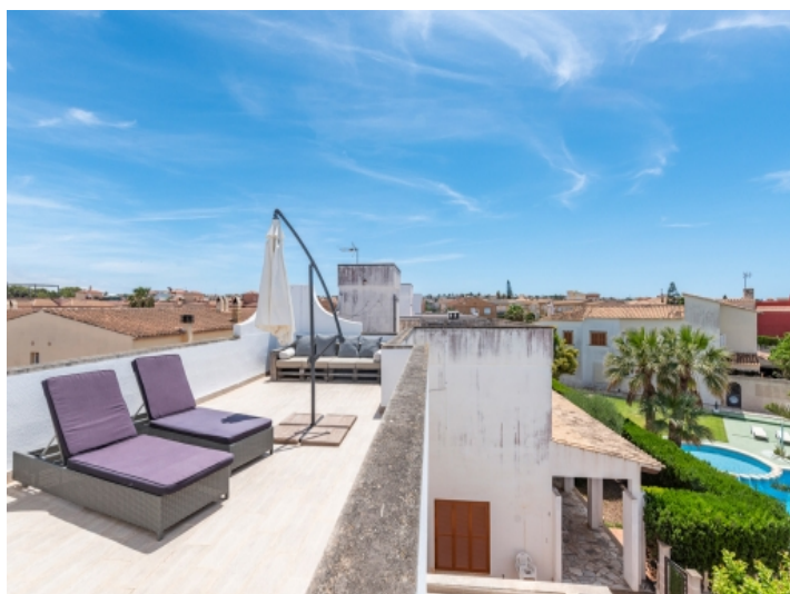
Fantastic roof top terrace