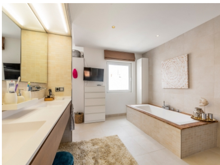
Bathroom with bath tub