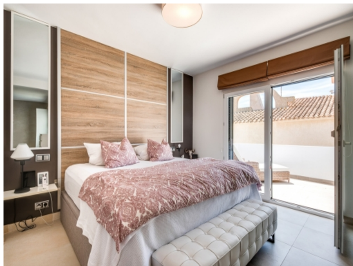
Bedroom with balcony