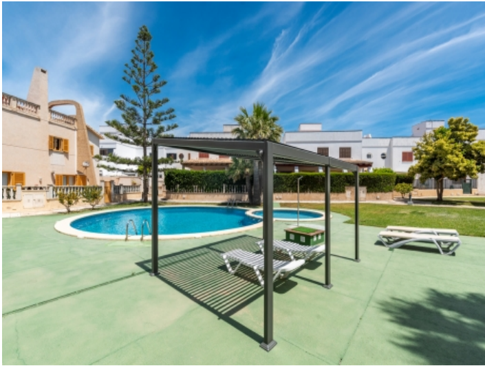
Sun loungers by the pool