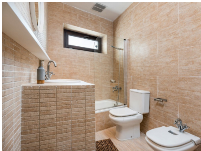
Modern bathroom with bathtub