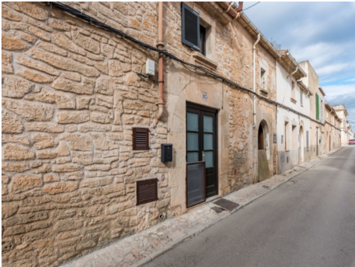
Exterior view of the town house