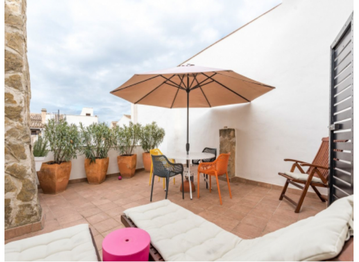
Large terrace on the upper floor