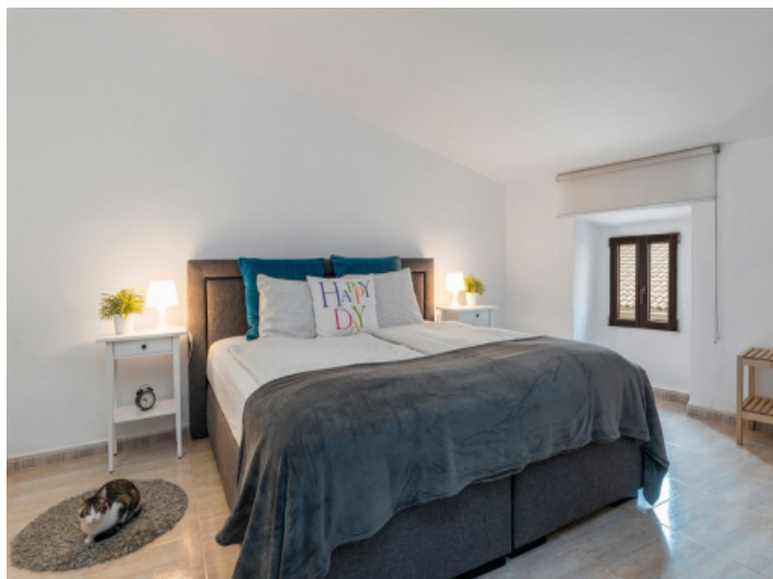
One of 2 double bedrooms