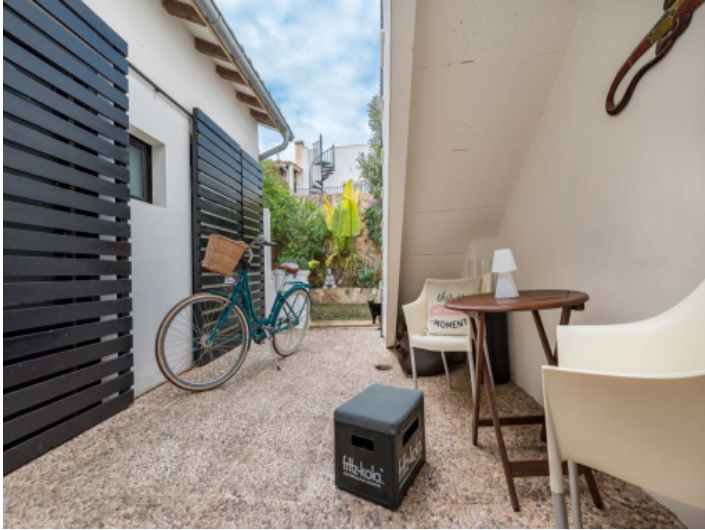
Lovely patio with small garden