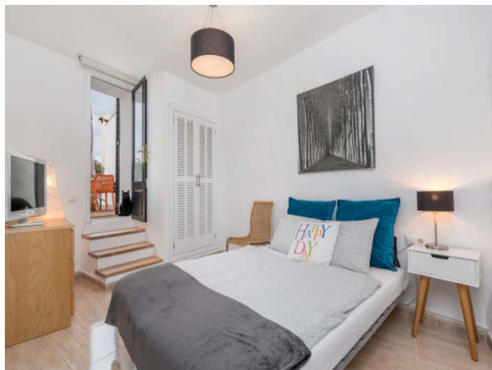
Bedroom with direct terrace access