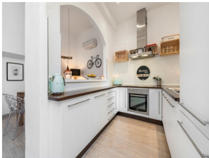
Modern and fully fitted kitchen