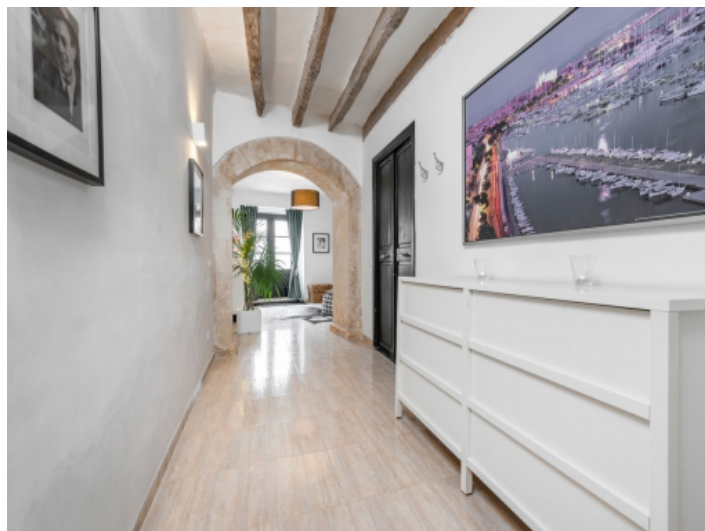
Corridor with authentic stone arch