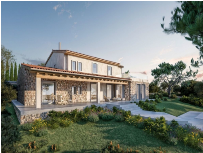
Exterior view and terraces