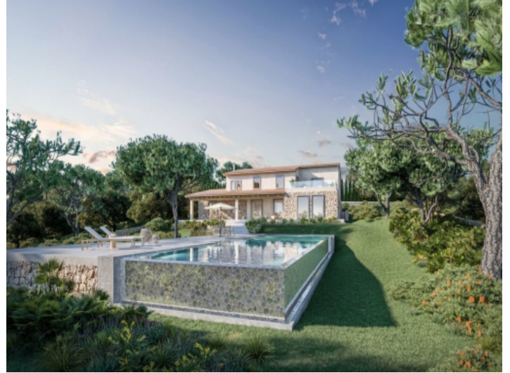
Exterior view and pool area