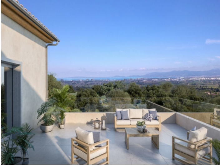
Panoramic views over the bay of Palma