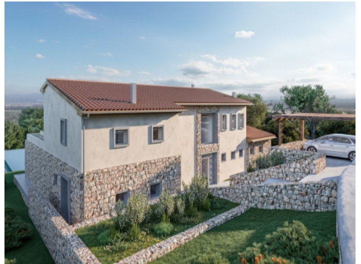
Exterior view and access