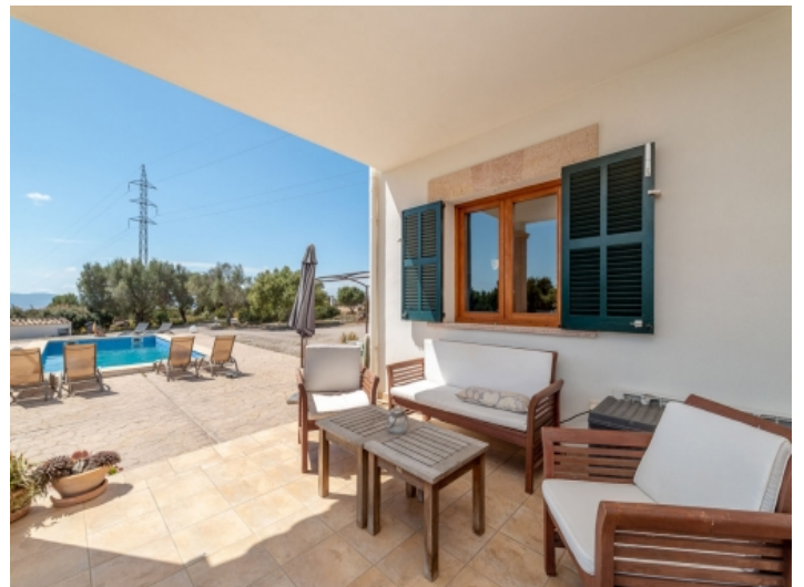
Covered seating area on the terrace