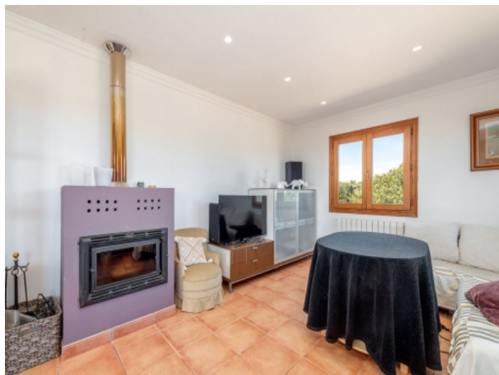
Fireplace for winter days