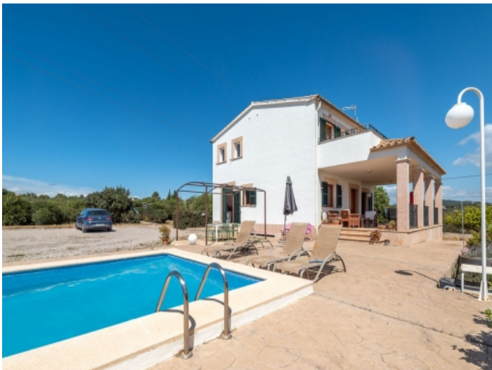
Spacious pool and outdoor area