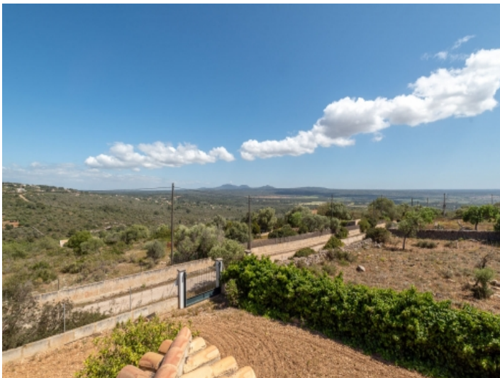
Views over the surrounding landscape