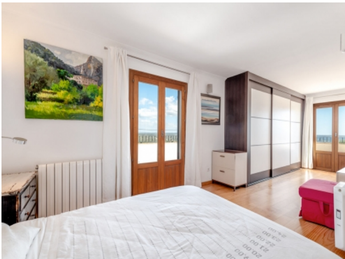
Master bedroom with terrace