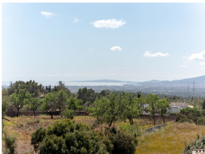
Panoramic views to the bay of Palma