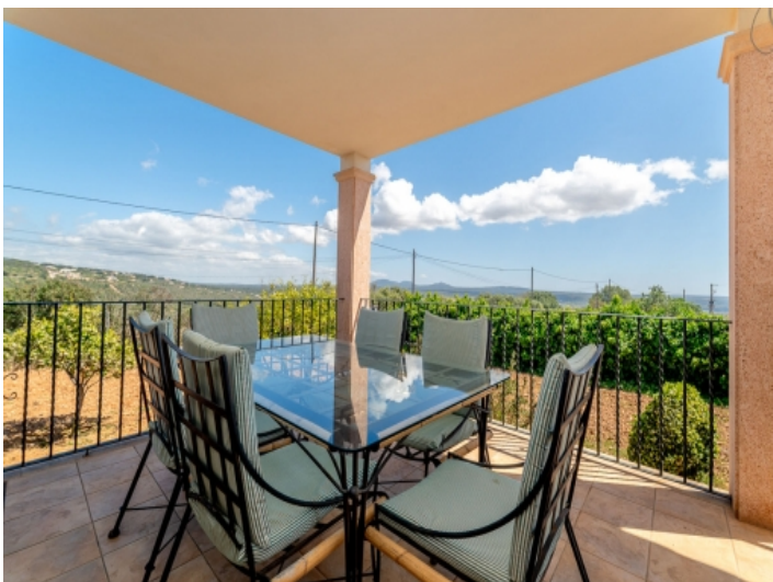
Outdoor dining area