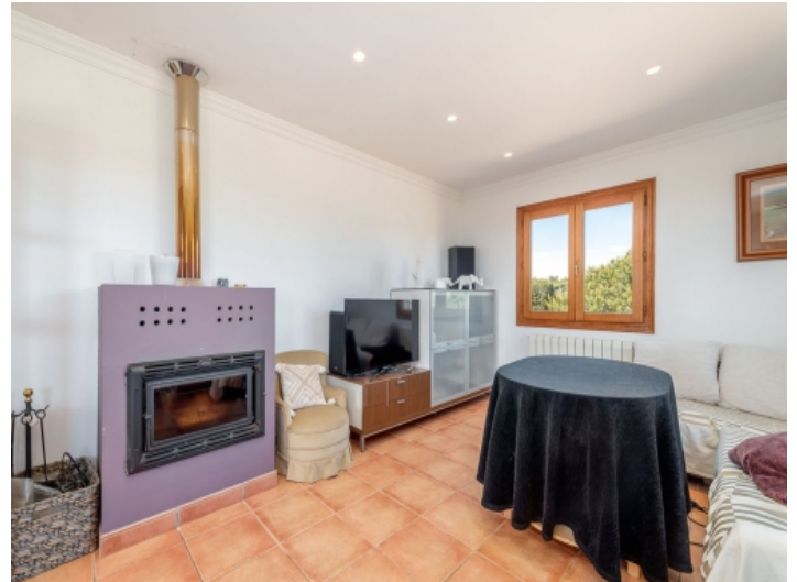
Fireplace for winter days