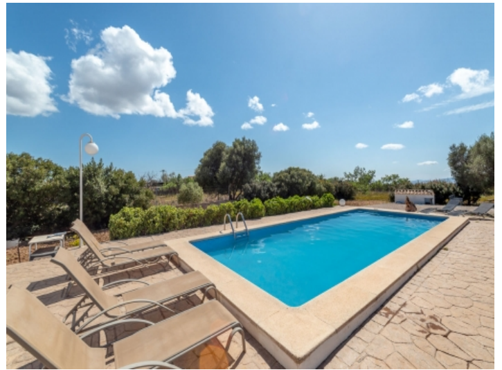
Beautiful pool area