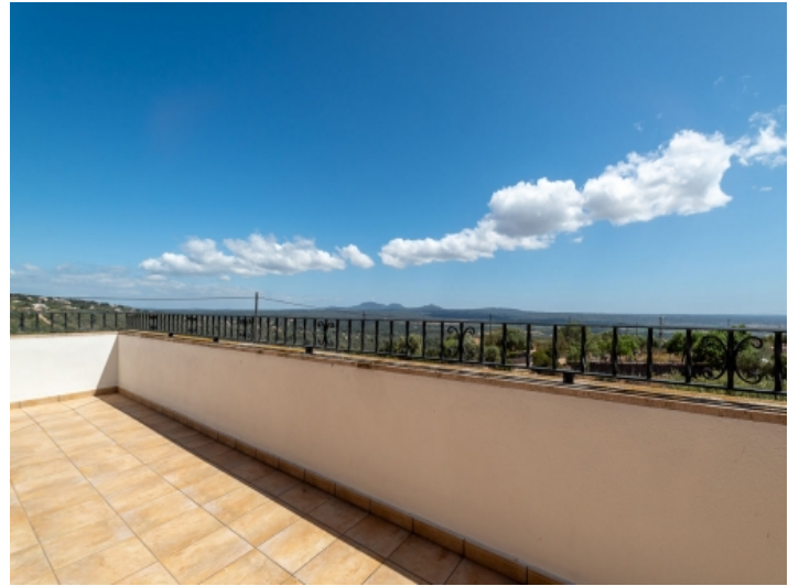
Upper terrace with sweeping views