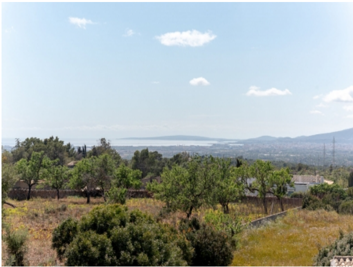
Panoramic views to the bay of Palma