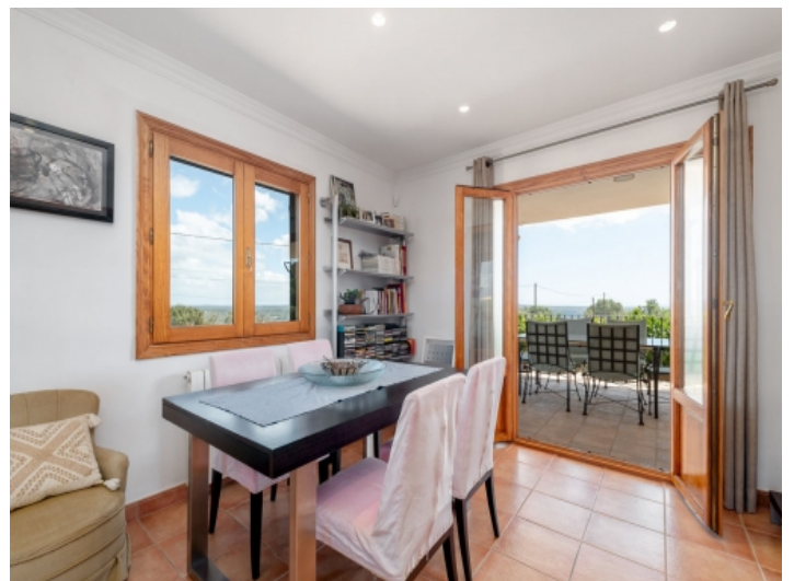
Dining area with terrace access