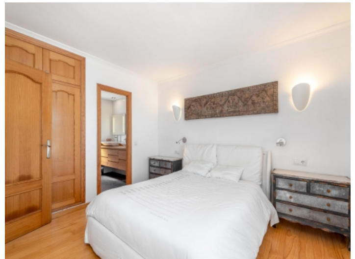
Master bedroom with bathroom