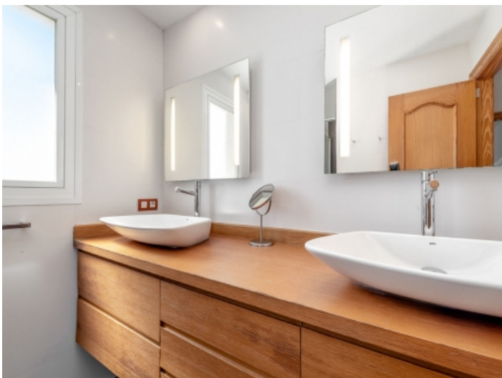
Modern en suite bathroom