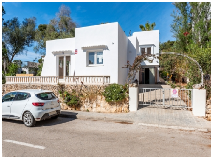
Exterior view from the street