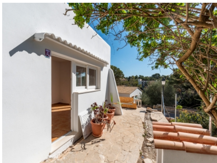
Access to the second bungalow