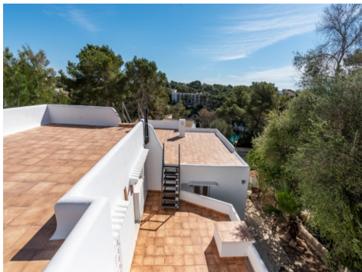
Various roof terrace