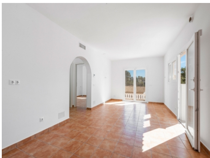
Loghtflooded living area