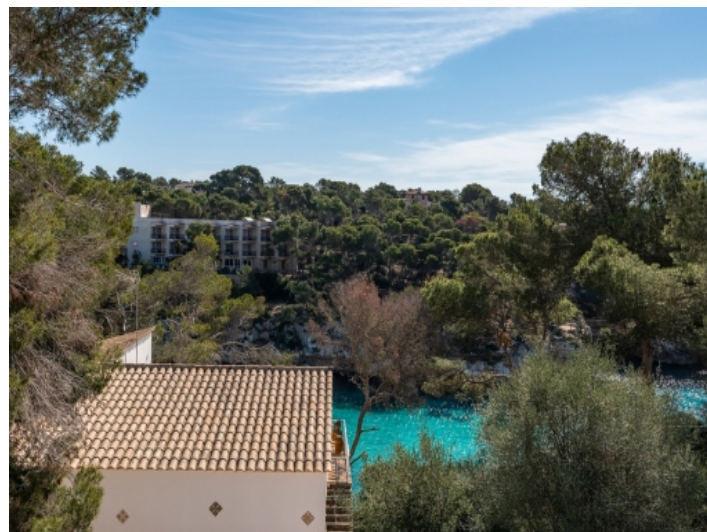
Beautiful sea views