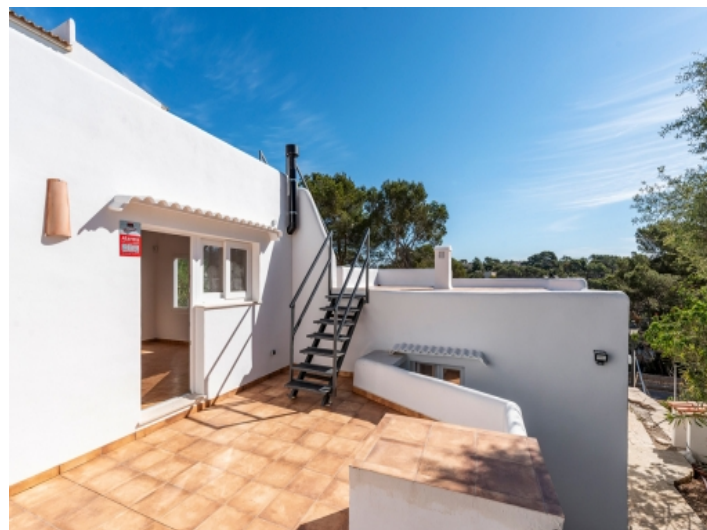
Terrace with upper bungalow