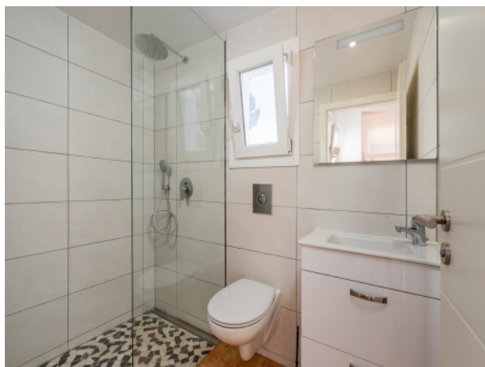
New shower bathroom