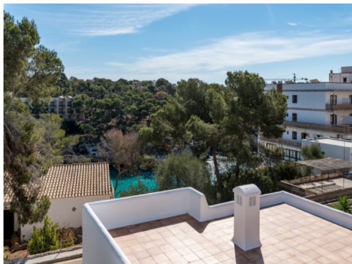
View to the bay