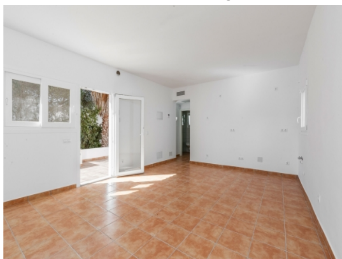
Alternative view of the bungalow