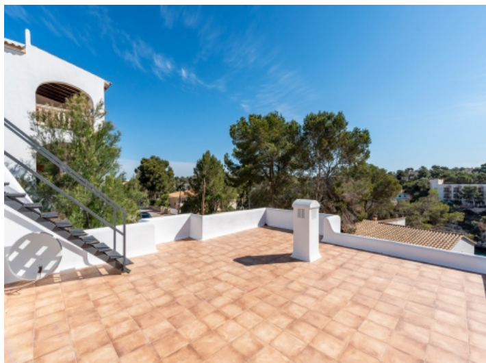
Sunny roof terrace