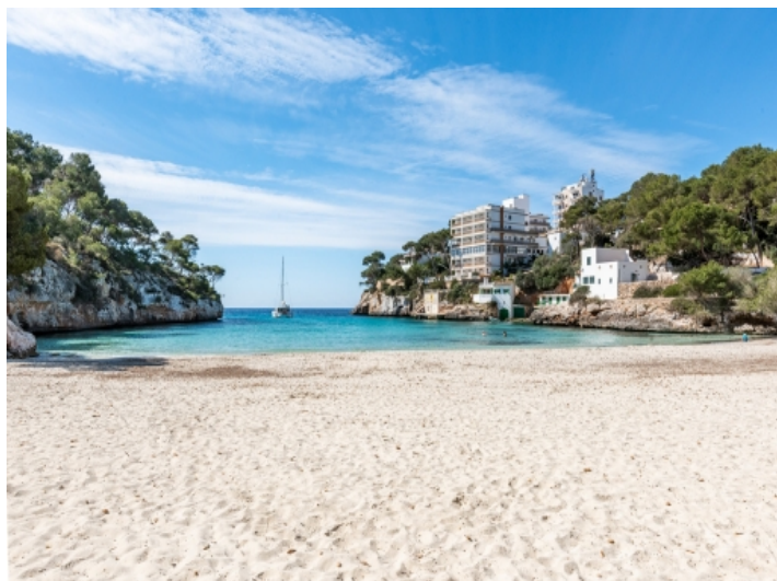
Beach of Cala Santanyi