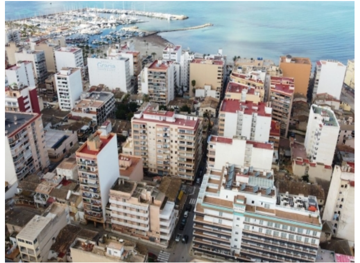
Birds' eye view of the location