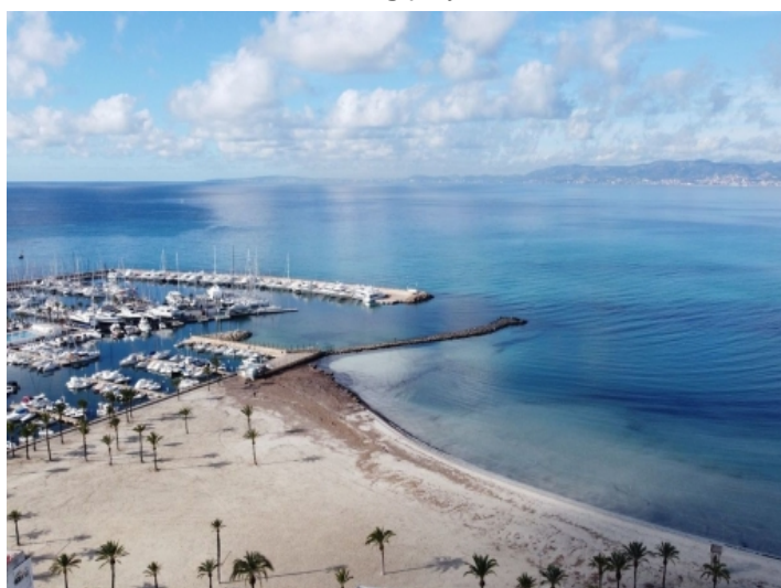
View to the beach