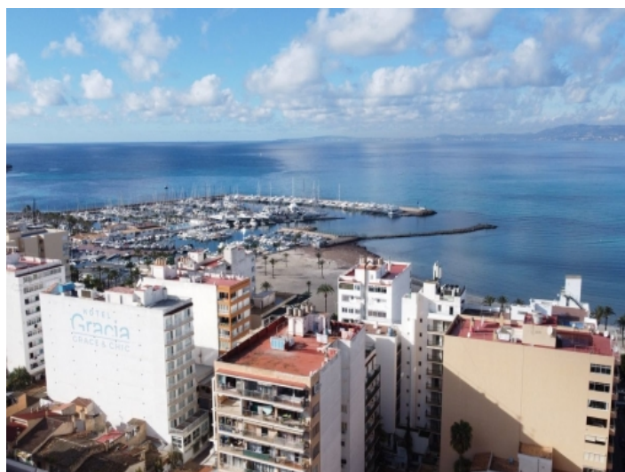
View over S'Arenal