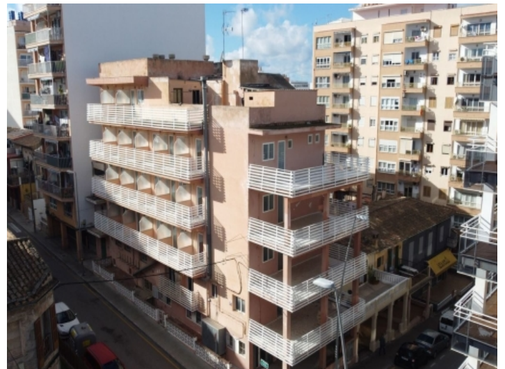
Side view of the building