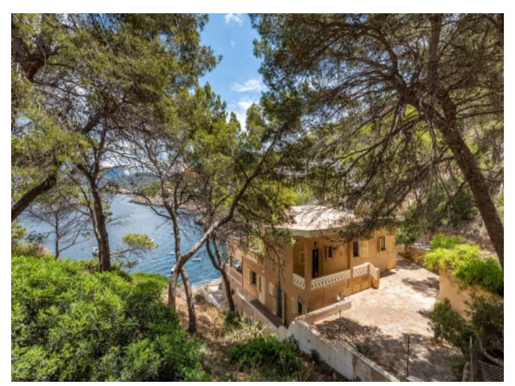
Villa situated directly at the sea