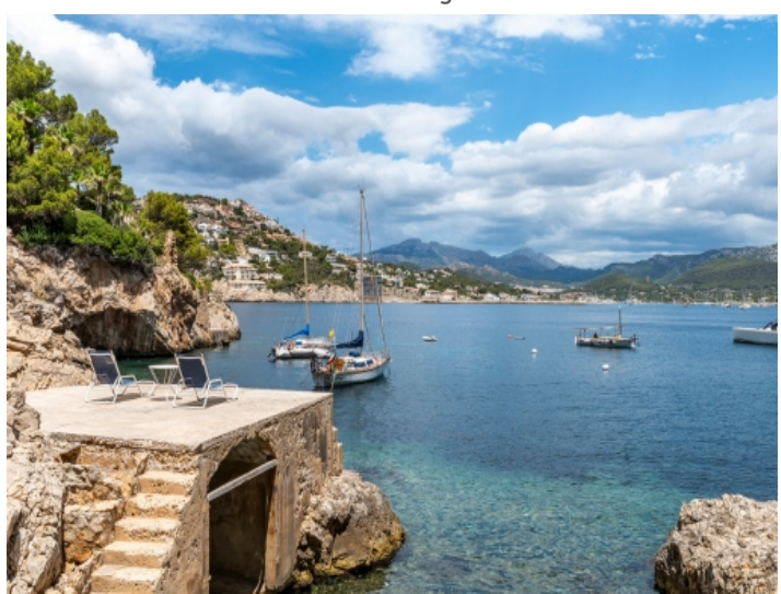
Inviting sea view terrace