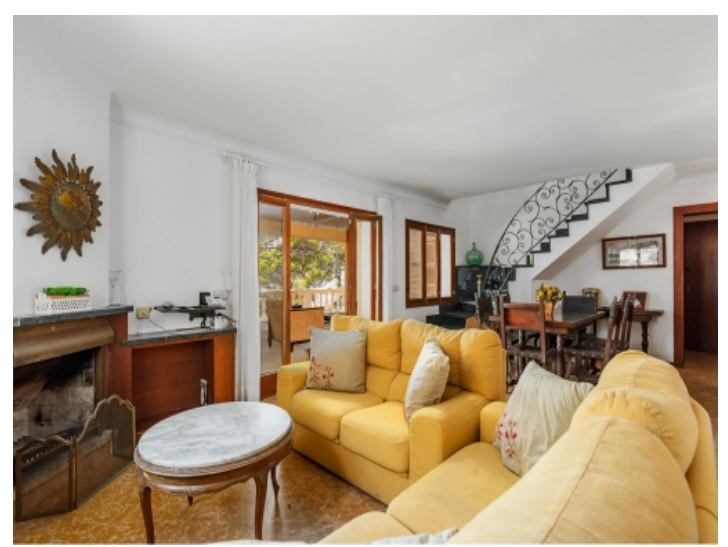
Living area on the ground floor