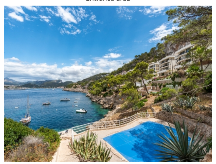
Private access to the sea