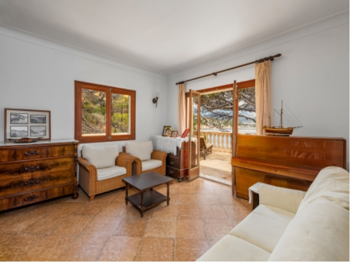
View of the upper living area