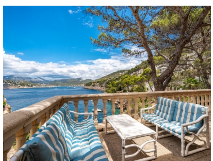
View to the sea