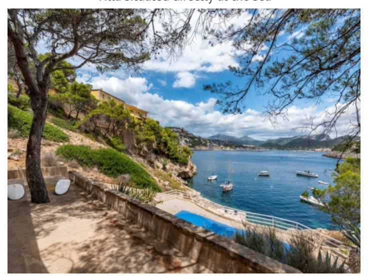
Access to the pool