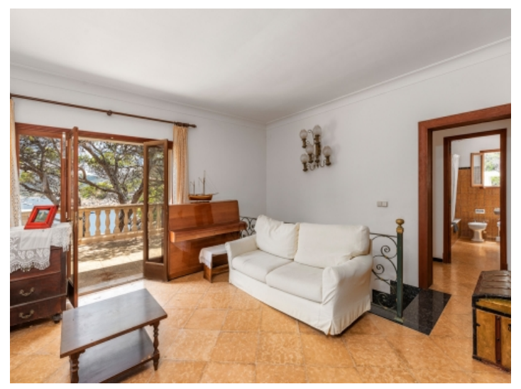
View of the upper living area