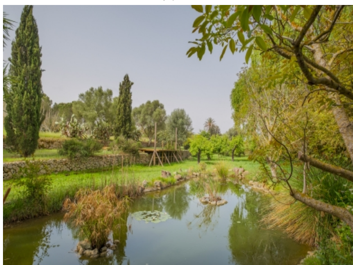
View of the garden