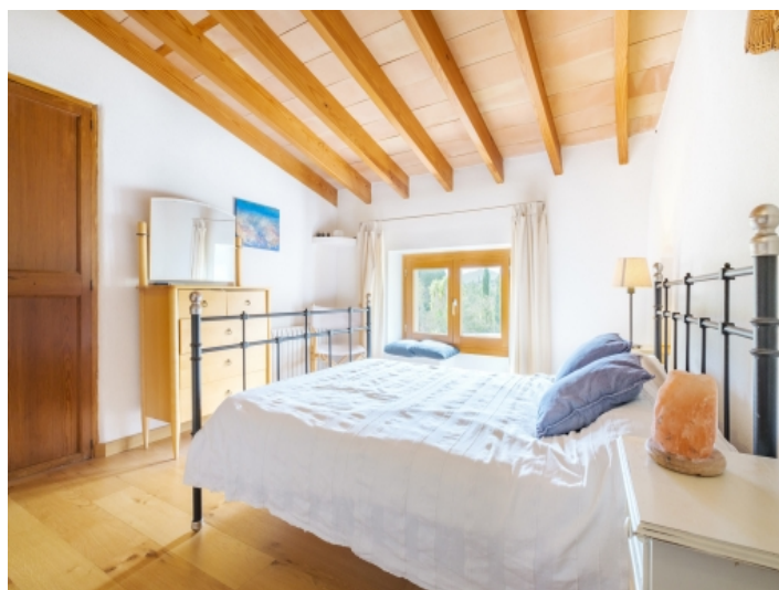
One of 7 bedrooms