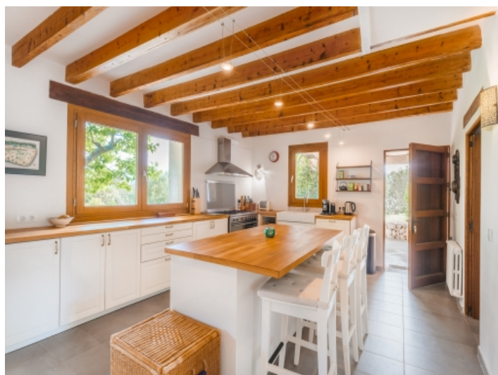
Large modern kitchen