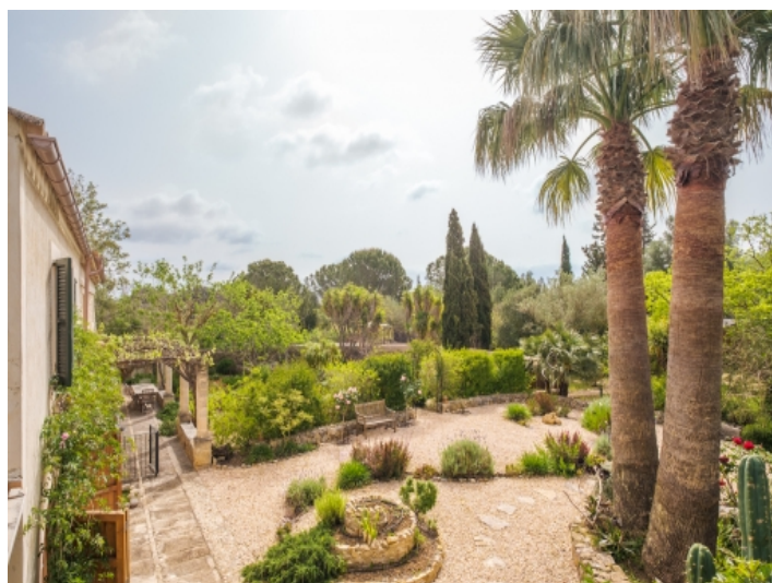
View of the garden