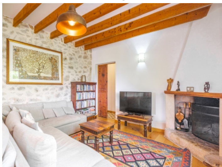
Living area with fire place