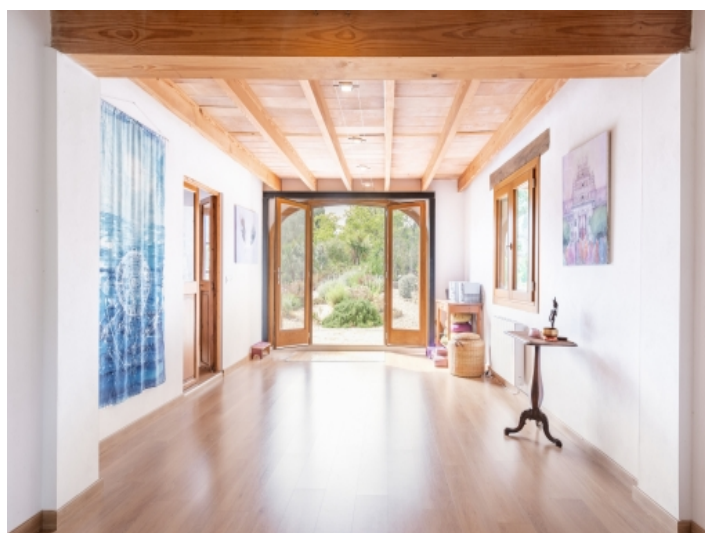
Yoga room to relax