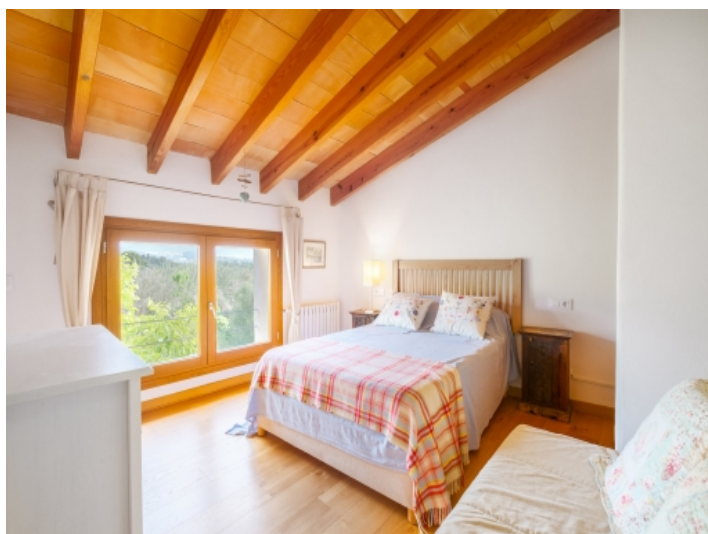
One of 7 bedrooms