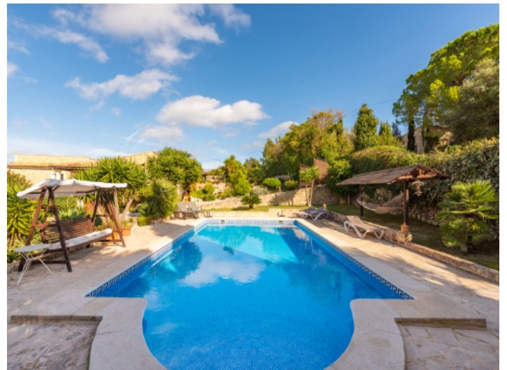
Pool is surrounded by a terrace