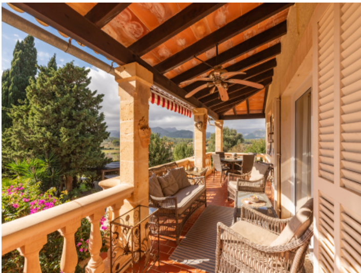
Covered terrace with mountain views