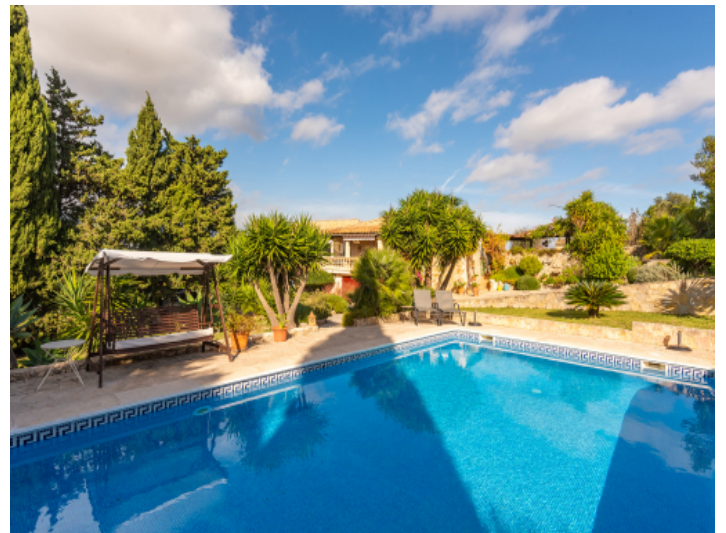
Idyllic pool area