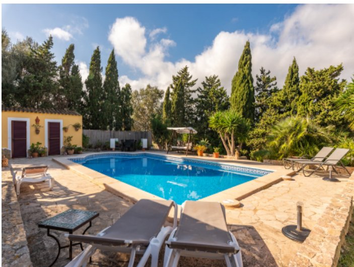
Views from the pool to the pool house