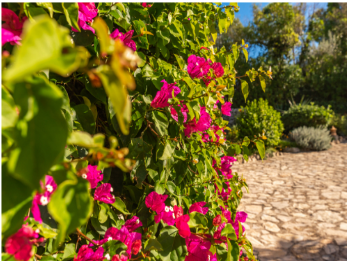
Well-tendet garden with a lot of fantastic deatils