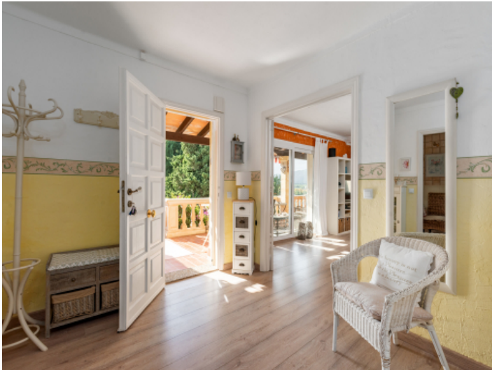
Entrance from the finca