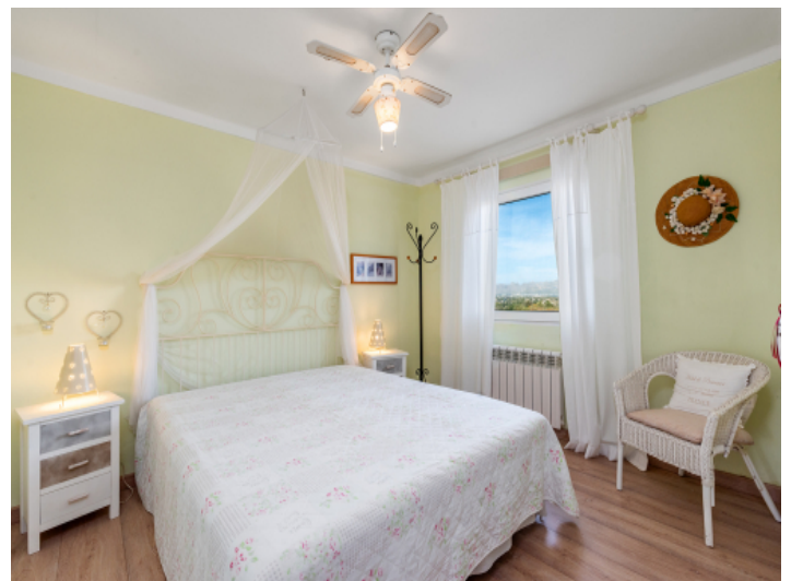
Bedroom with heating