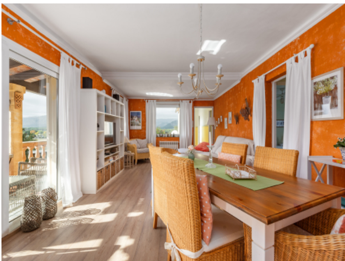
Dining area with balcony access