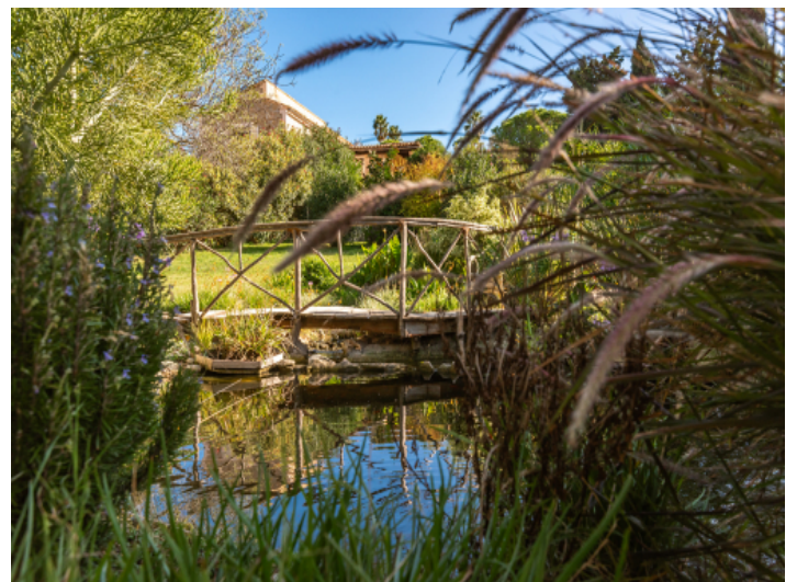
Fish pond from the finca