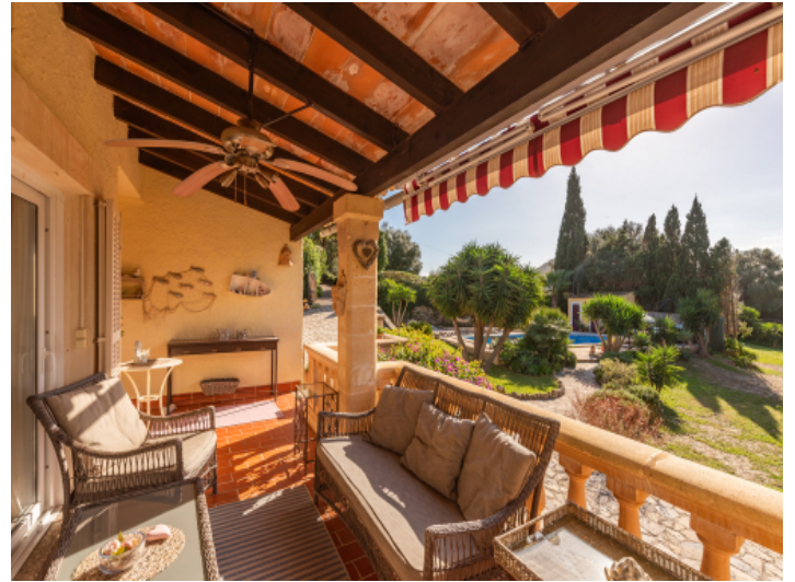
Large covered terrace with comfortable seating