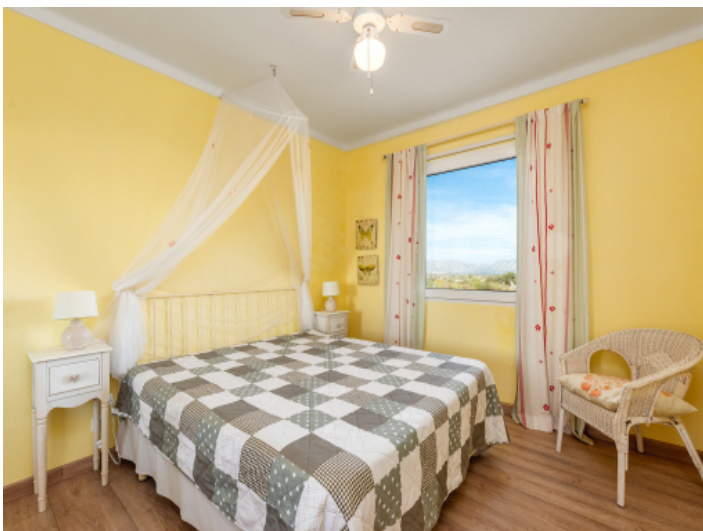
Bedroom with facn