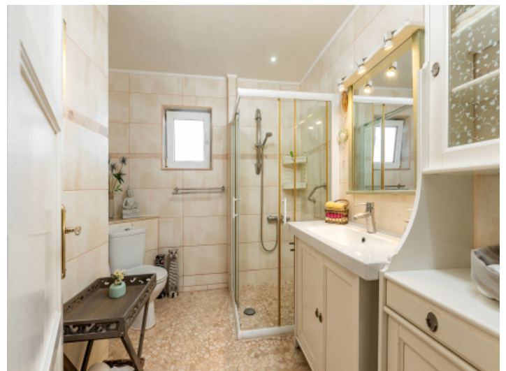
Bathroom with shower and daylight