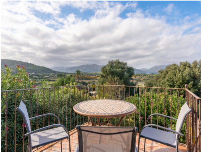
Unique landscape views from the balcony