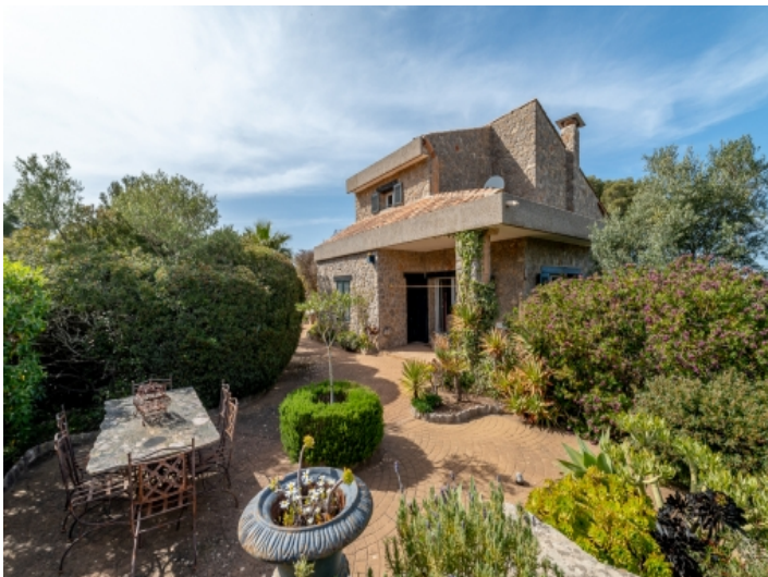
Charming terrace surrounded by plants