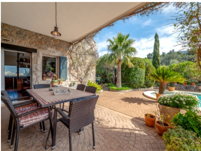
Covered dining area with pool views