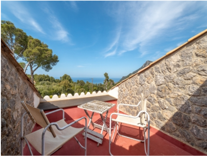
Roof terrace with sea views