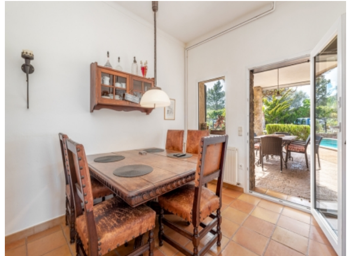
Dining area with terrace access