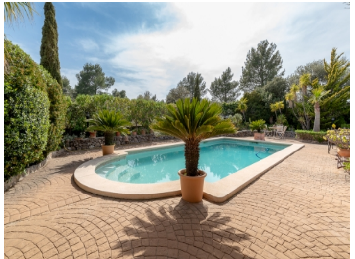
Pool area in absolute privacy