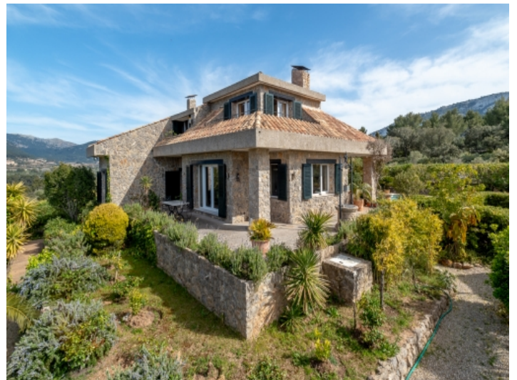
Exterior view of the stone finca