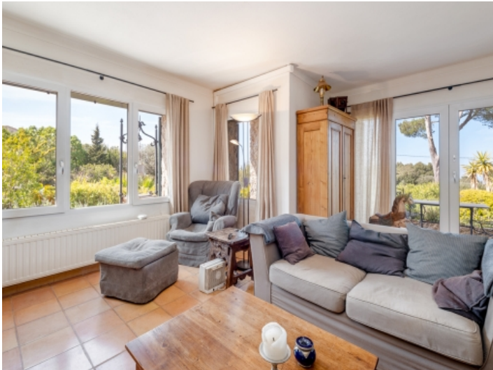
Living area with garden views