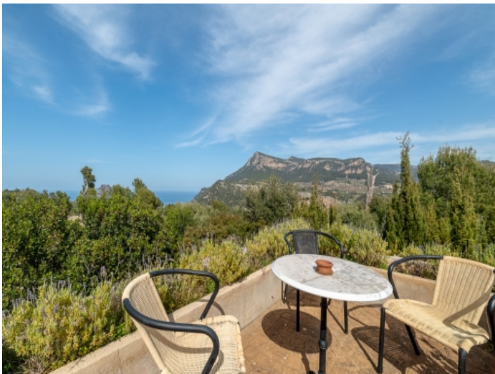
Further terrace with lovely views