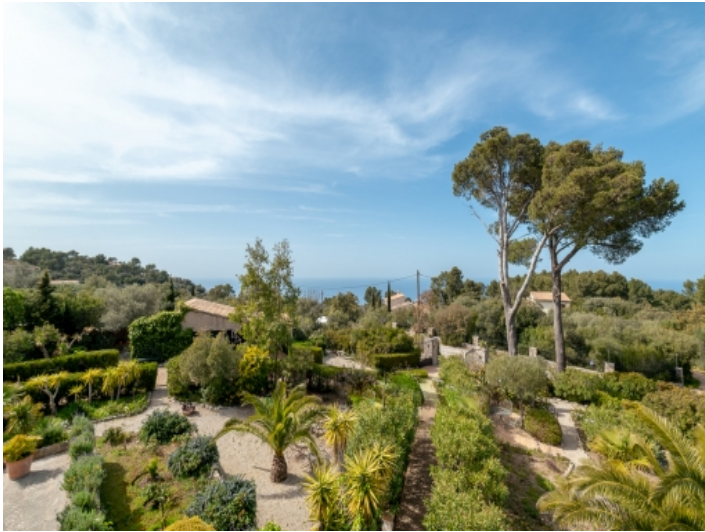
View over the plot as far as the sea