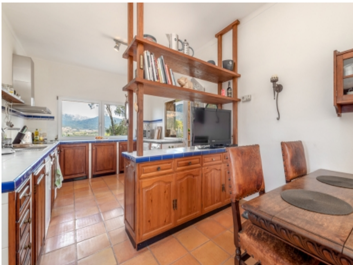
Rustic kitchen and dining area