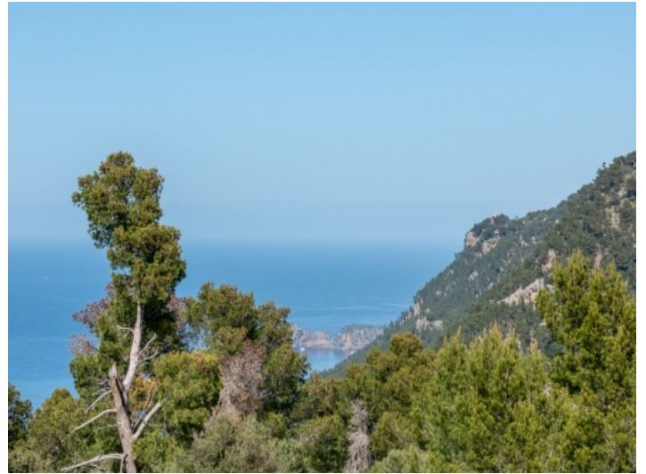
Beautiful panoramic sea views