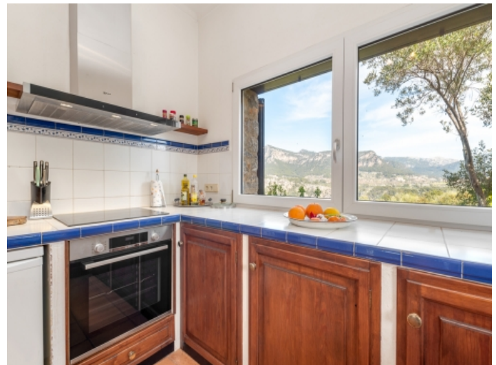
Mountain views from the kitchen