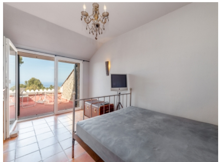
Bedroom with own terrace