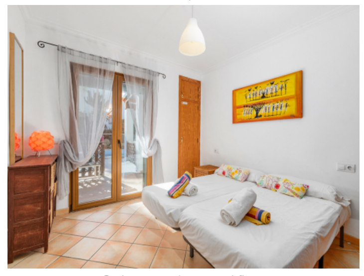
Bedroom on the ground floor