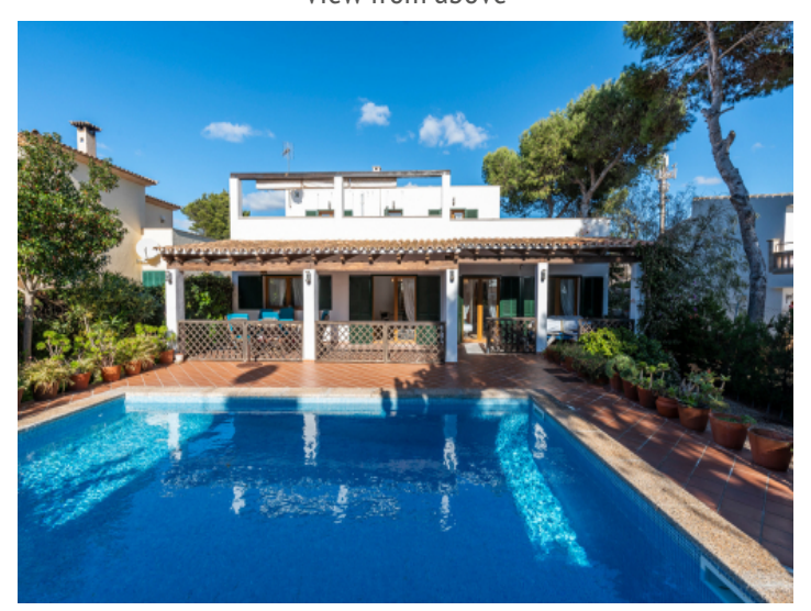
Pool area with terrace and plants