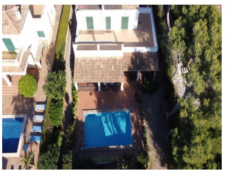
The villa from a birds-eye view