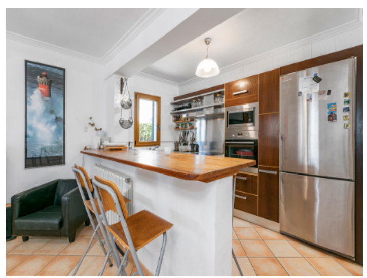
Kitchen with bar table