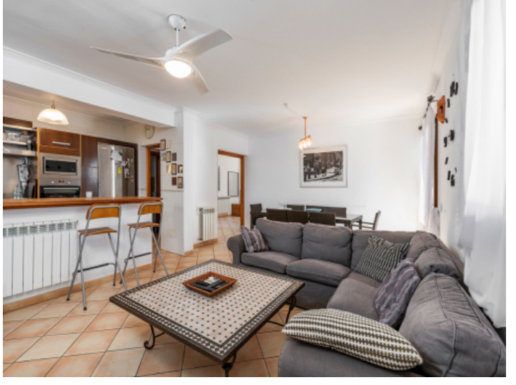
Open living, dining and kitchen area