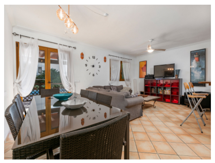
Access to the pool terrace