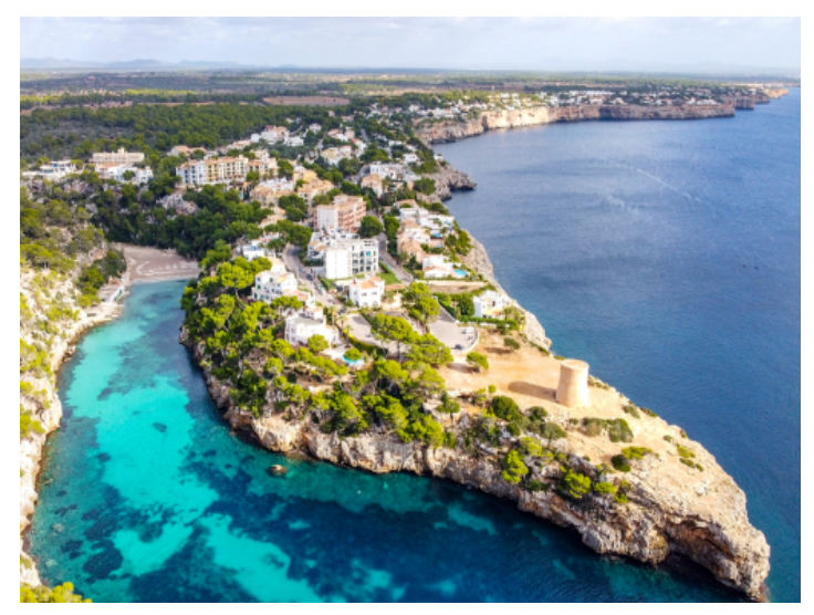
Cala Pi from above