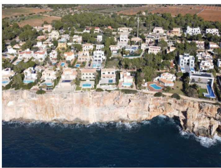
Close to the sea