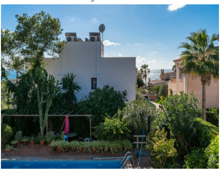
View as far as the sea