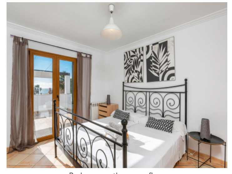
Bedroom on the upper floor