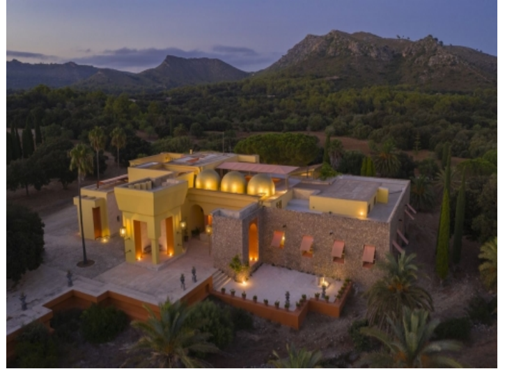
Exterior view by night