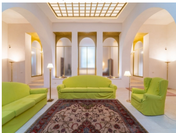
Extraordinary interior design