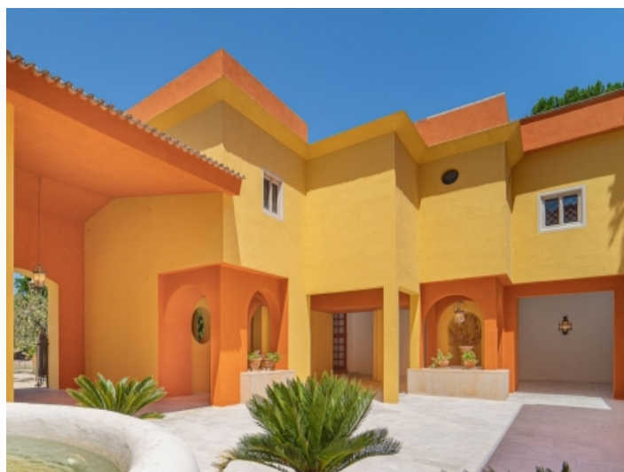
Exterior view and outdoor terrace