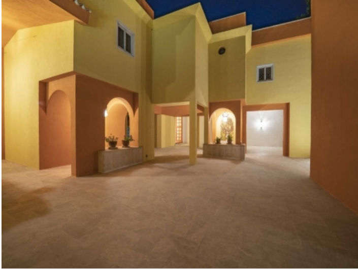
Exterior view and outdoor terrace