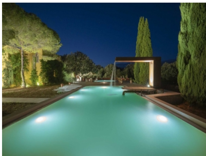
Large, dreamlike pool area