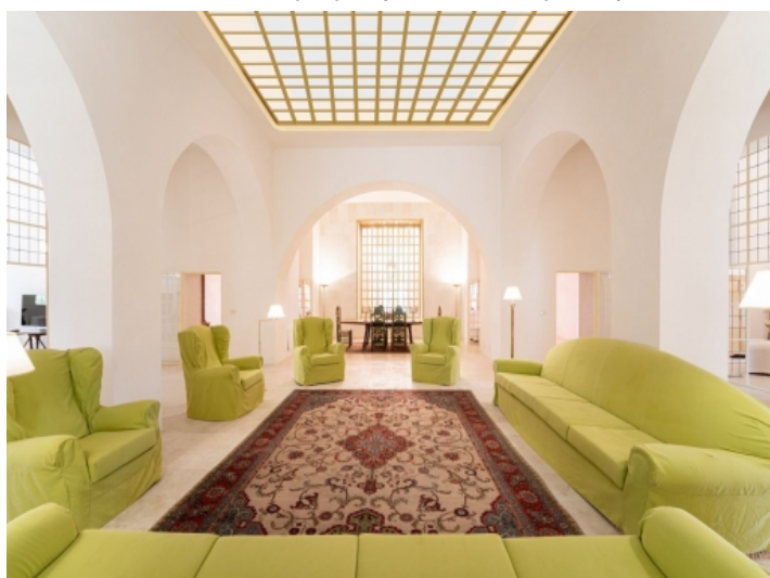
Luxurious living area