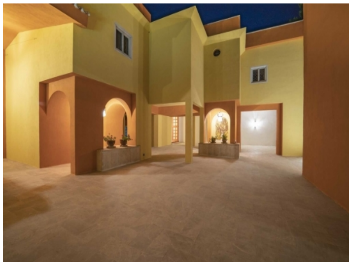
Exterior view and outdoor terrace