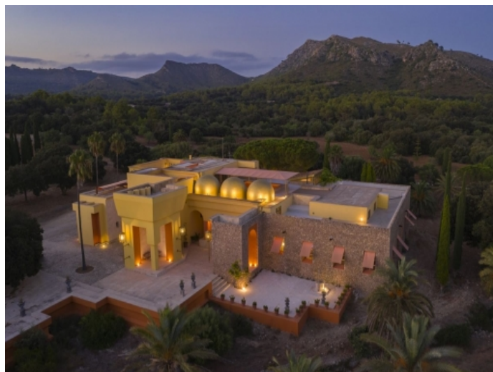
Exterior view by night