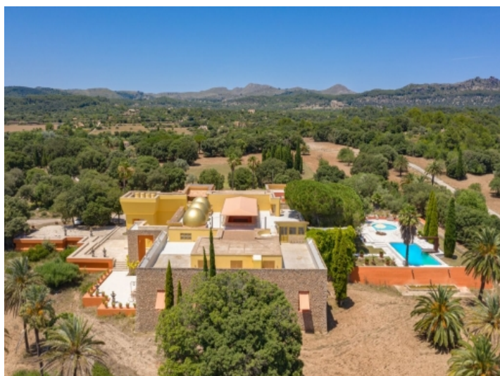
View of the property in absolute privacy