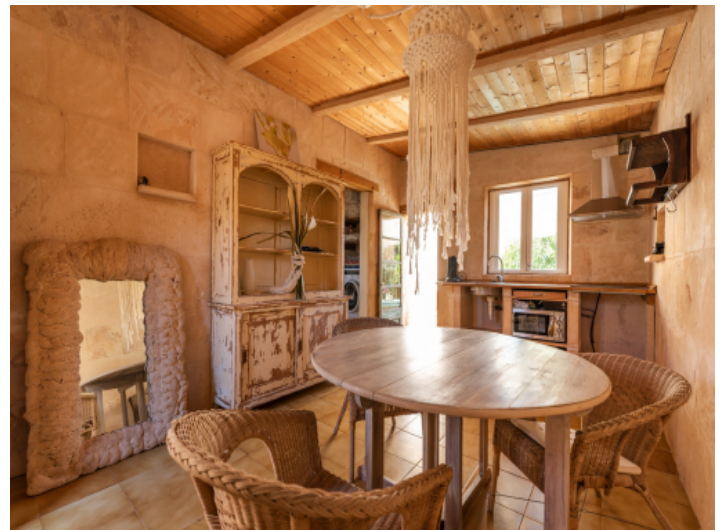
Summer house with kitchen