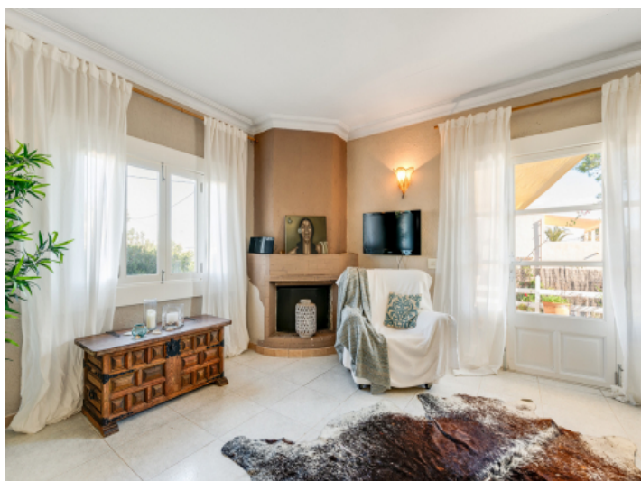
Cozy fireplace for winter days