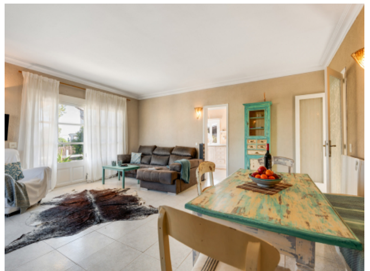
Adjoining dining area