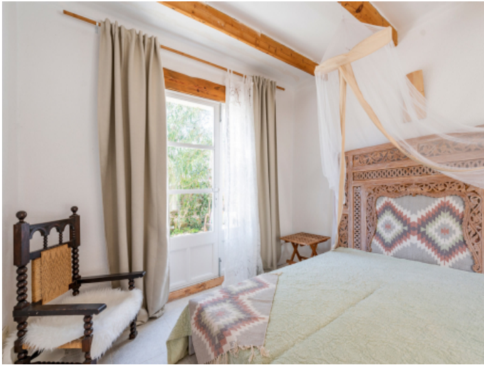
Direct terrace access