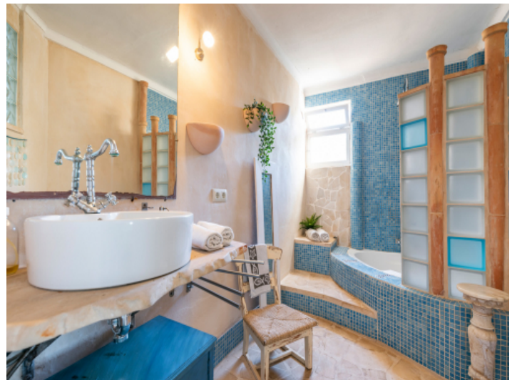
Beautifully bathroom with bathtub