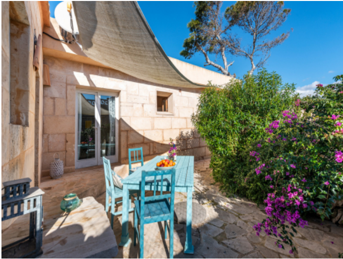
Charming terrace wit seating area