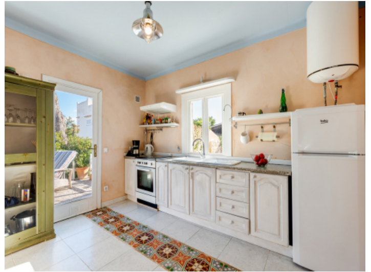
Bright kitchen with terrace access