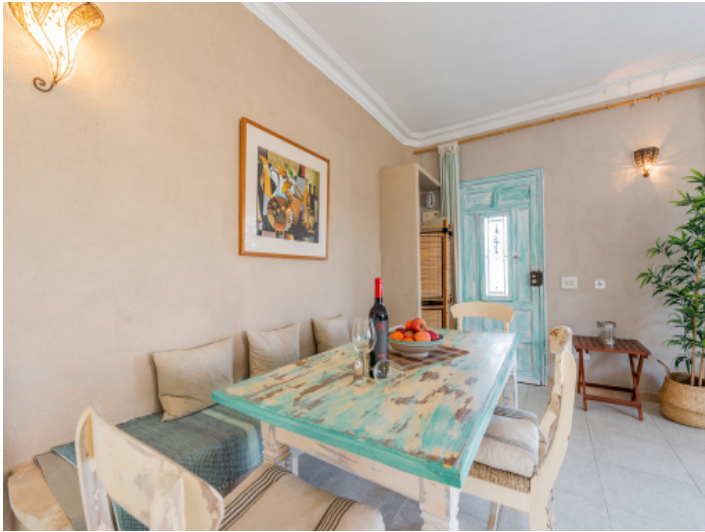
Dining area next to the entrance