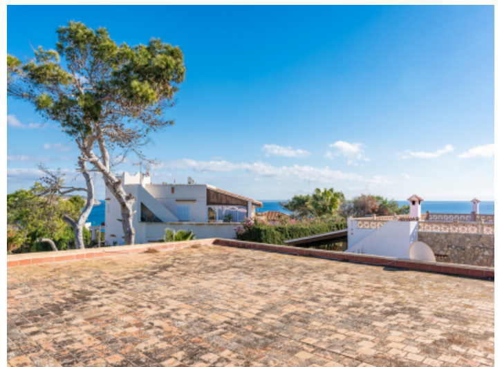
Roof terrace with sea views