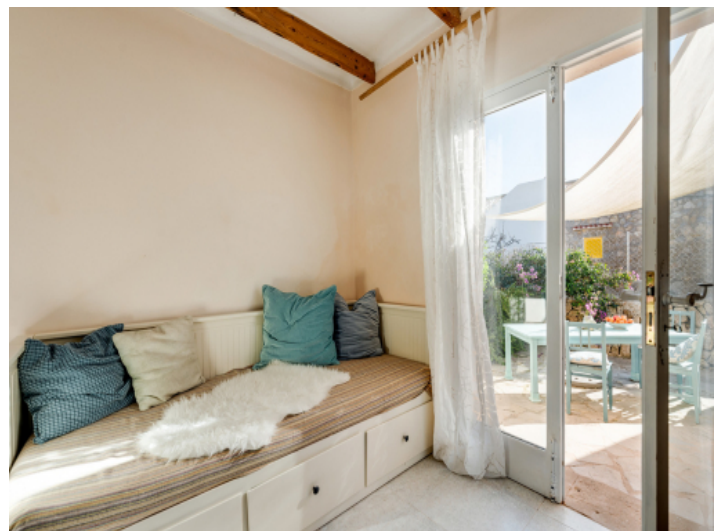
Access to a further terrace