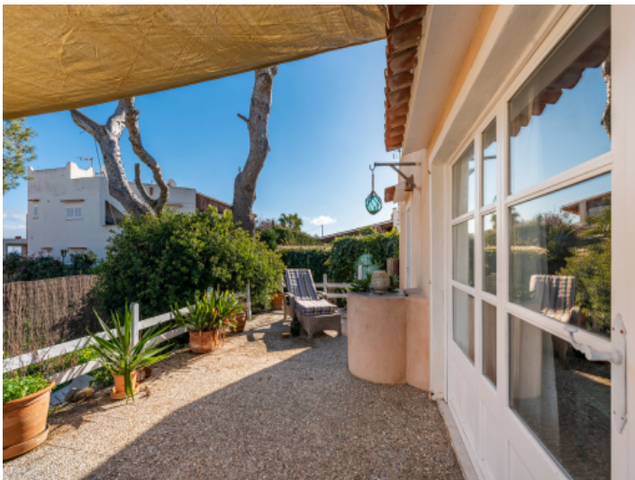
Access to the house