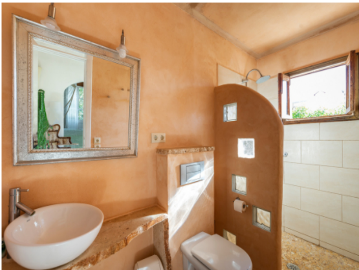
Bright shower bathroom