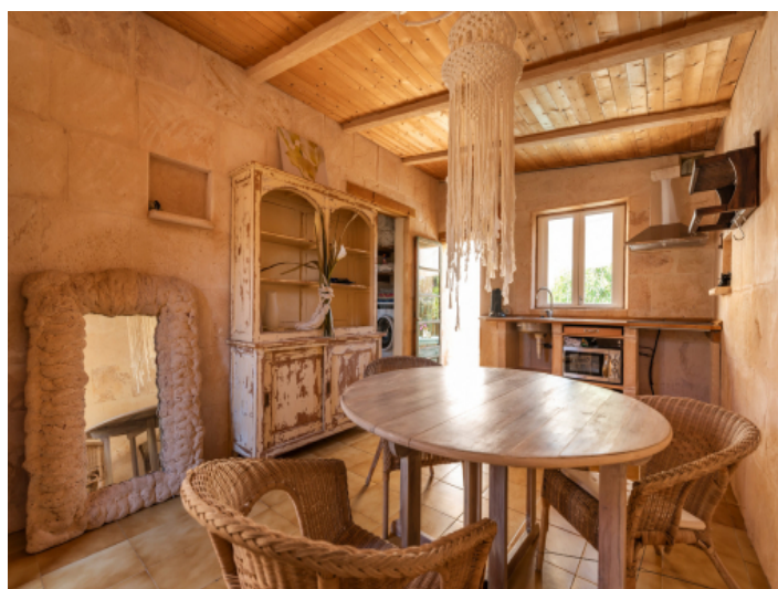
Summer house with kitchen