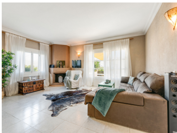
Beautiful living area with terrace access