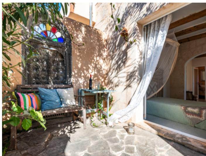
Terrace with a lot of character