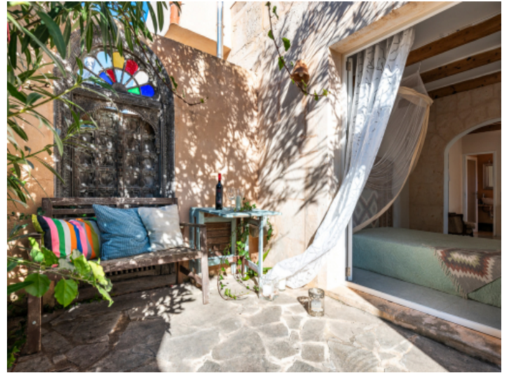
Terrace with a lot of character