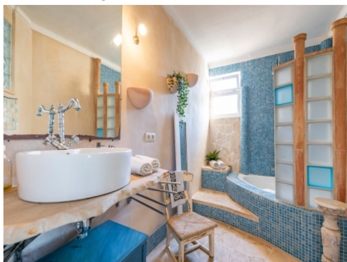
Beautifully bathroom with bathtub