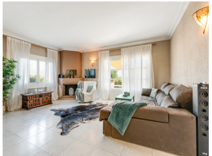
Beautiful living area with terrace access