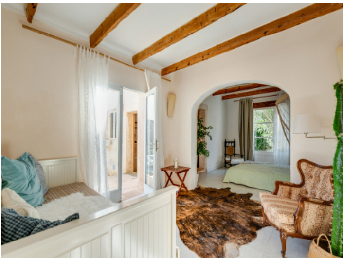
Large bedroom with lounge area