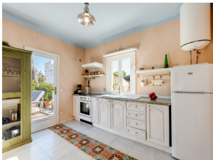
Bright kitchen with terrace access