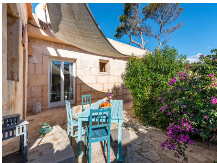
Charming terrace wit seating area