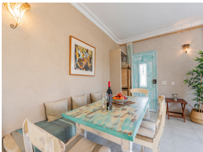
Dining area next to the entrance