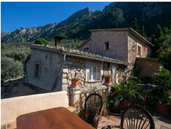
Terrace and outdoor area