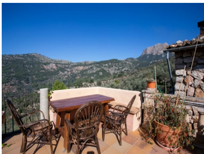
Terrace with wonderful mountain views