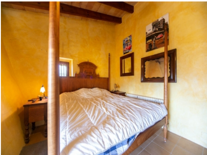
One of 3 bedrooms