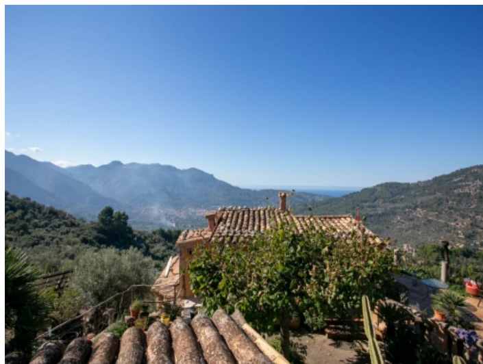
Finca in an unique location