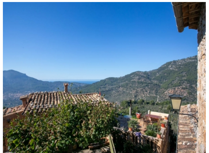
Wonderful outdoor area