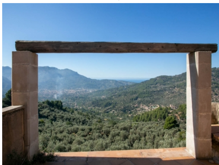
Fantastic sweeping views