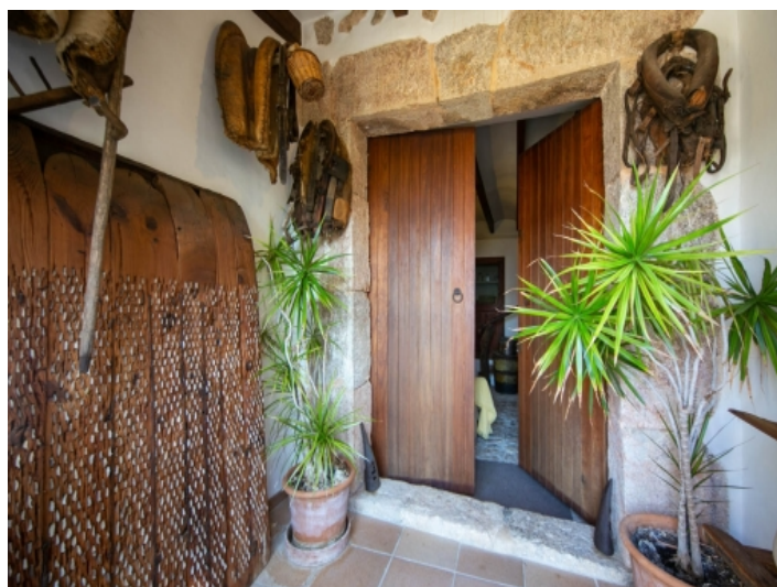
Entrance to the house