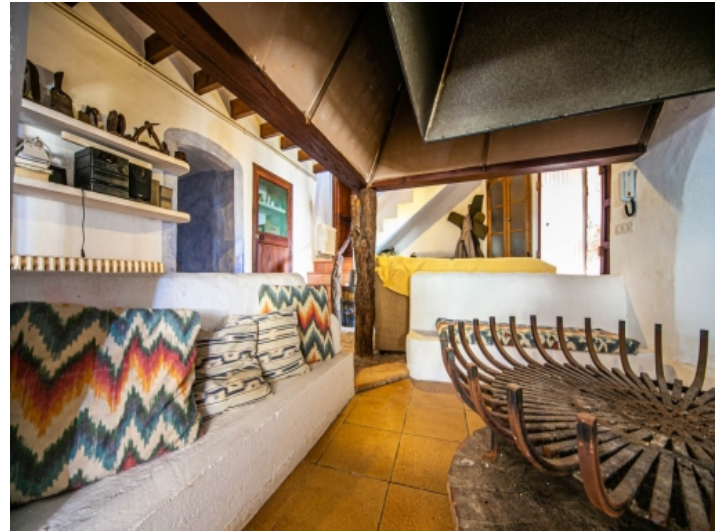
Large fireplace area