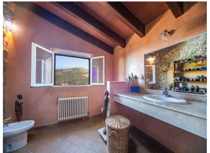
One of 2 bathrooms