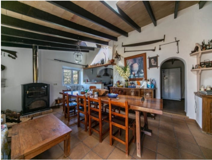
Rustic dining area and kitchen