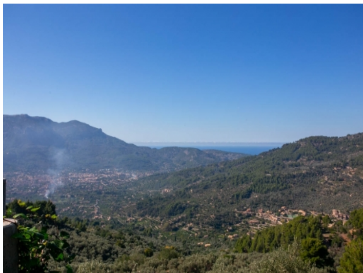
Panoramic views as far as the sea