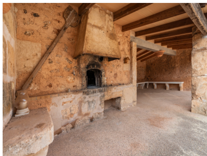
Covered outdoor kitchen