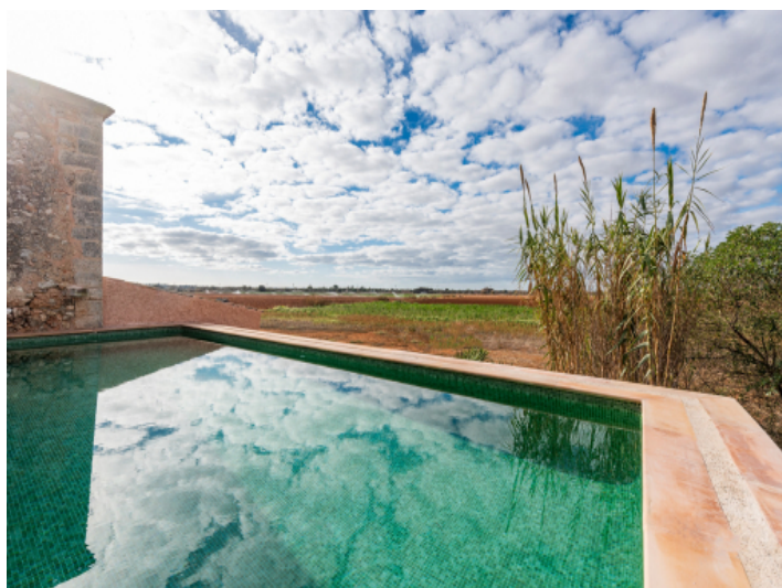
Landscape and pool views