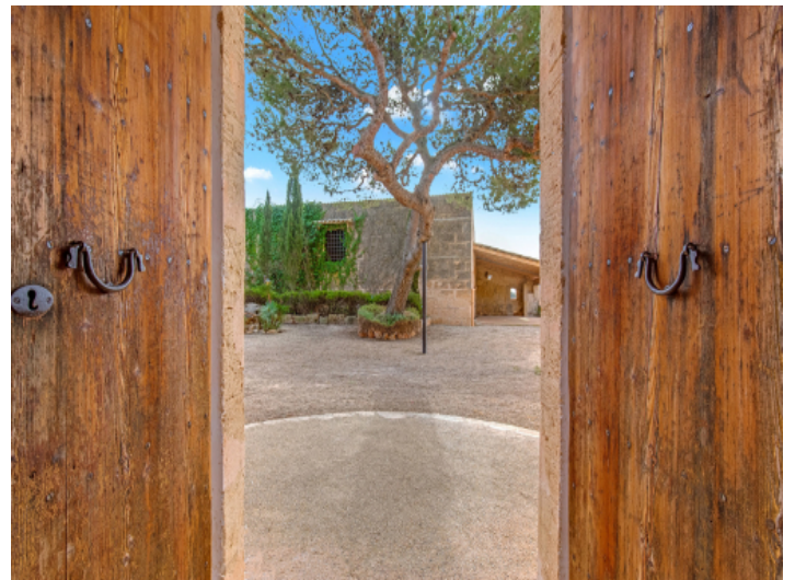
Access tot the patio