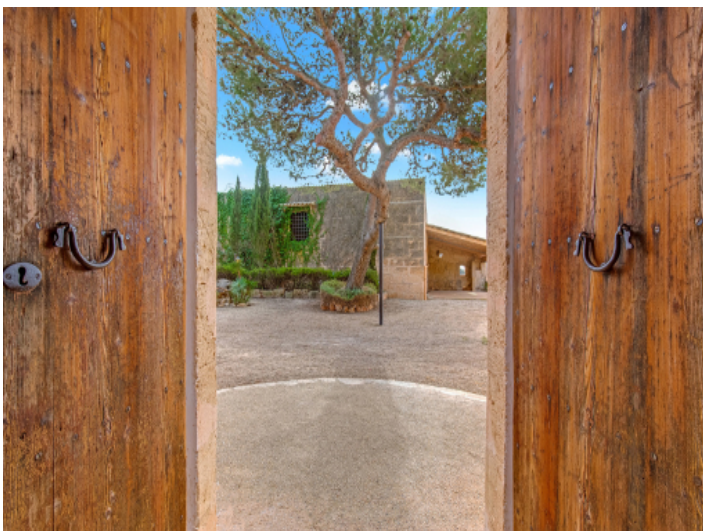
Access tot the patio