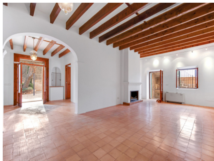
Large living area with fire place