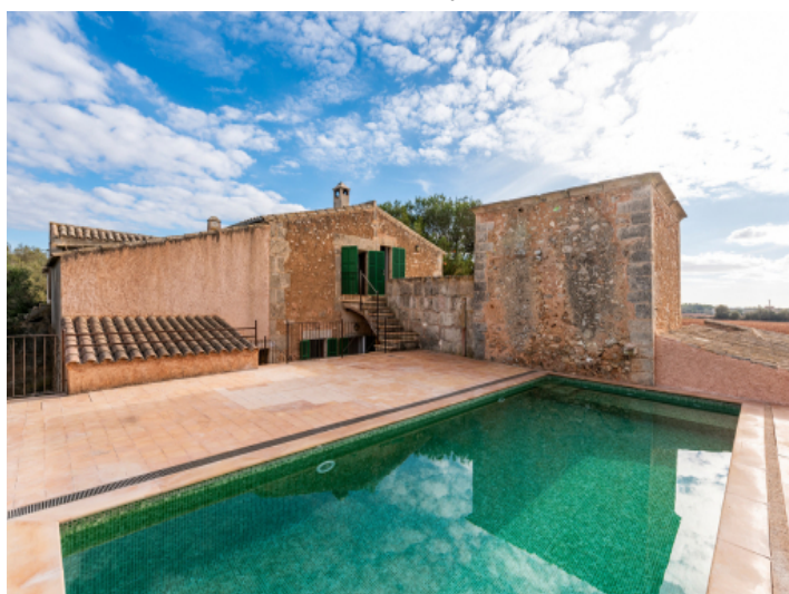
Private pool area