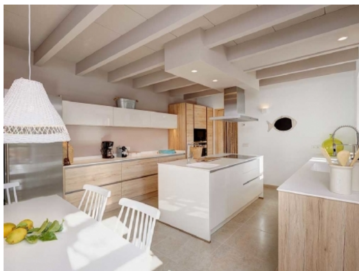
Modern kitchen with dining area