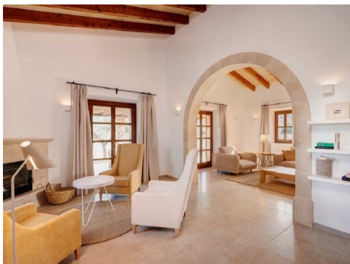
Fireplace corner with stone arch