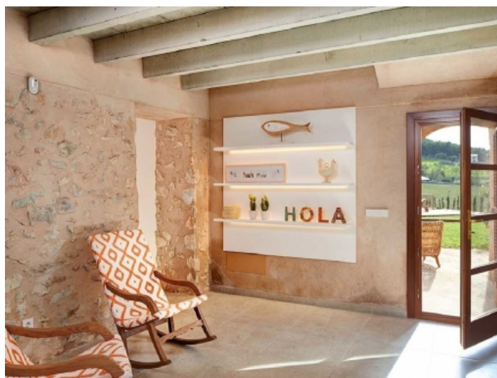
Access to the terrace