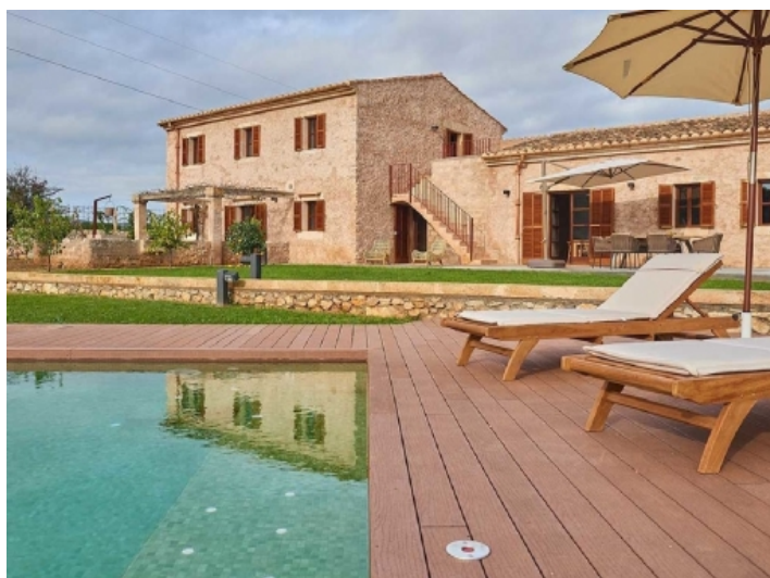
Wonderful, private pool area