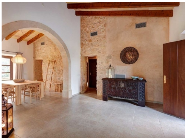
Entrance and dining area with stone wall