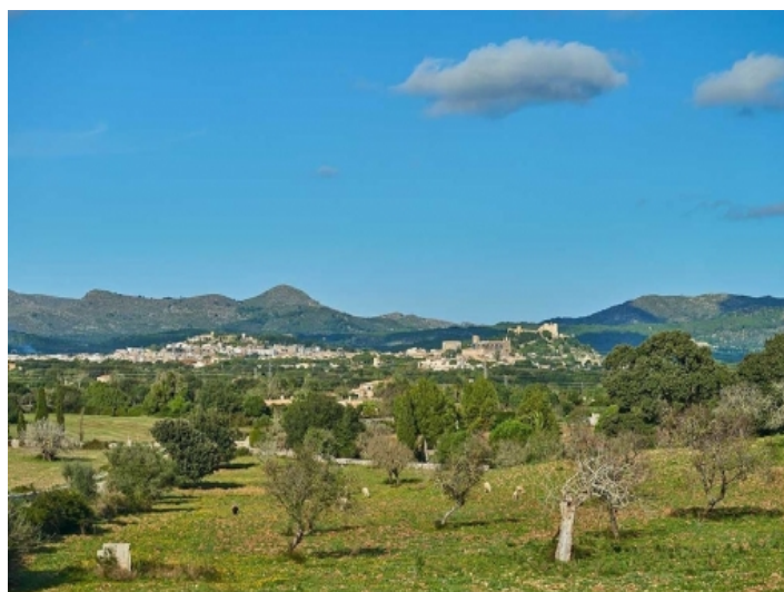
Impressive views to Arta