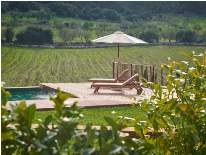
Pool surrounded by pure nature