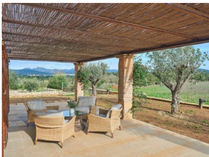
Large, covered terrace