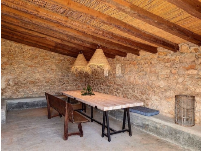
Rustic outdoor dining area