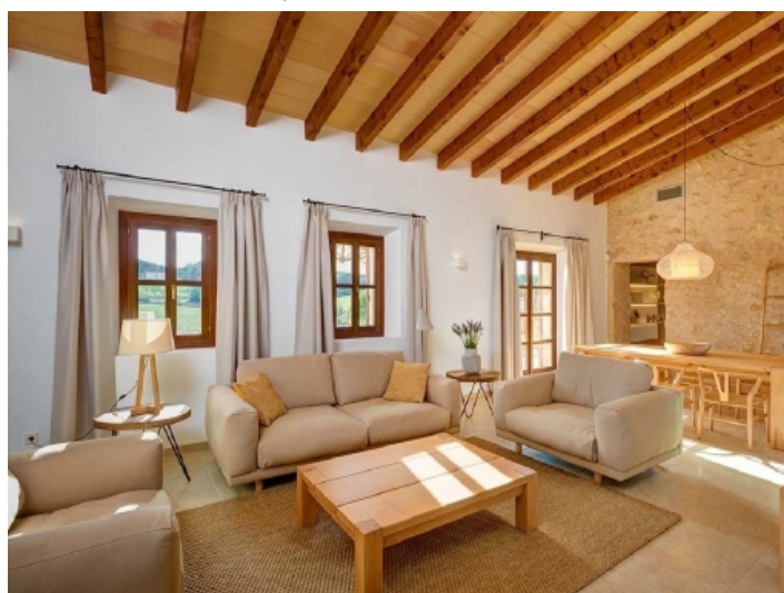
Generous living area