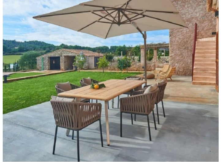
Terrace with beautiful dining area