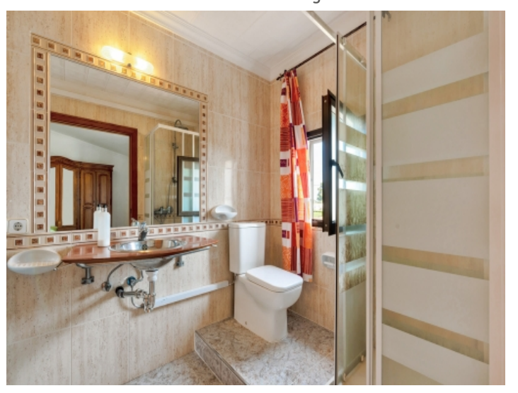
Shower bathroom en suite