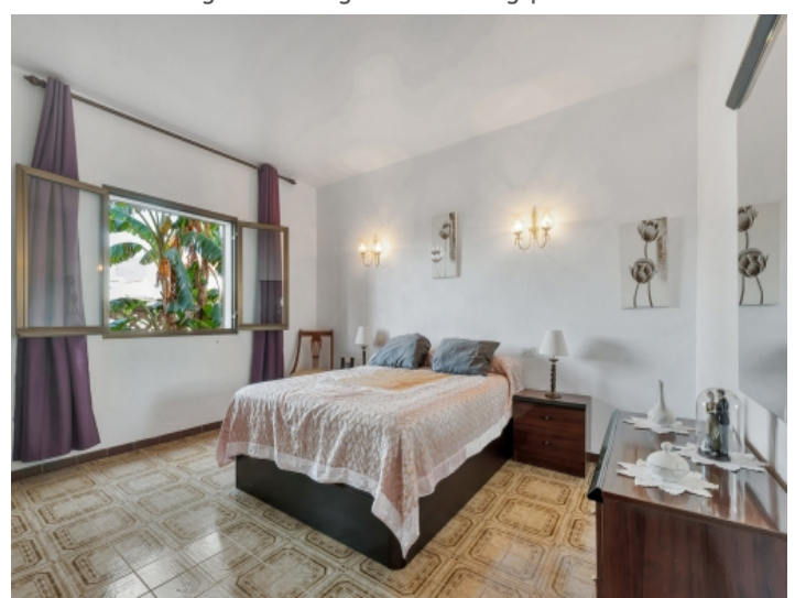
One of 5 bedrooms on the ground floor