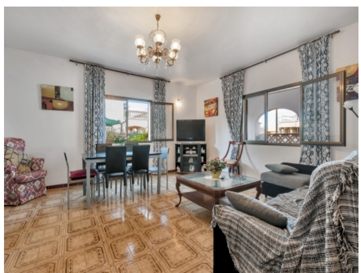
Living and dining area on the grpund floor