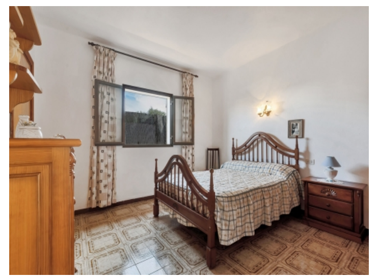
One of in total 8 bedrooms