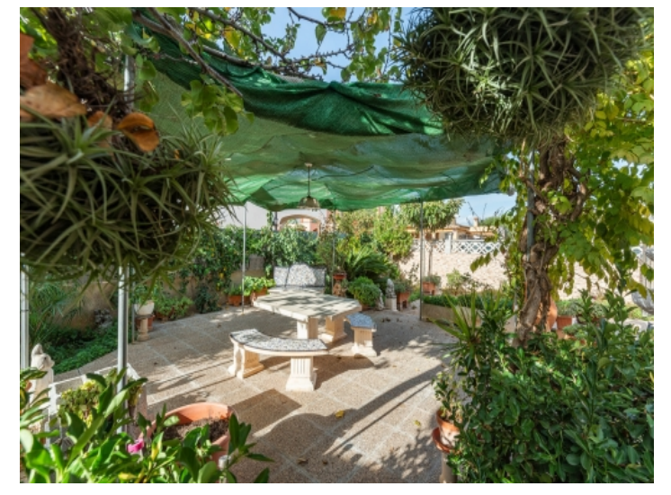
Charming outdoor area