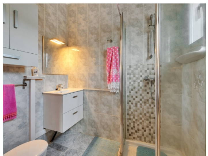
One of in total 4 bathrooms