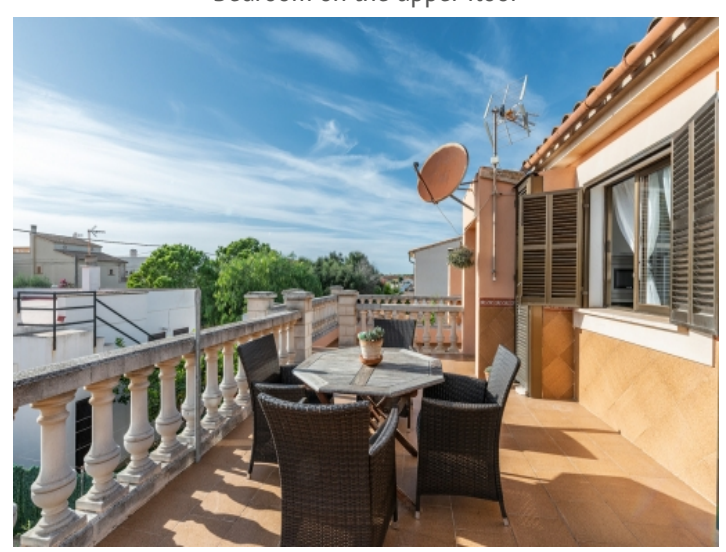
Terrace with dining area