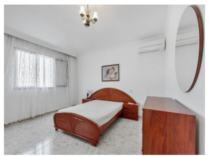
Bedroom on the upper floor