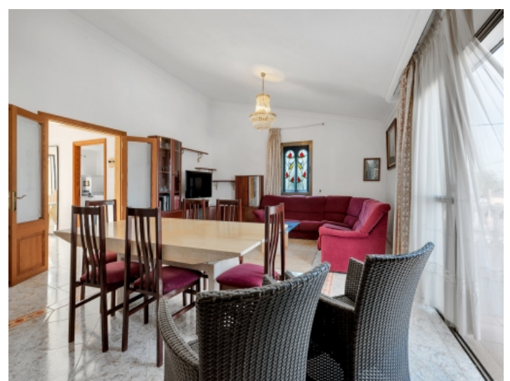
Apartment on the upper floor