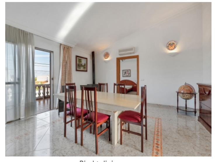
Birght dining area