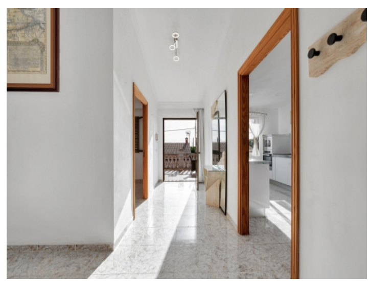
Access to the terrace