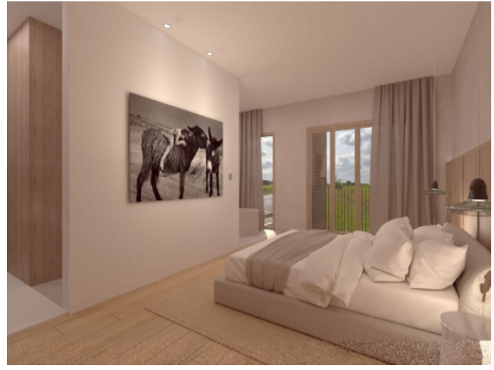
Another double bedroom