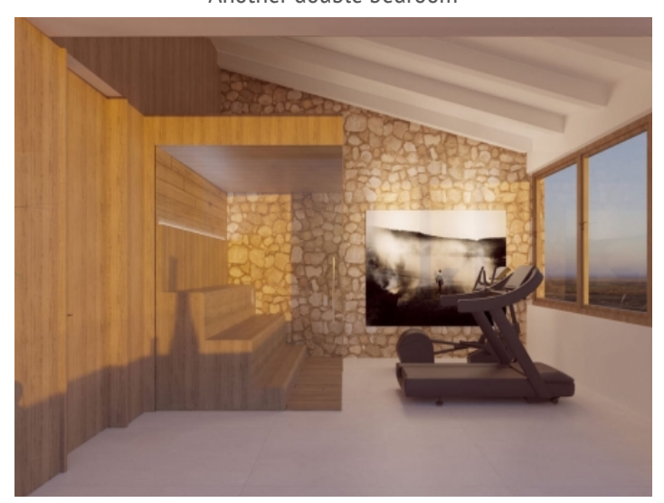
Gym and sauna