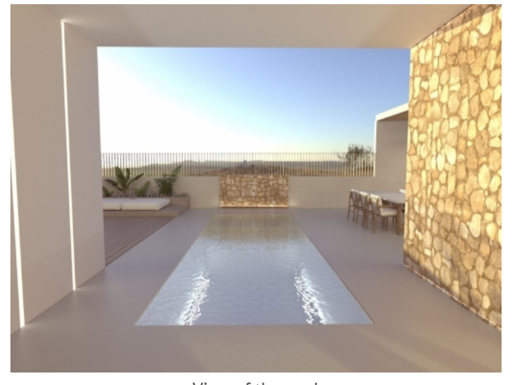
View of the pool