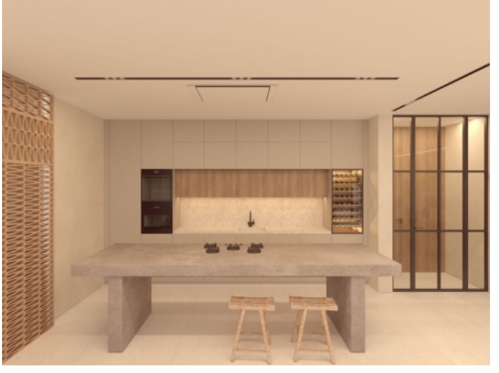
Noble fully equipped kitchen