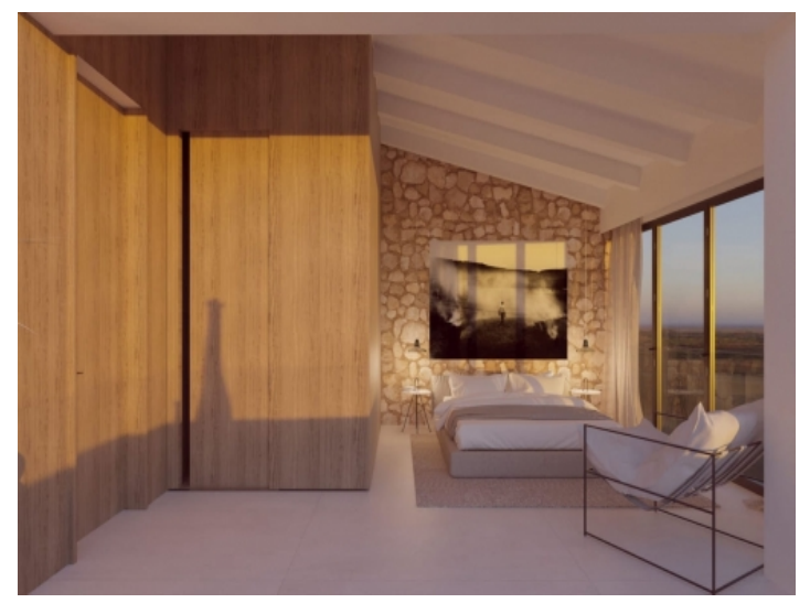
Another double bedroom