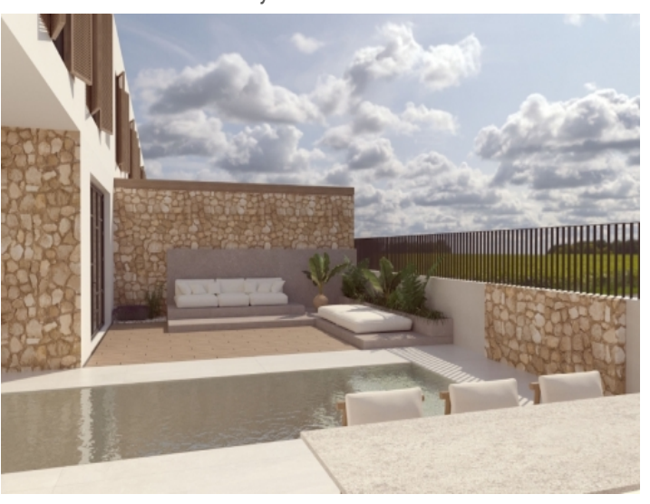
View of the pool