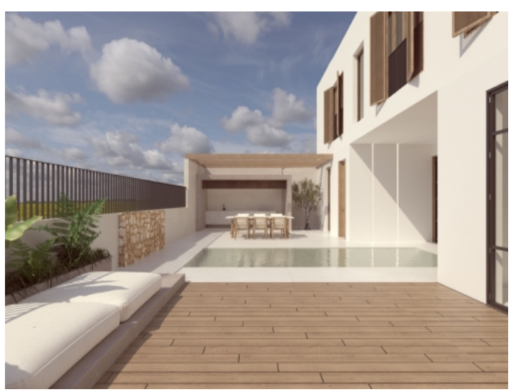
Newly built house with pool in Santanyí