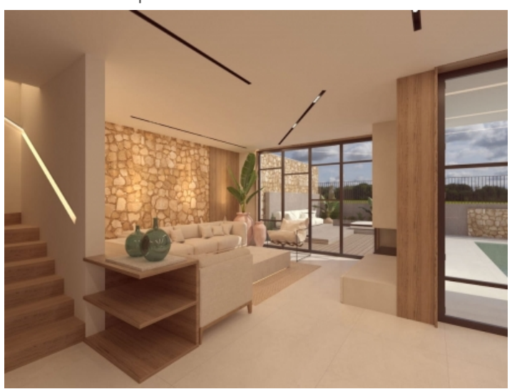
View of the living area