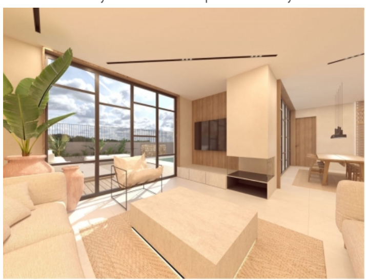
Living area with fire place