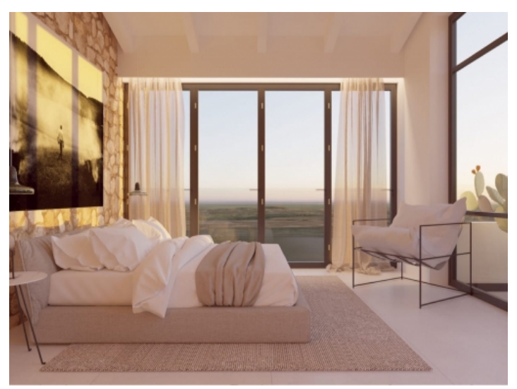
Spacious double bedroom with a view