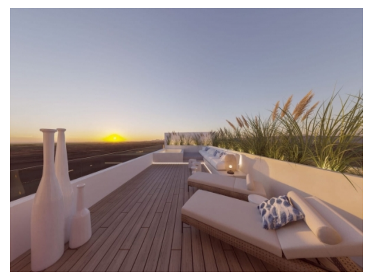
Spendid roof terrace with a view