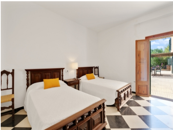
Bedroom with terrace access