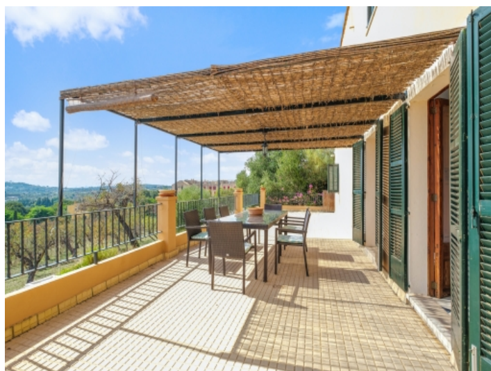
Beautiful covered terrace