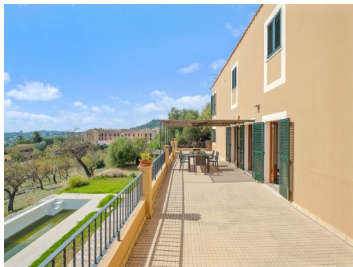
Large terrace with garden views