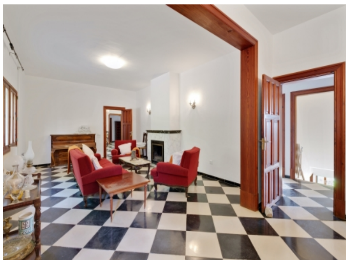
Living area on the upper floor