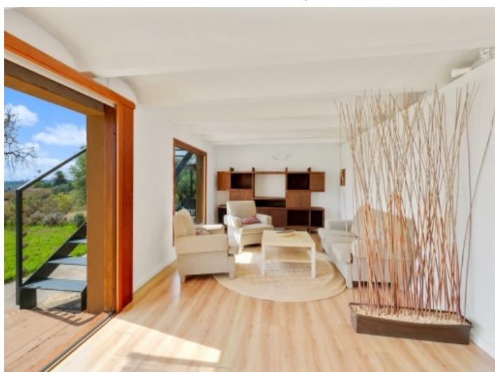
Chill out area on the lower floor