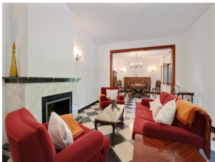
Fire place of the living area