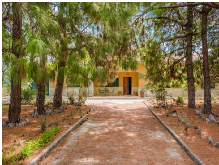
Green, idyllic surroundings