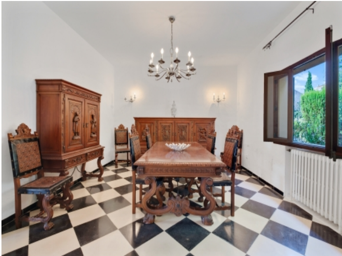
Mallorcan dining area