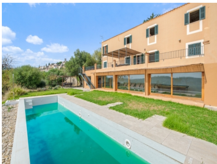
Exterior view and pool