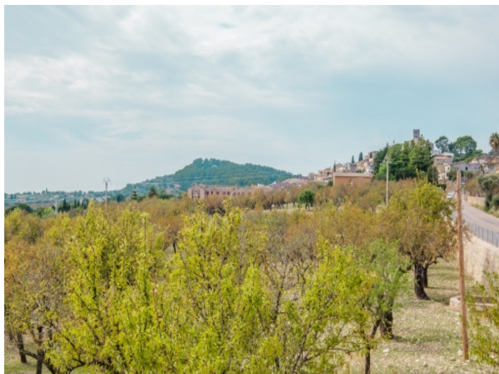
View of the surroundings