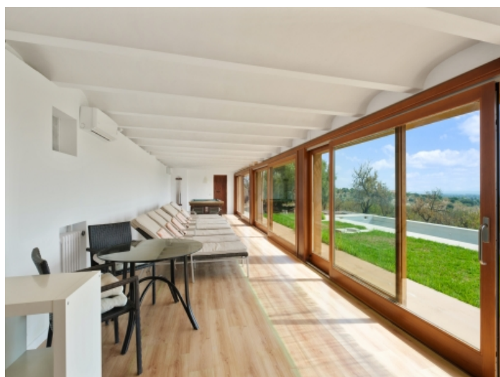
Spa area with a view