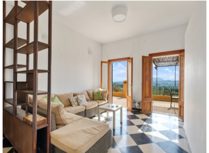
Separate living area with terrace access