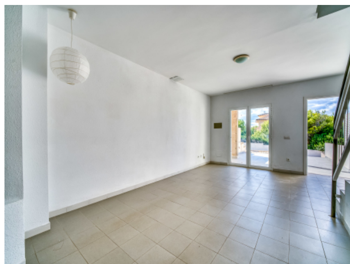
Spacious living area