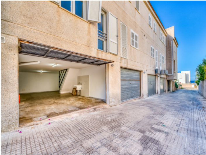
Large double garage