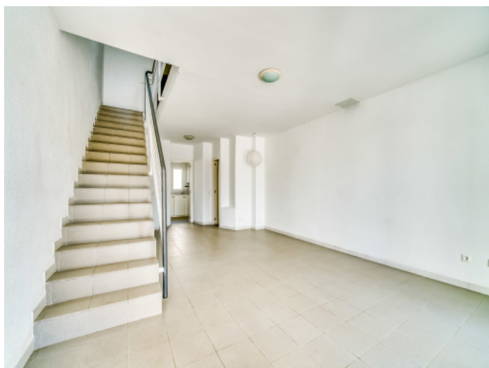
Access to the upper floor