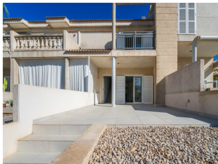
Terrace and exterior view