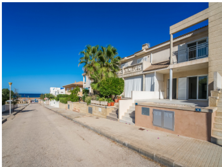
Street and exterior view