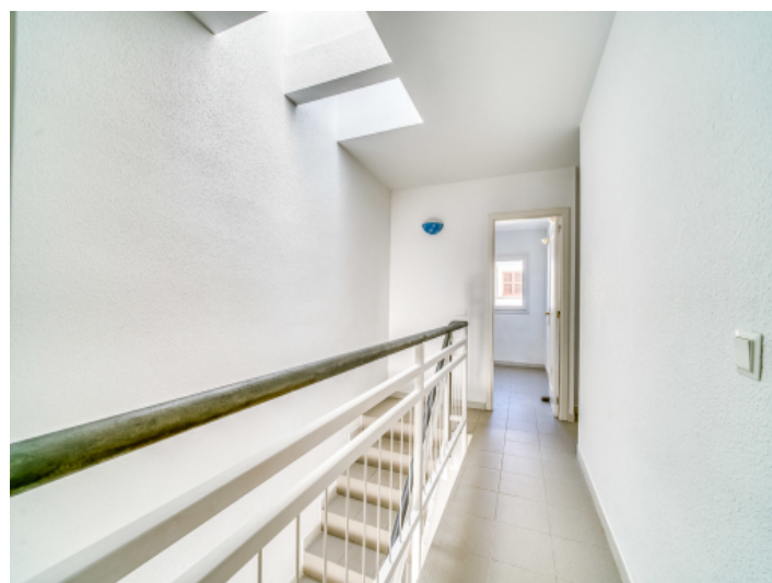
Corridor on the upper floor