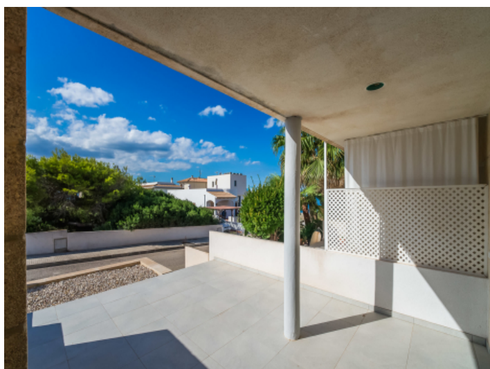
Partly covered terrace