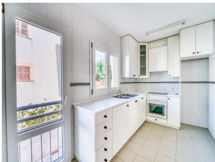
Alternative kitchen view