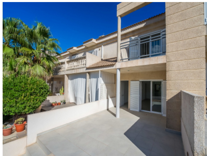
Front terrace and access to the house