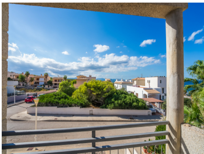
Wonderful views from the upper balcony