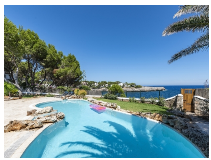
Lovely pool area with direct sea access