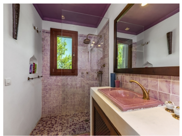
One of 7 bathrooms