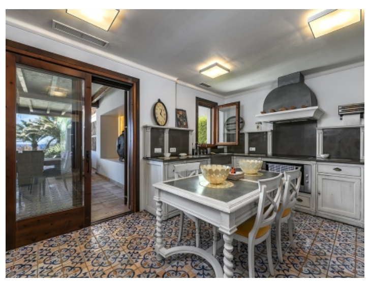
Modern kitchen with further dining area