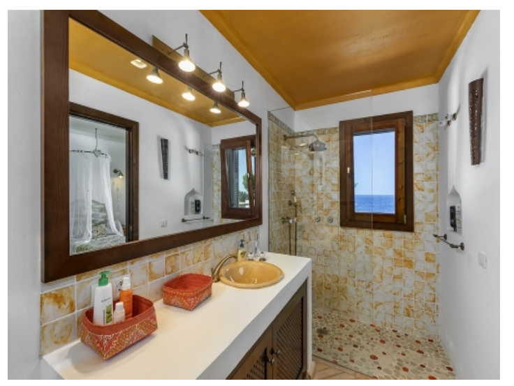
One of 7 bathrooms