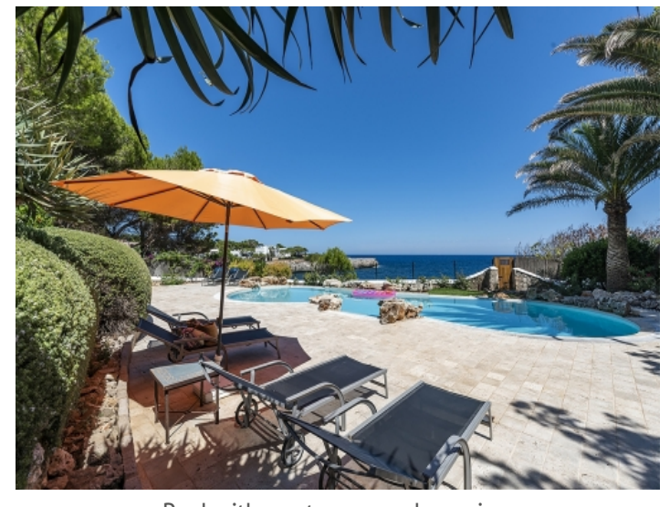
Pool with sun terrace and sea view