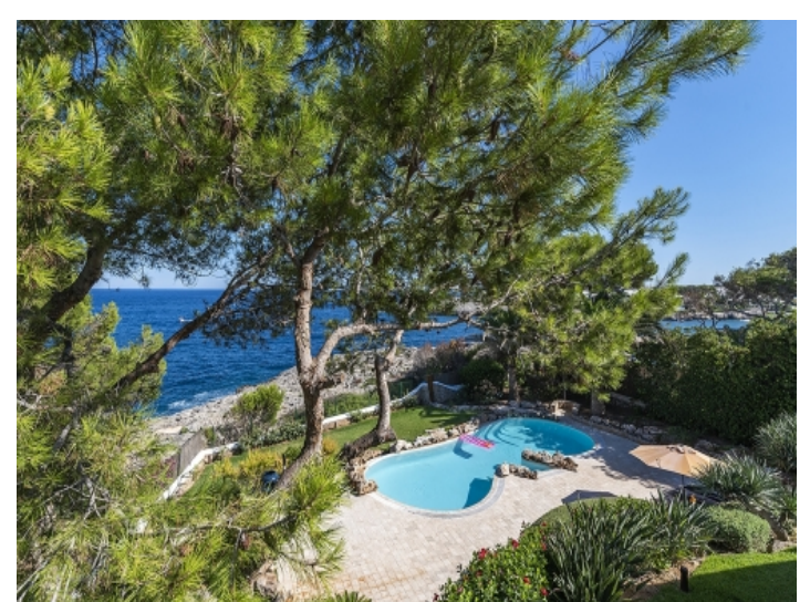
Wonderful view from the uper floor