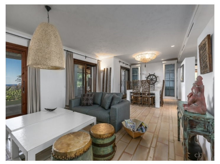
Generous living and dining area