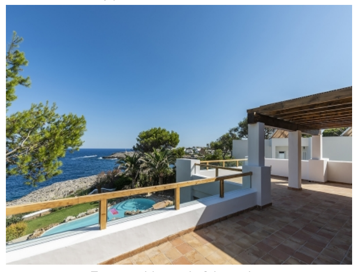
Terrace with wonderful sea view