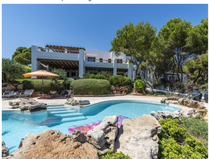
Mediterranean pool area