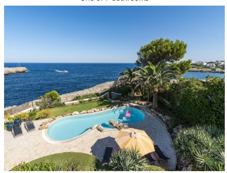
View of the pool and the sea