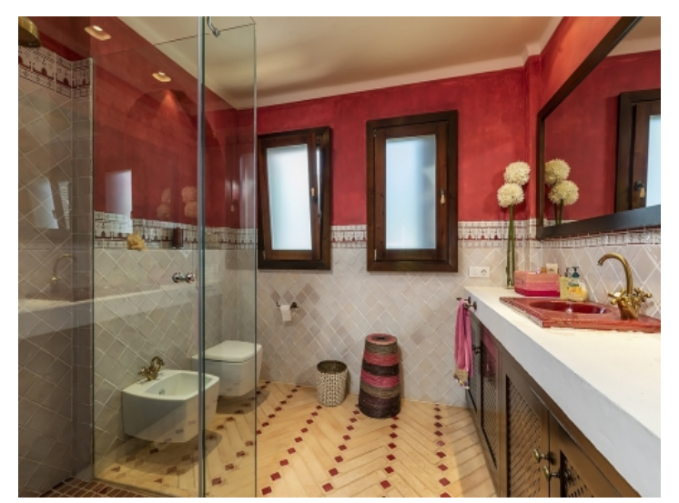
One of 7 bathrooms