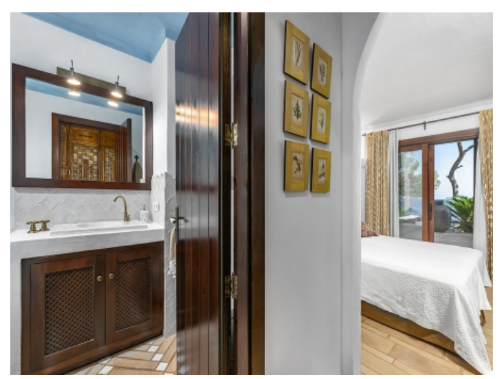
One of 7 bed- and bathrooms