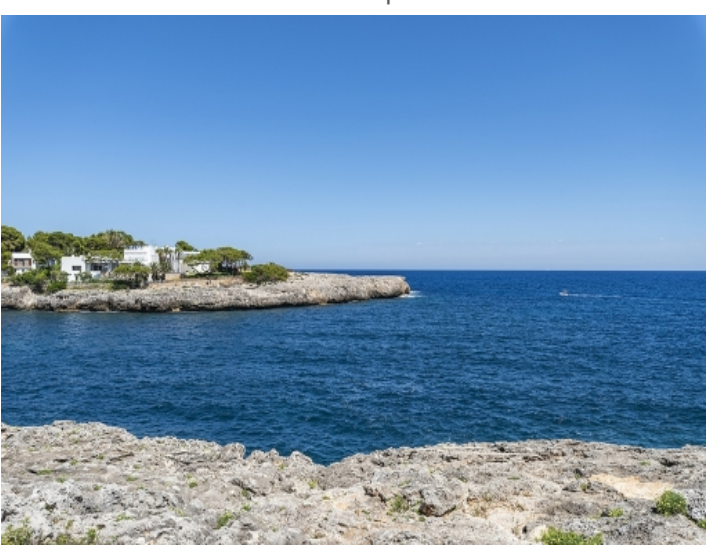
First sea line