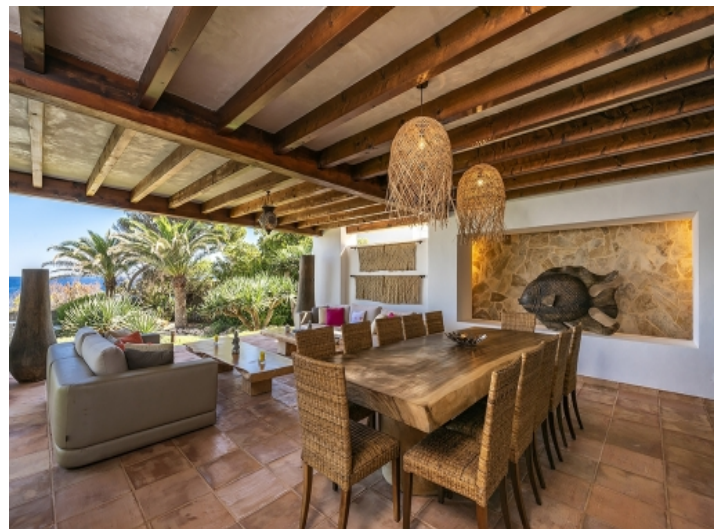
Spacious ground floor terrace