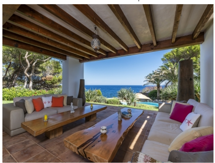
Large, covered terrace