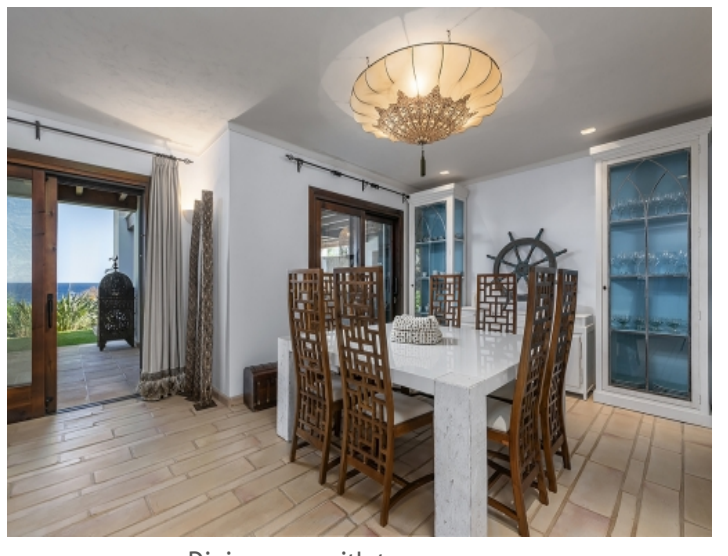
Dining area with terrace access