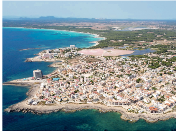
The town from a birds-eye view