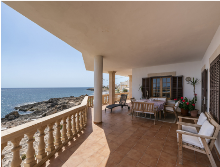
View of the lower balcony