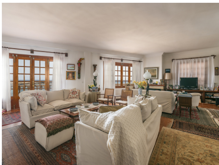
Living area of the first floor