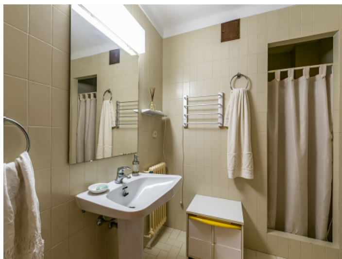
Bathroom with bath tub