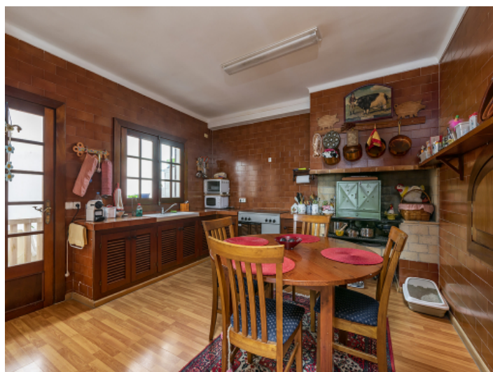
Alternative view of the kitchen