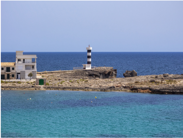
View of the surroundings