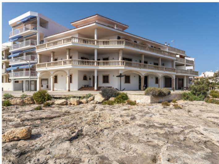
Exterior view of the house