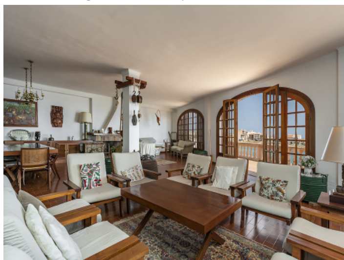
Alternative view of this floor