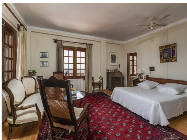
Large master bedroom