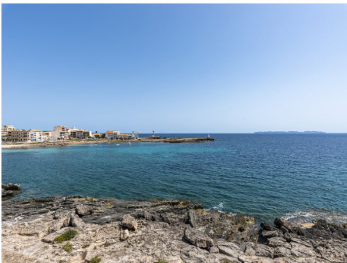
Alternative sea views