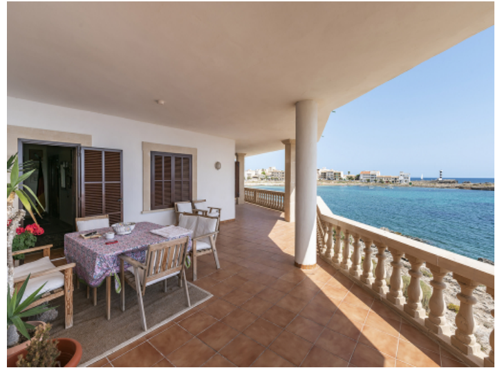
Dining area in a prime location