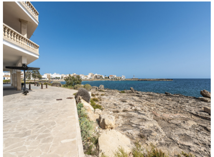
View to the sea