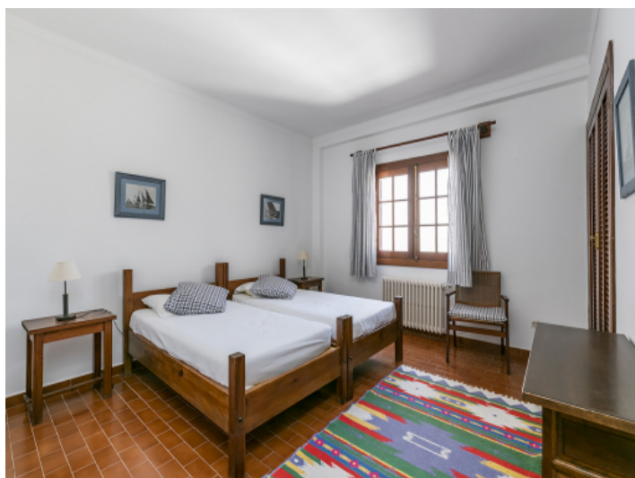
One of 9 bedrooms