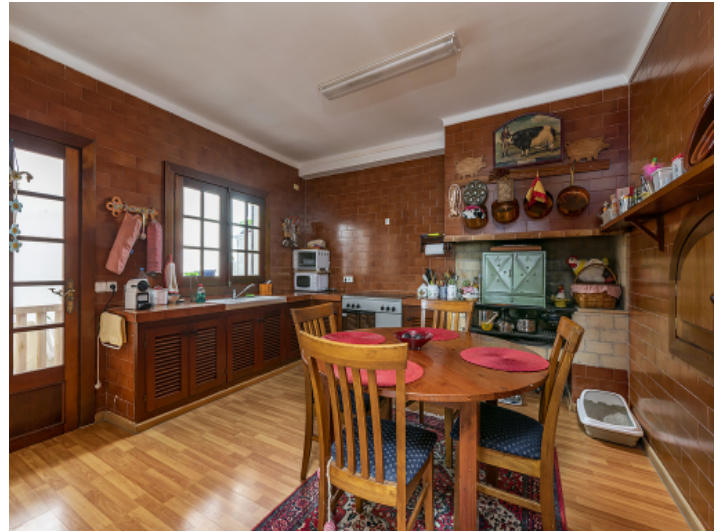
Alternative view of the kitchen