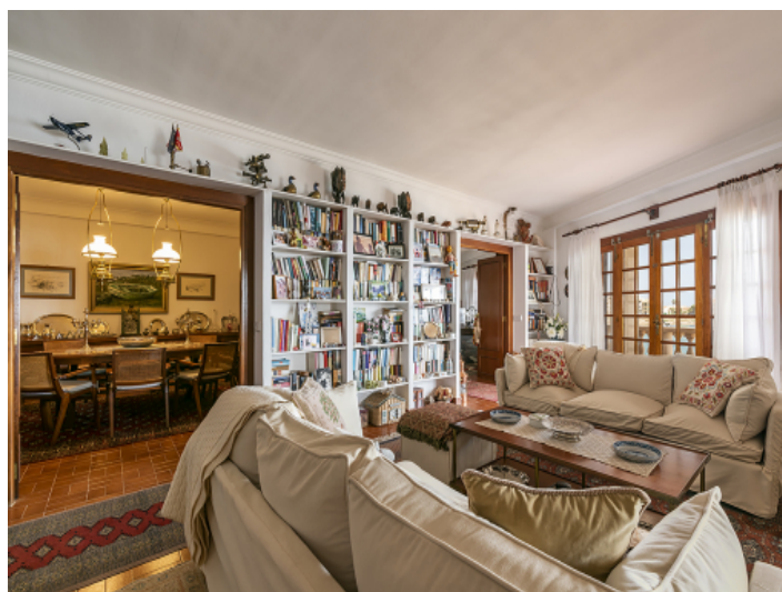
View to the dining area