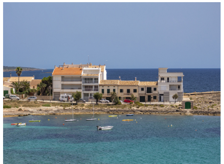
View of the surroundings