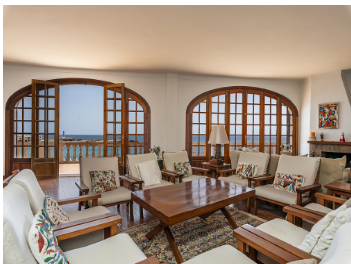
Light flooded living area on the second floor