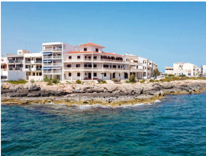
Exterior view of the house