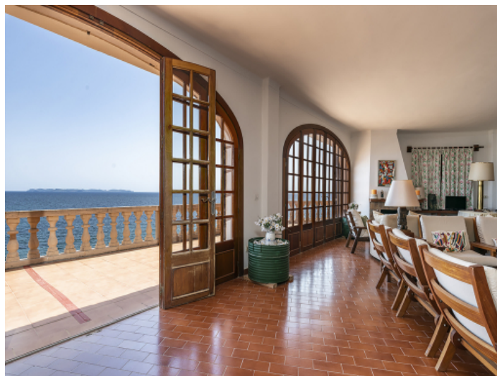
Living area and balcony of the second floor