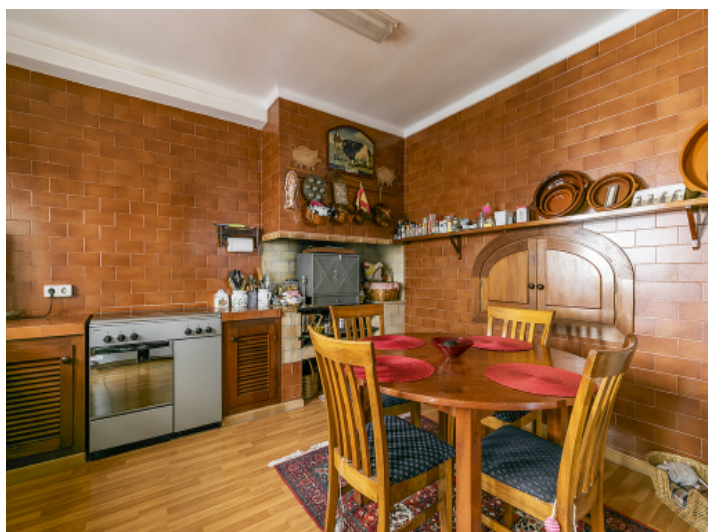
Rustic kitchen of this house