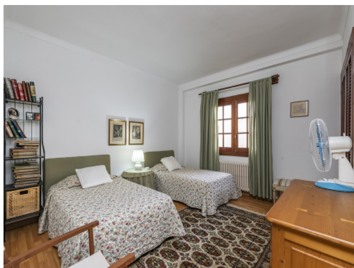
One of 9 bedrooms