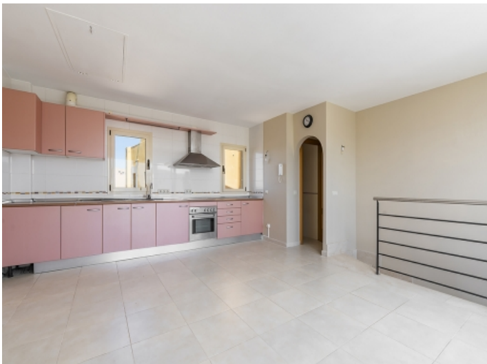
Spacious and bright level