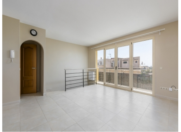
Living and dining area on the top level