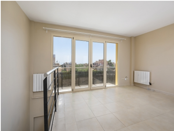
Access to the balcony