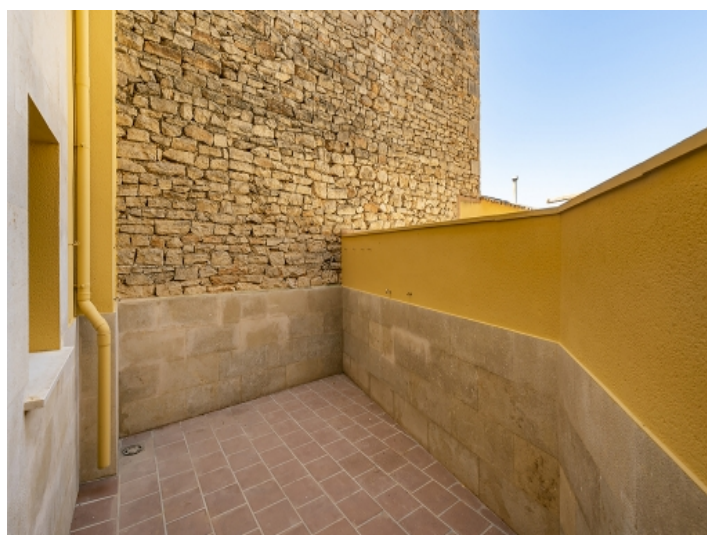
Outdoor patio on the ground floor