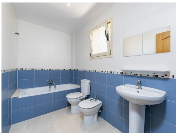
One of 2 batrooms