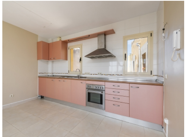
Open, fitted kitchen