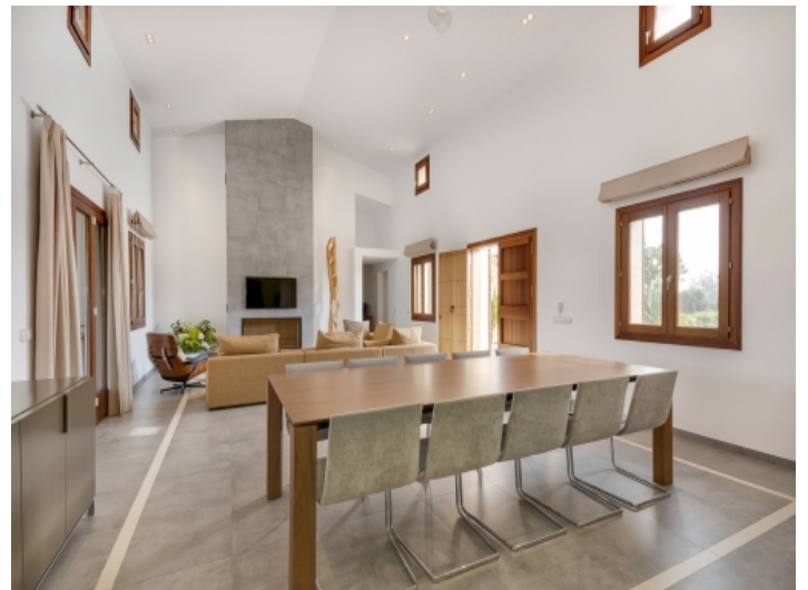
Alternative view of the modern living and dining area