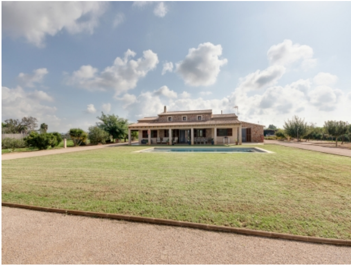
Exterior view of the finca