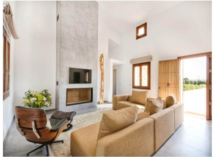
Inviting entrance and living area