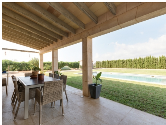
Covered terrace with pool view