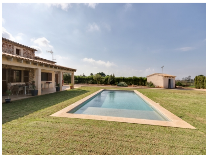
Large and private pool