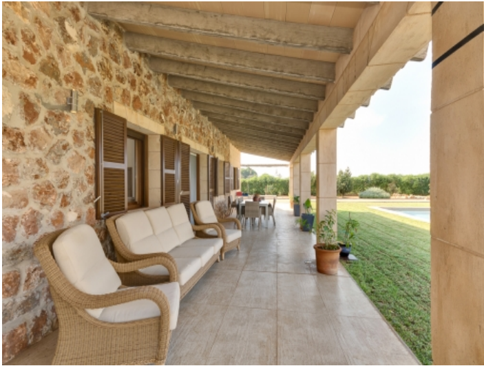
Covered terrace next to the pool