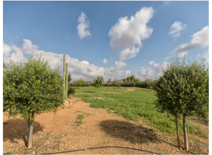
Large, green garden