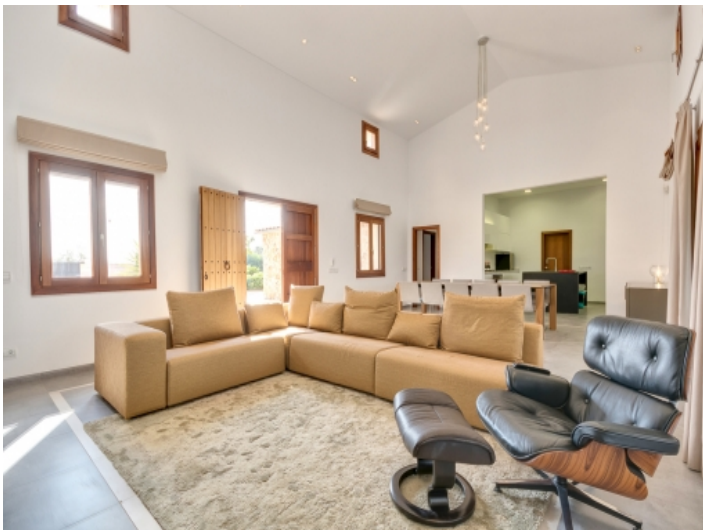
Open-plan living and dining area