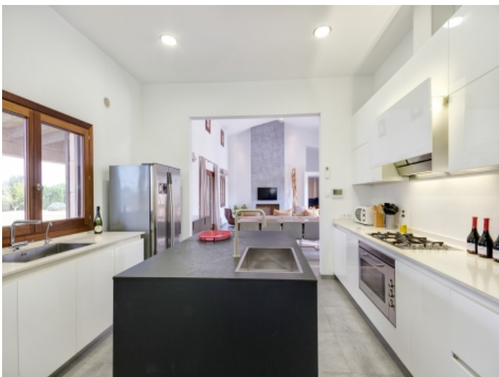
Spacious and modern kitchen