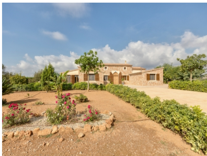
Front view of the mediterranean finca