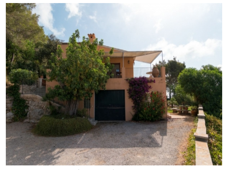
Access to the property