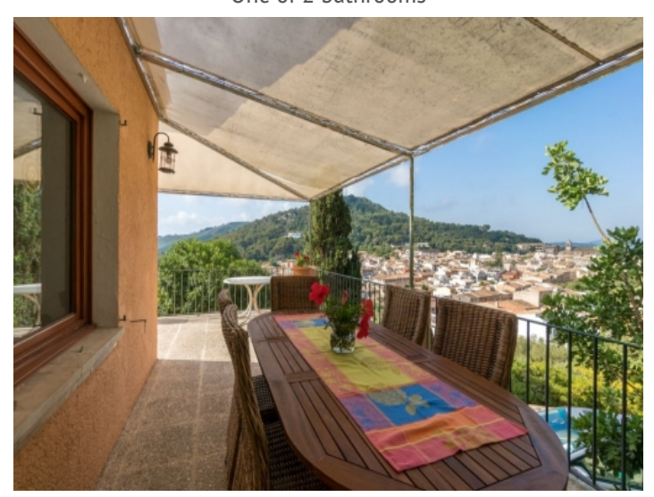
Dining area on the terrace