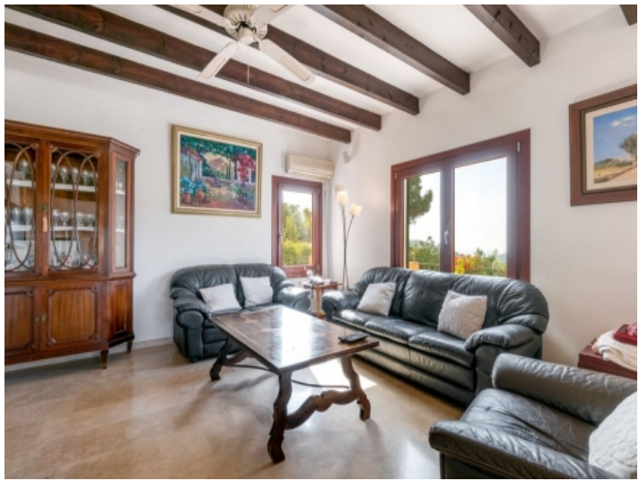
Light-flooded living area