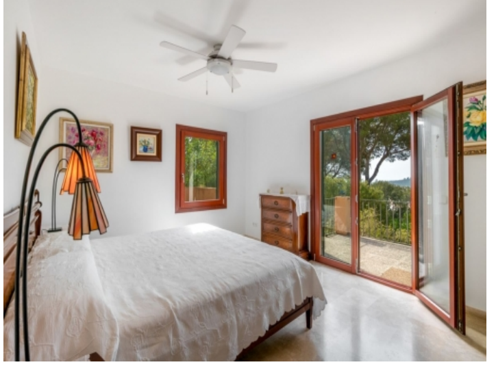
Bedroom with access to the terrace