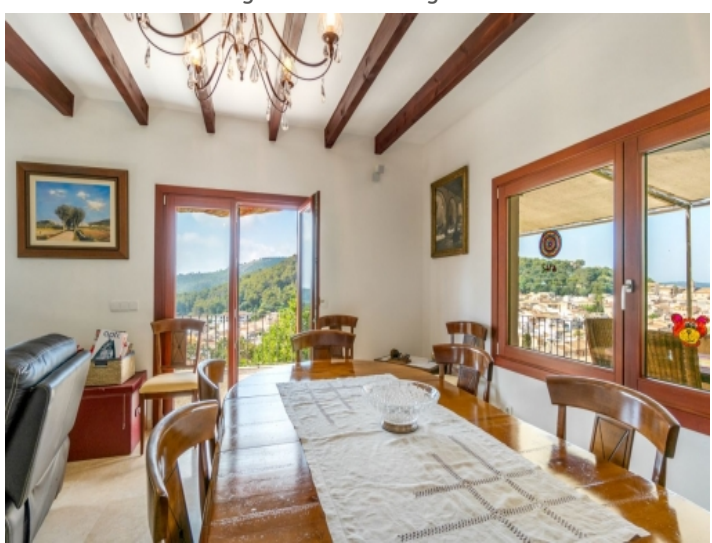
Open dining area