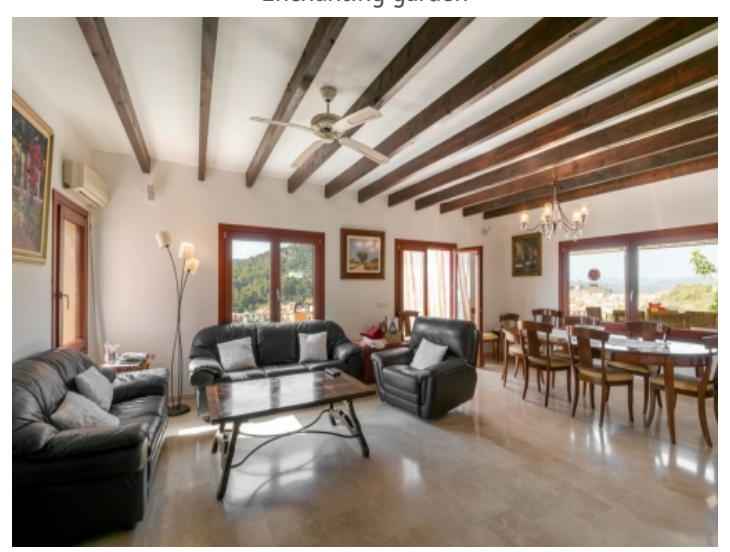
Spacious living and dining area