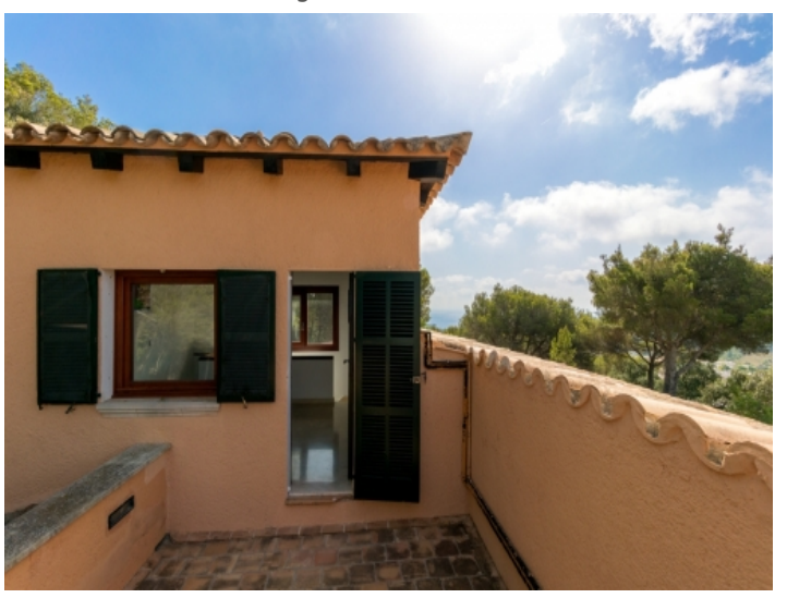
Roof terrace with sea views