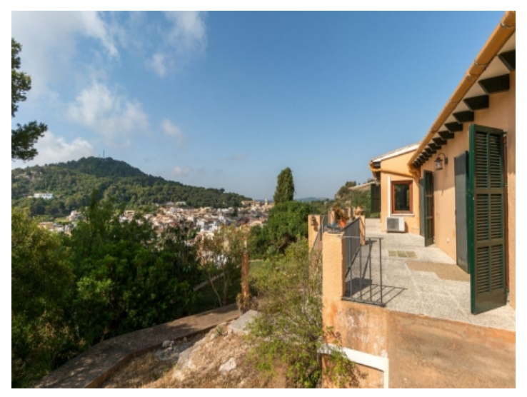
Terrace with fantastic views