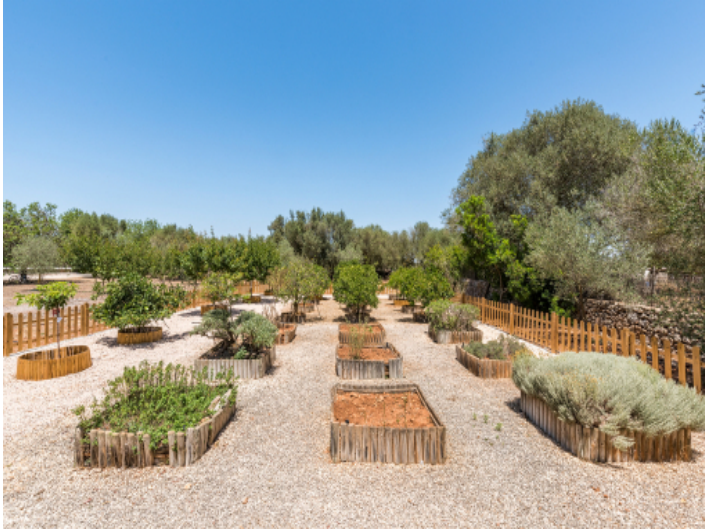
Fruit and vegetable garden