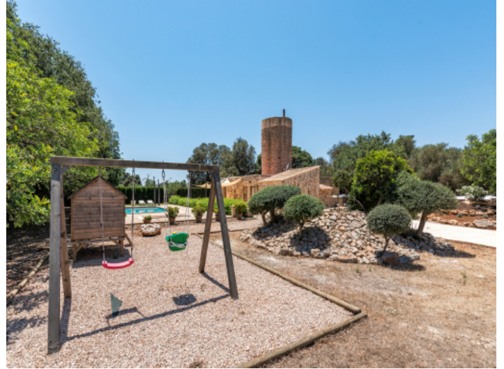
Spacious outdoor area