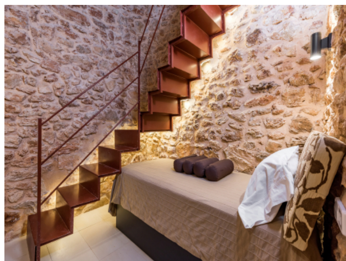
Bedroom with authentic stone wall