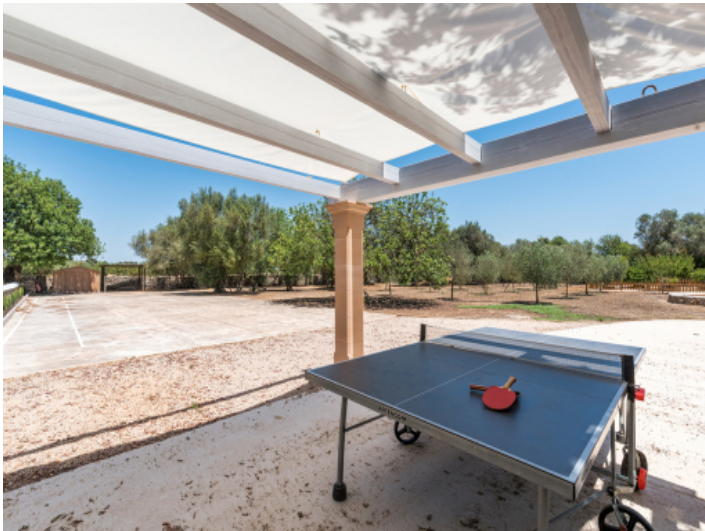
Outdoor area with many possibilities