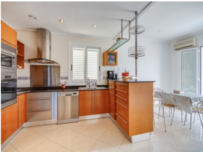
Modern and fully equipped kitchen