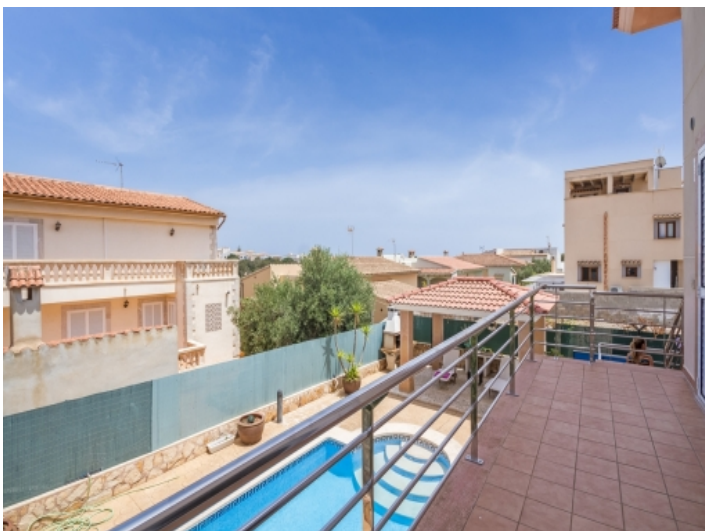
View to the pool area