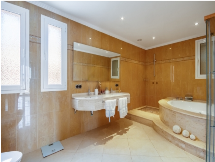
Master bathroom with bathtub