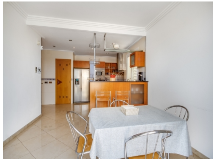
Separate kitchen and dining area