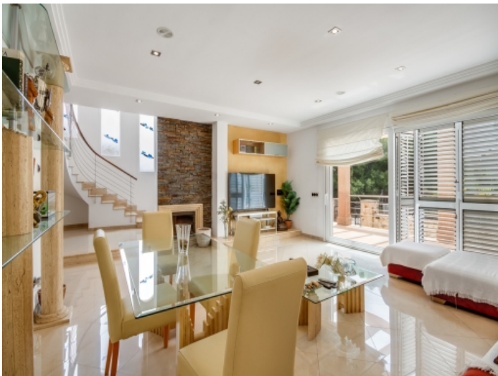
Living and dining area with terrace access