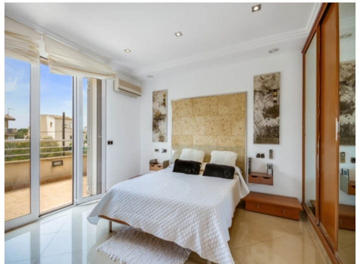
Master bedroom with balcony