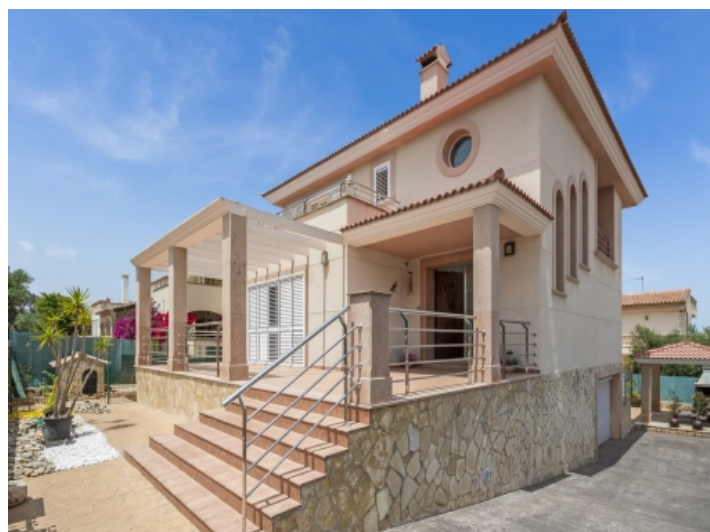
Access to the villa