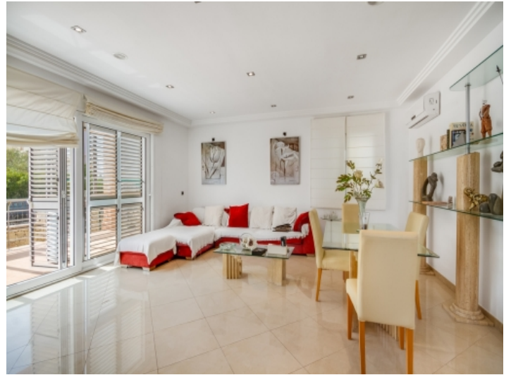
Very bright living and dining area