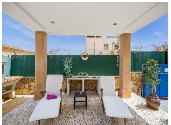
Covered pool terrace