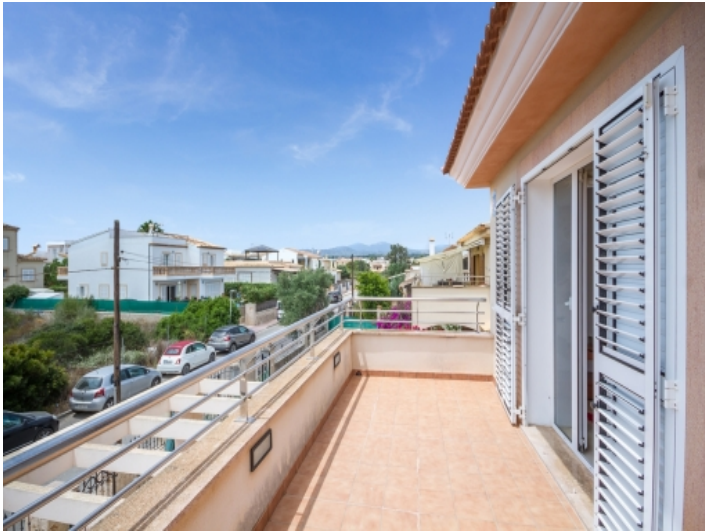
View from the upper balcony