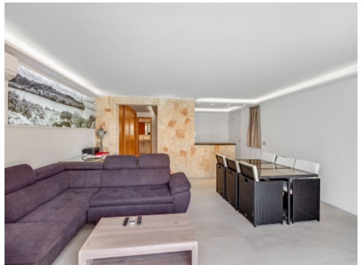
Room on the ground floor with bathroom