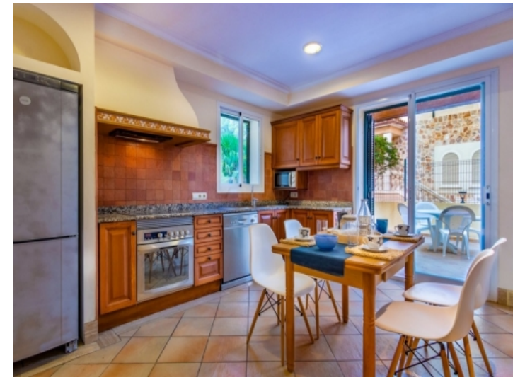
Rustic kitchen and dining area