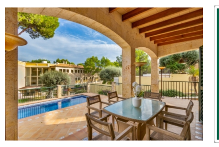
Cala Mesquida search for property MAL-113177