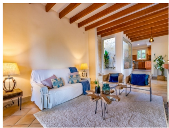
Alternative view of the living area