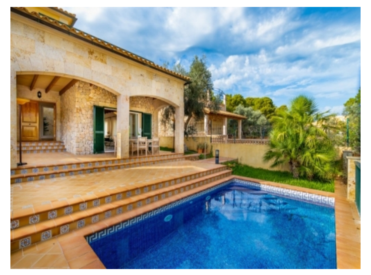
View of the pool area