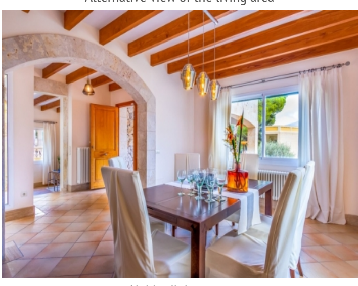
Noble dining area

PORTA MALLORQUINA • C./ COLOM 20 2°, 07001 PALMA, SPAIN TEL.: +34 971 698 242 • INFO@PORTAMALLORQUINA.COM • WWW.PORTAMALLORQUINA.COM