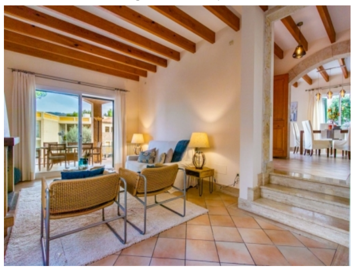
View to the kitchen