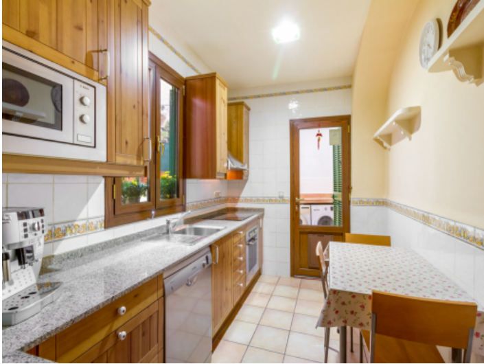
Kitchen with access to the inner courtyard