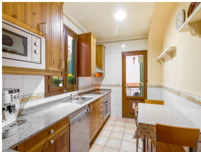
Kitchen with access to the inner courtyard