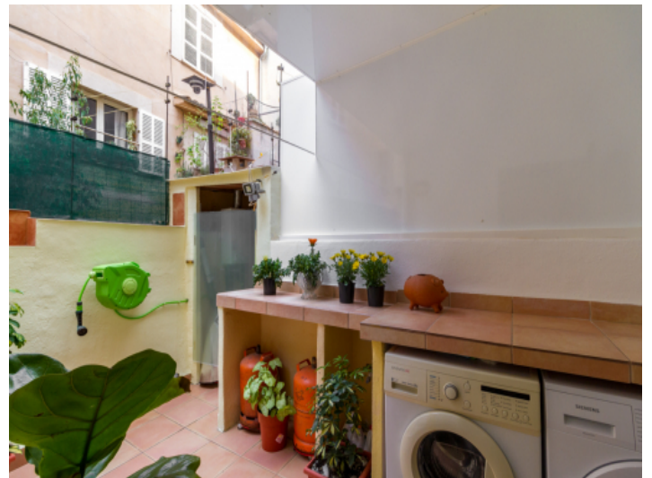
Inner courtyard on the ground floor