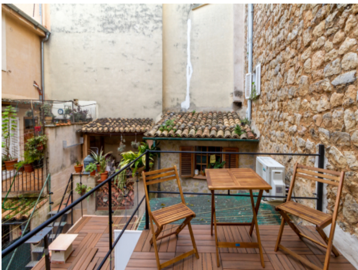
Charming terrace on the first floor