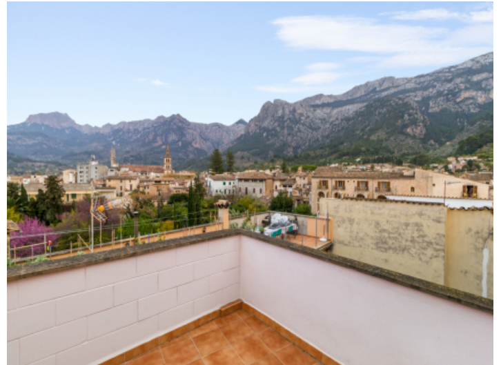
Town house with large roof terrace and mountain views in