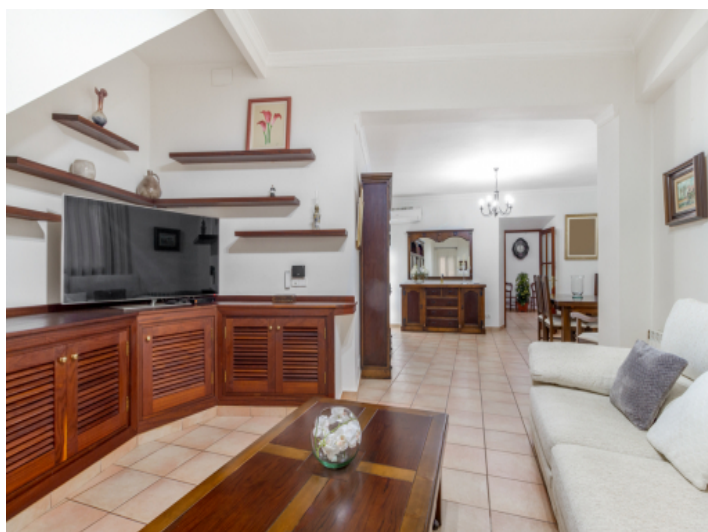
Views to the dining area