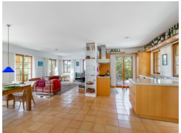
Living area and open kitchen