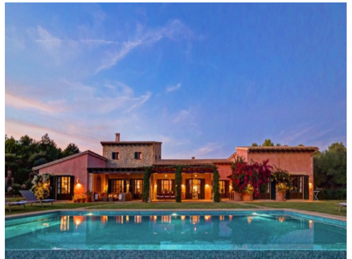
Exterior view of the exclusive finca