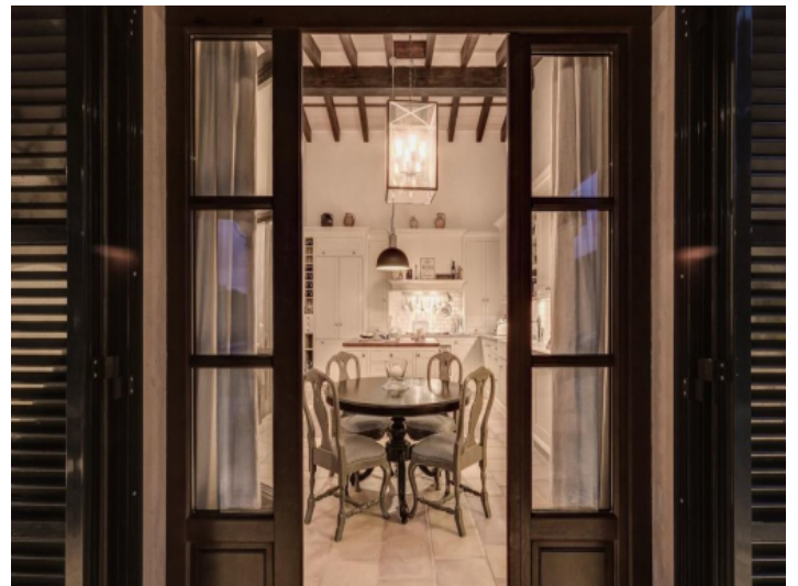
Dining area with open kitchen