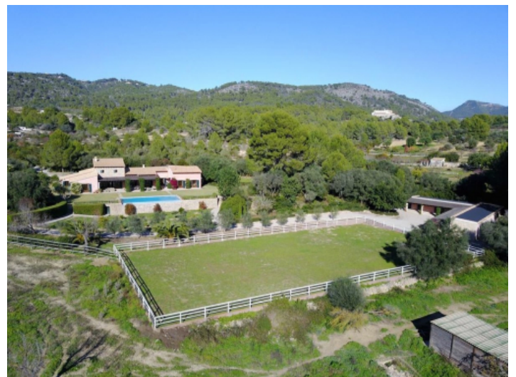
Extensive property with horse paddock