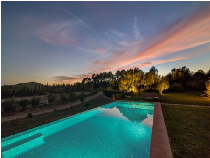
Impressive views from the pool