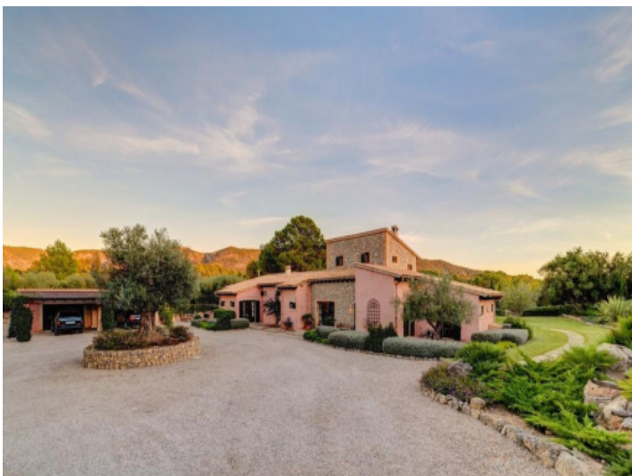
Access to the property