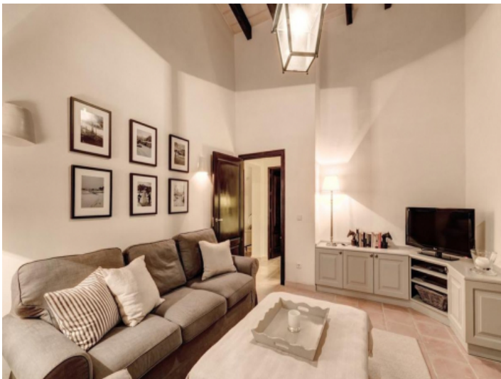
Friendly living area