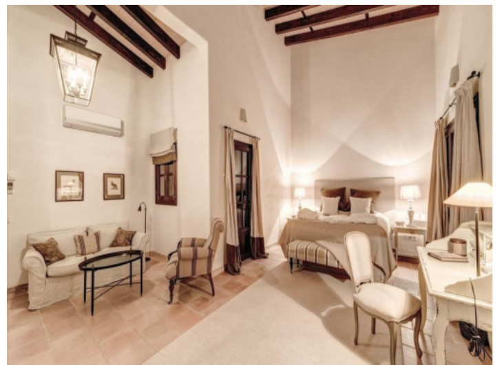
Grand master bedroom with seating corner