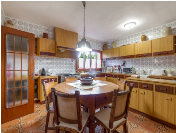
Further dining area in the kitchen