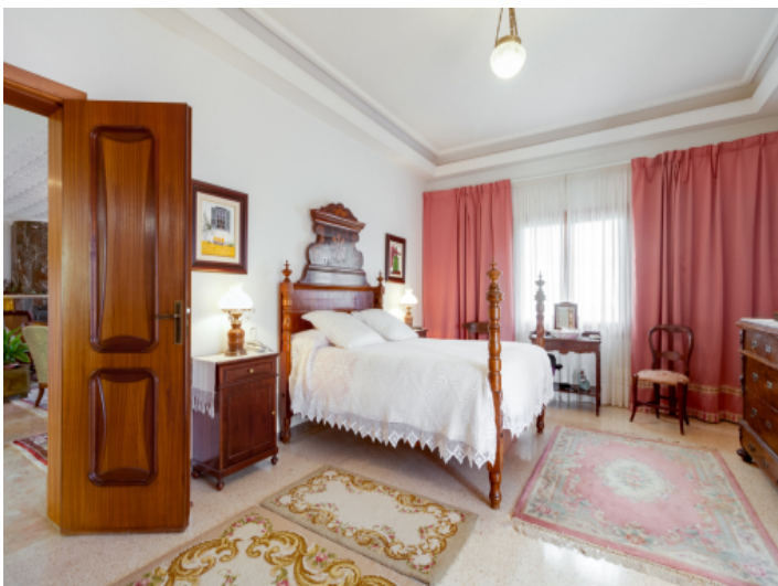
One of 6 bedrooms