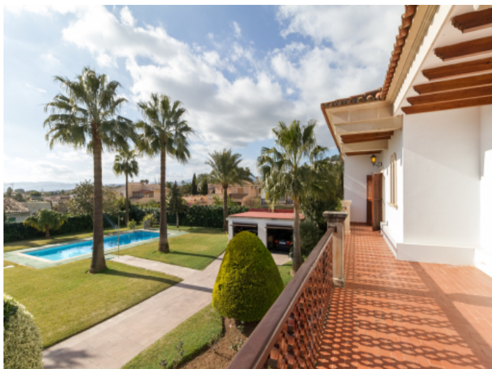
Spacious pool area