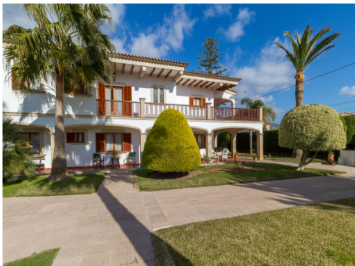
Exterior view and garden