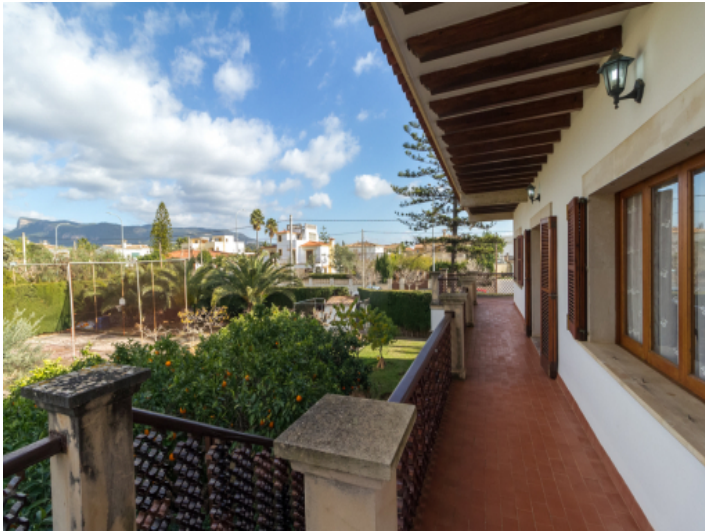
Garden area with fruit trees