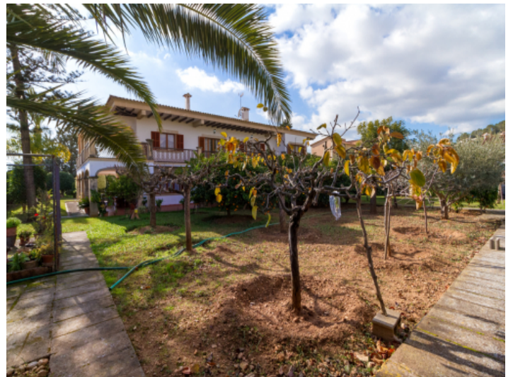
Garden with fruit trees