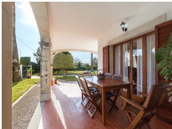
Wonderful dining area on the terrace