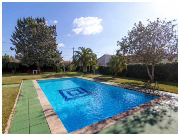
Large pool area