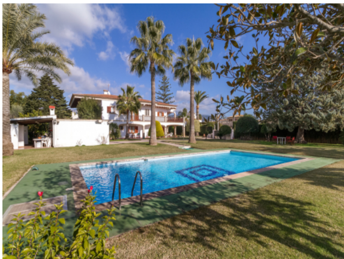
Exterior view and pool area