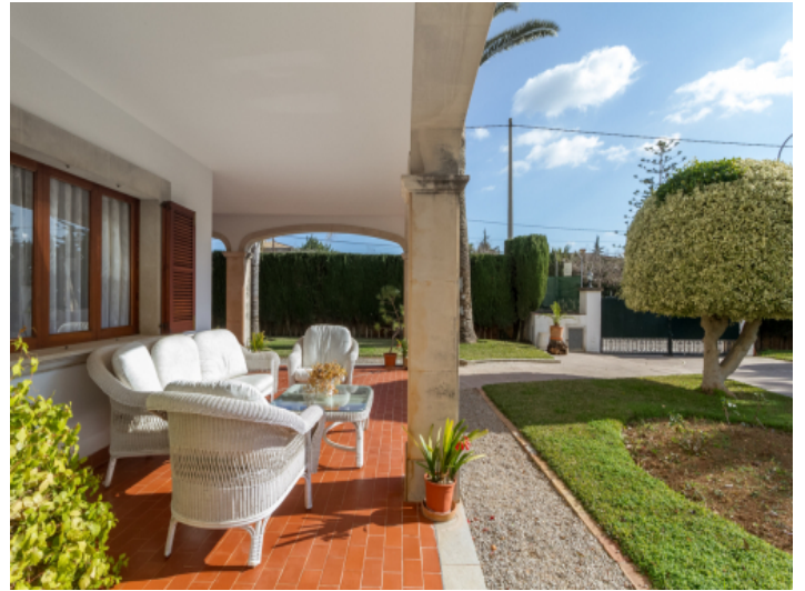
Further covered terrace