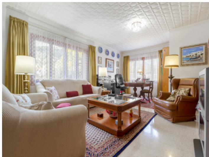
Appealing living and working area