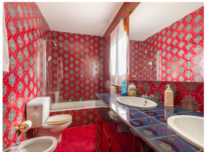
One of 5 bathrooms