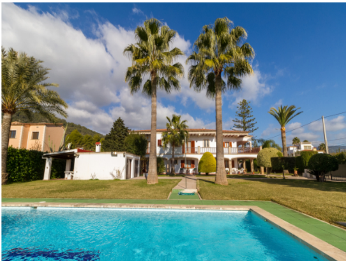
Sunny pool area with palm trees