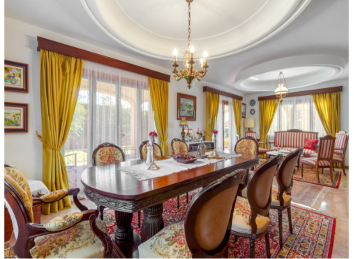
Bright and spacious dining area