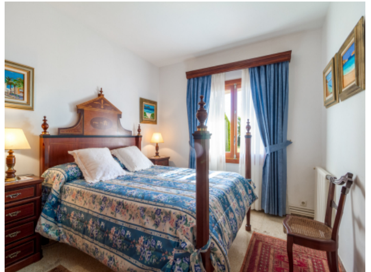
One of 6 bedrooms