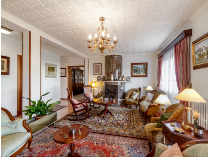
Unique living area with fireplace