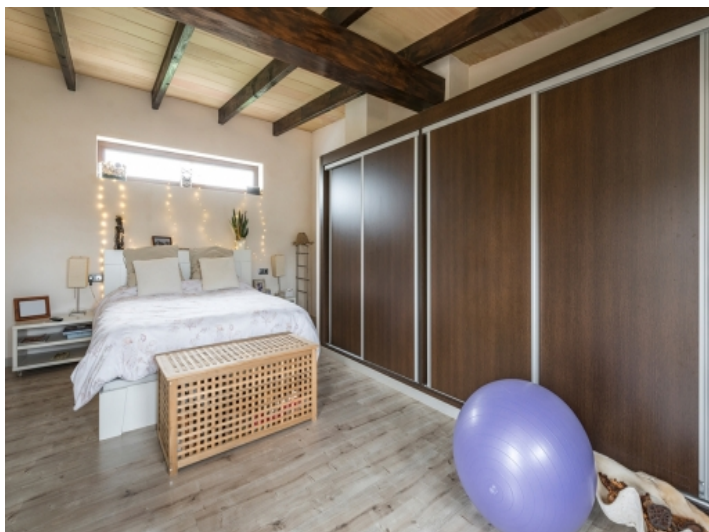
Alternative view of the bedroom