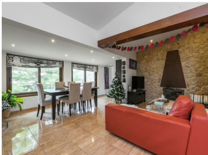
Open plan living and dining area