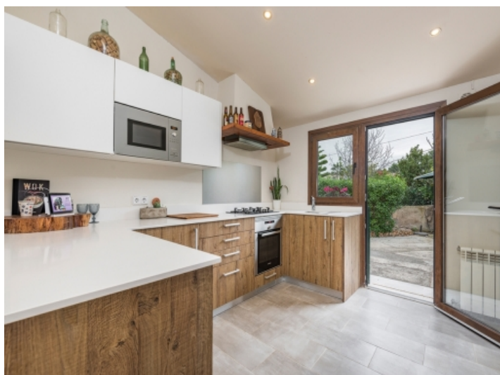
Modern kitchen with access to the outside