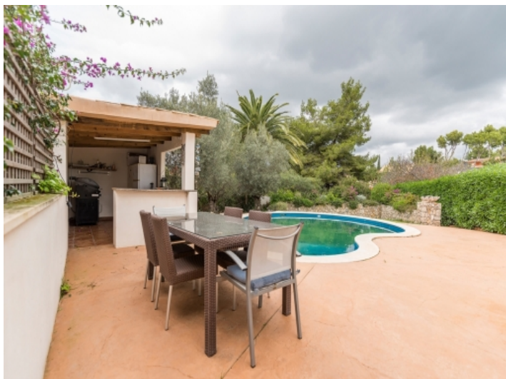
Barbecue area with bar