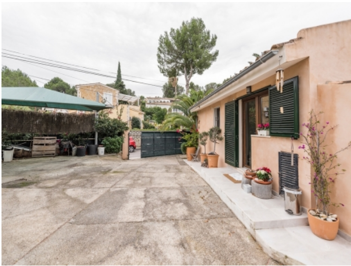
Side view of the house with terrace