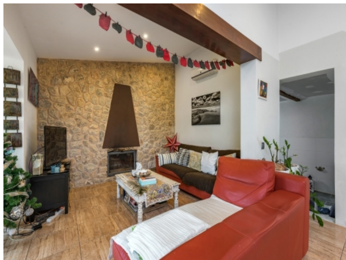
Living area with fireplace