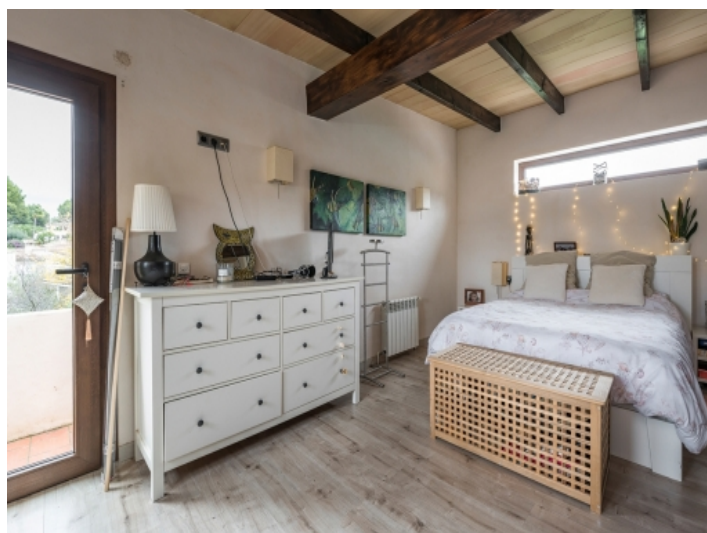
Master bedroom with terrace