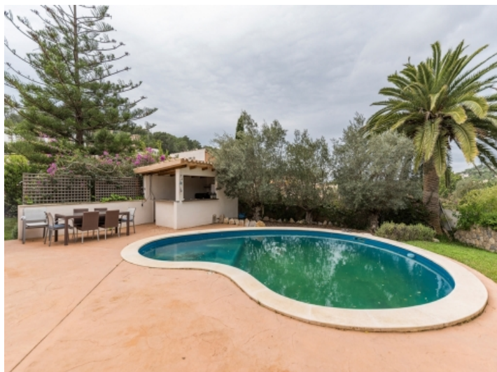
Spacious pool and barbecue area