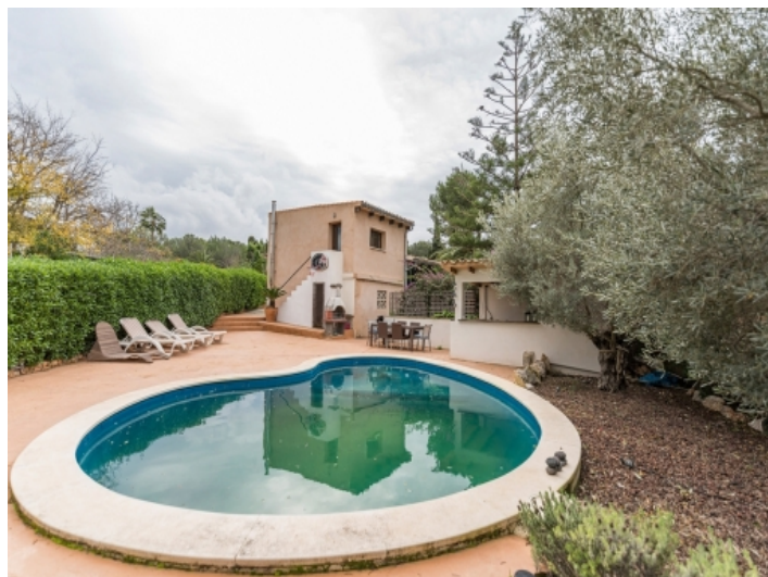
View of the private pool area