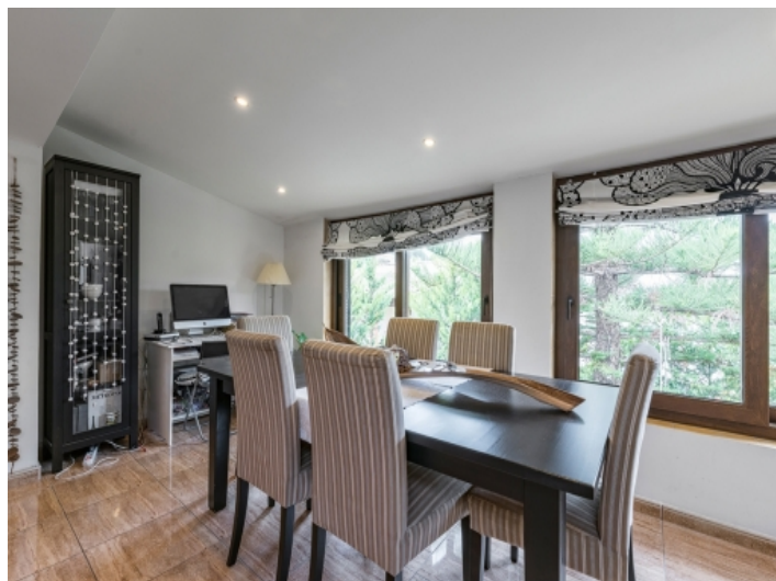
Bright dining area