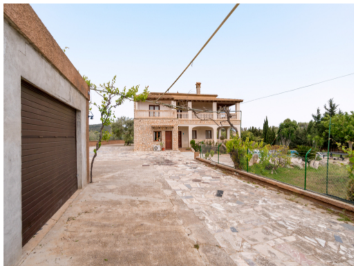
Access to the finca