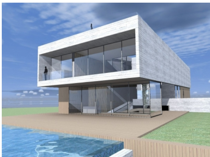
New built villa with sea view in Cala Pi