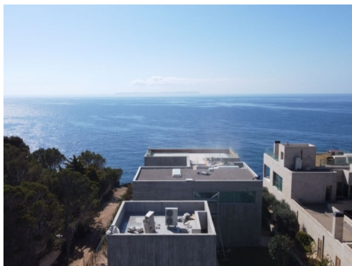
View to the sea