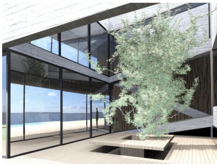
Modern and elegant design