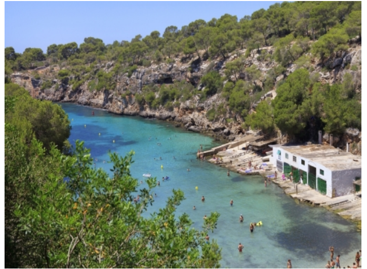
The beautiful bay of Cala Pi is very close