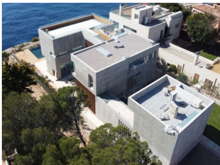
The villa from a birds-eye view