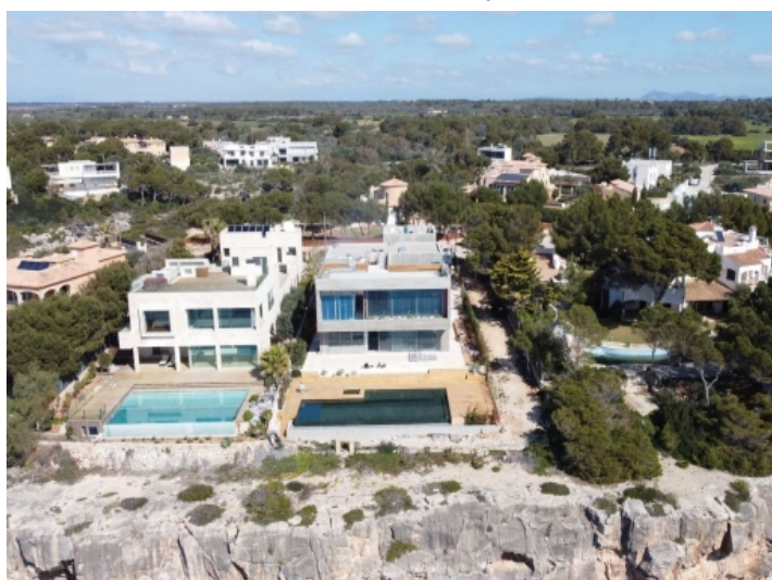
The villa from a birds-eye view