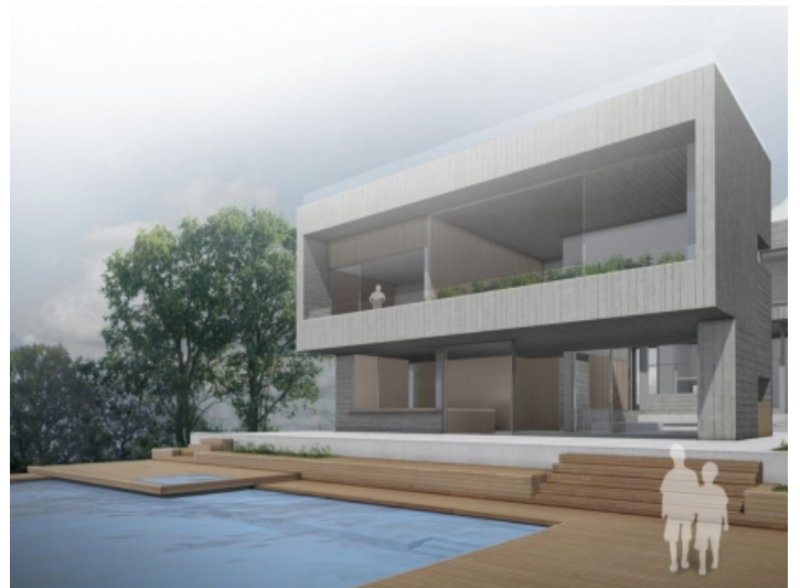
Alternative view of the villa