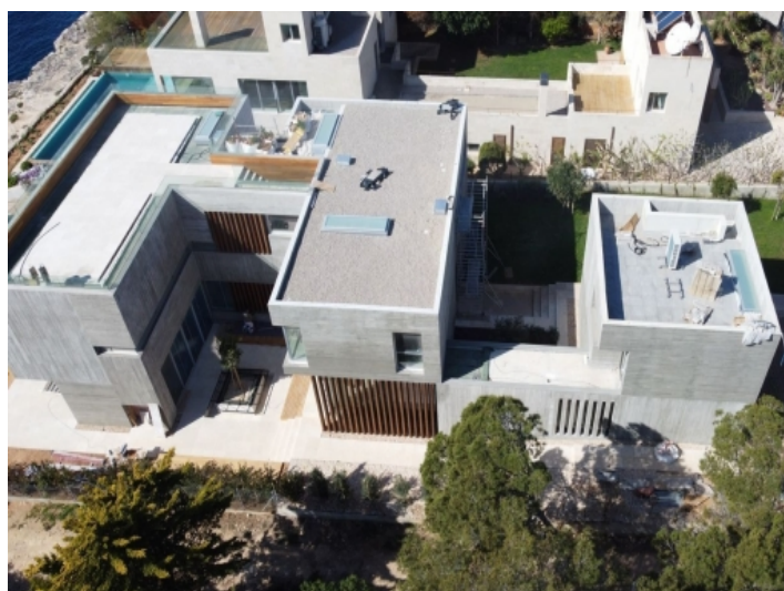
The villa from a birds-eye view