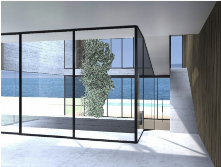
The villa offers spectacular sea views