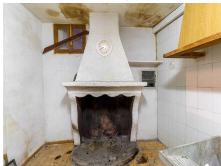
Fireplace in the kitchen