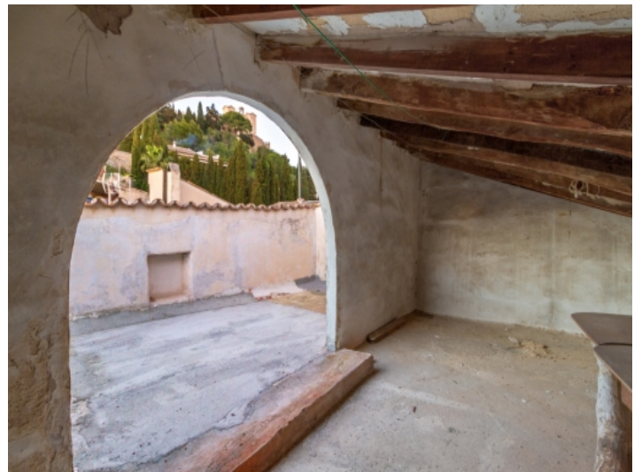
Additional room on the roof terrace