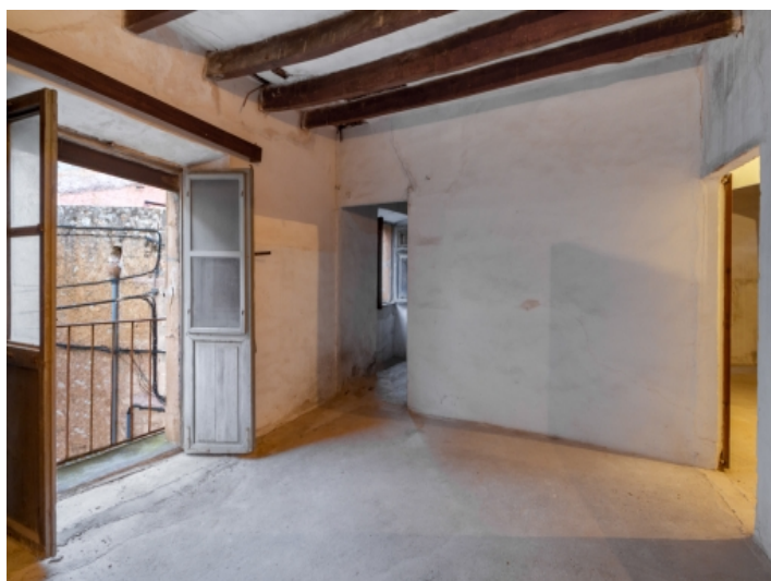
Bedroom with french balcony