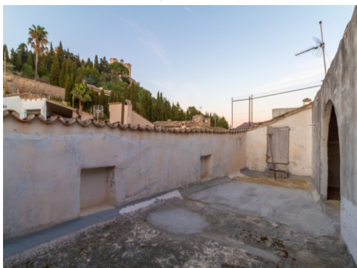
Large roof terrace