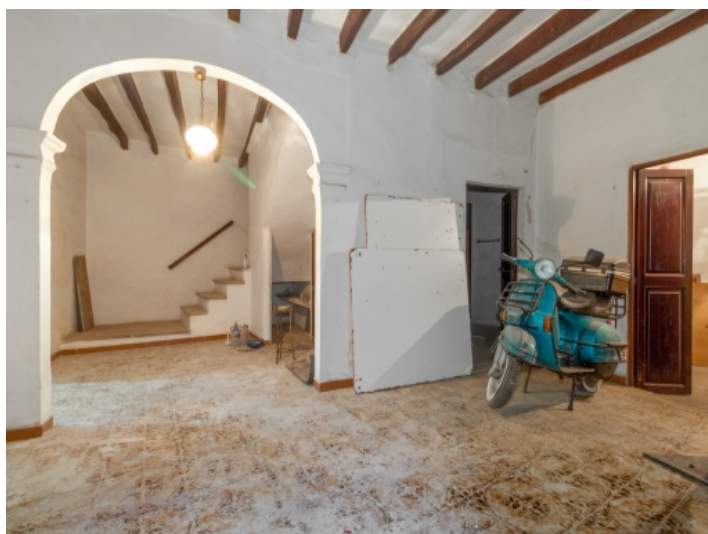
Unfurnished living area