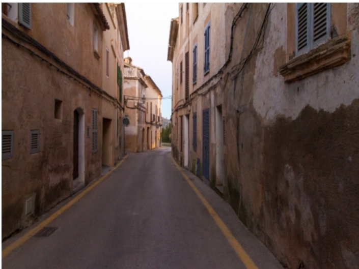
Surroundings in the old town