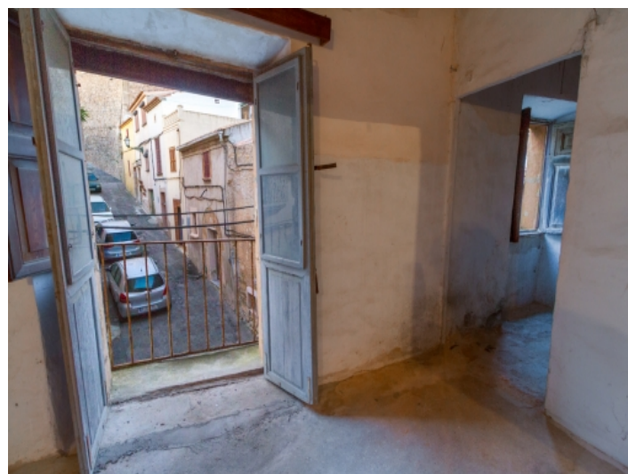
View of the street