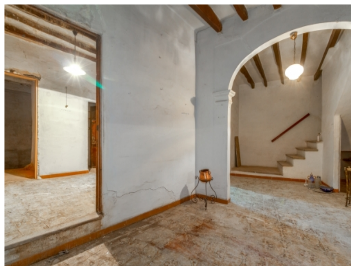
Spacious living area