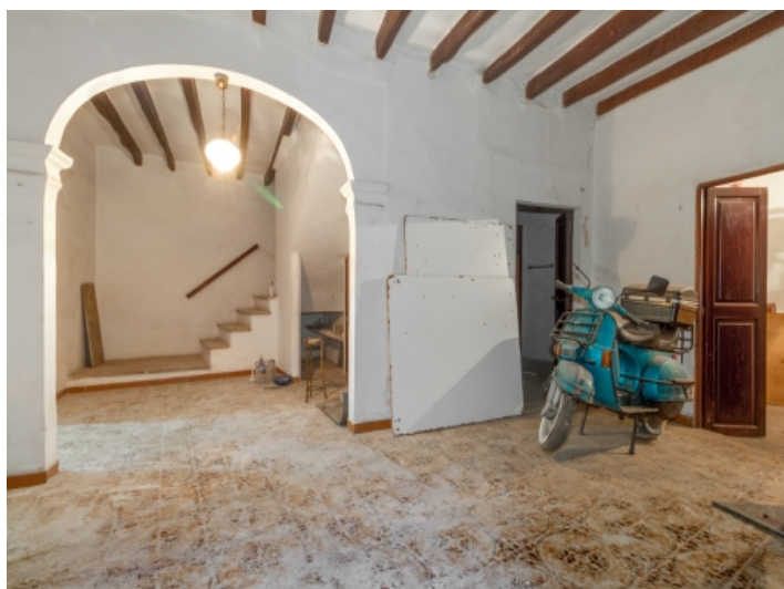
Unfurnished living area