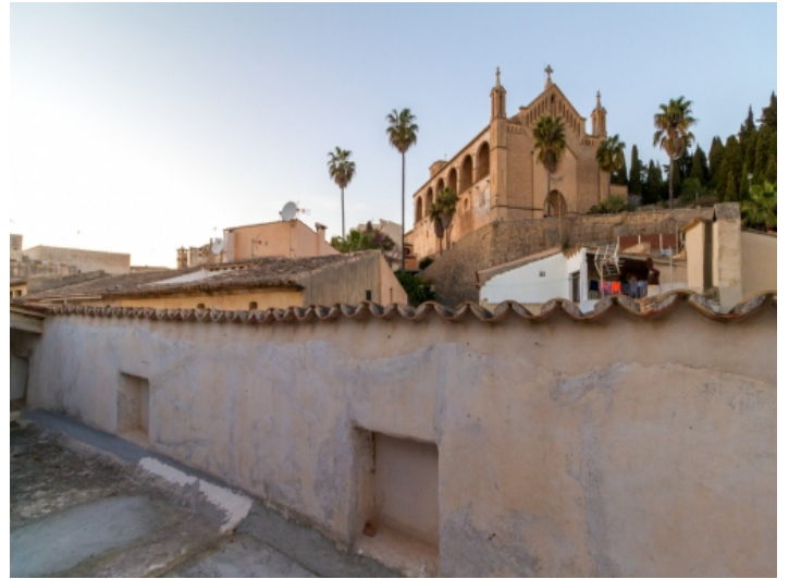
Impressive views of the church