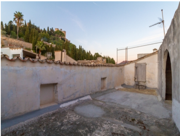
Large roof terrace