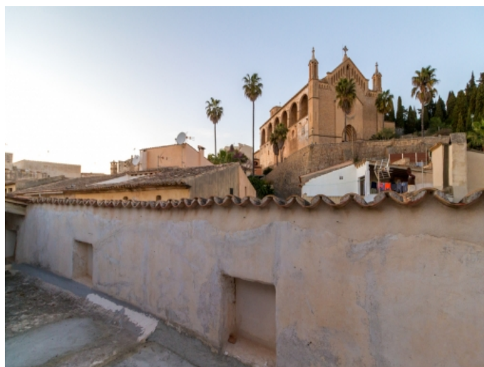
Impressive views of the church