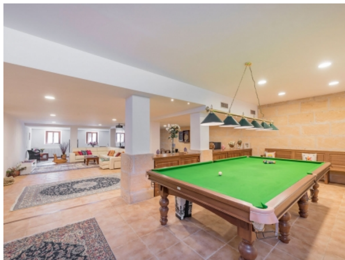
Extensive poolroom with lounge area

PORTA MALLORQUINA • C./ COLOM 20 2º, 07001 PALMA, SPAIN