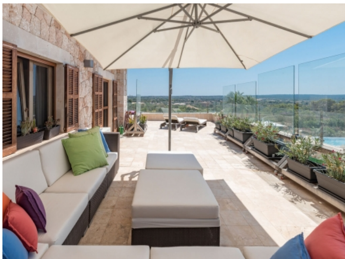
Lounge area with stunning view to the pool