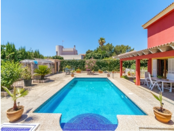
Sunny pool area with 8 x 4 metre pool