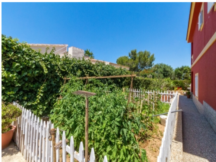
Lovely vegetable garden