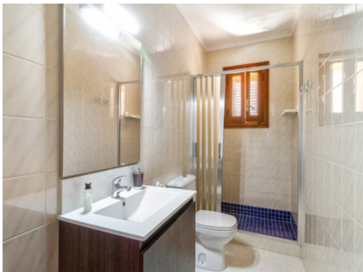
Shower-bathroom with window