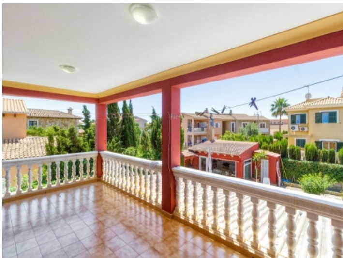
Large, covered terrace on the upper floor