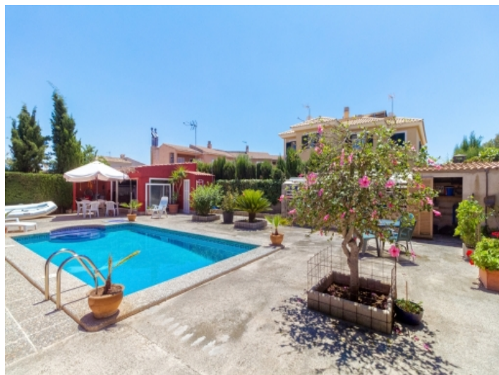
The mediterranean outside area offers ample space