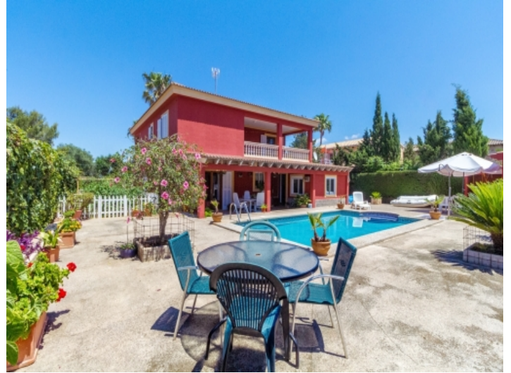
The outside area is ideal to enjoy summer days