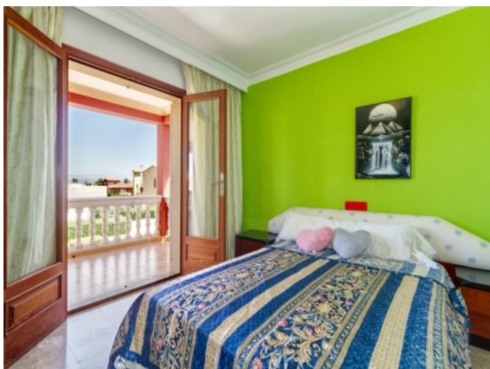
Double-bedroom with terrace access