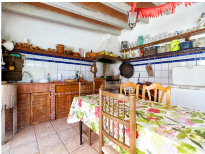
Fantastic summer kitchen with barbecue