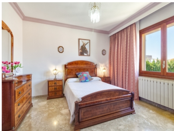
One of 4 bright bedrooms