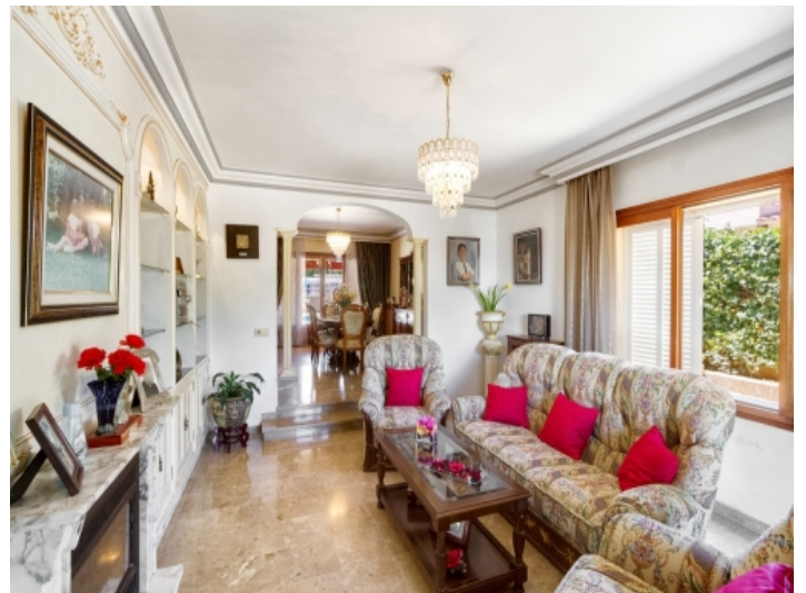
Views from the living area to the dining area