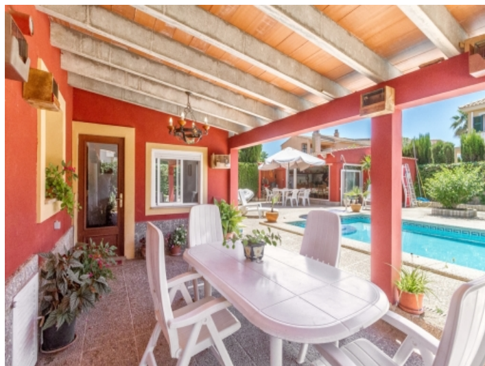
Charming terrace with dining area next to the pool area