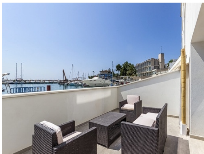
Terrace with view of the harbour