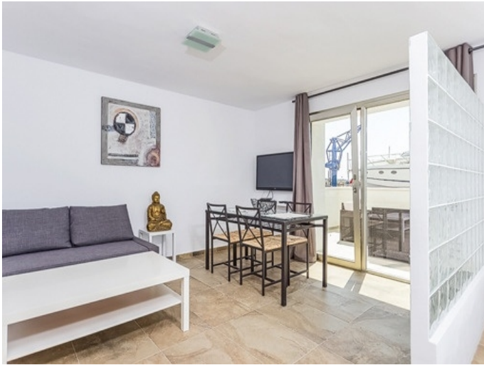
Living area of the apartment