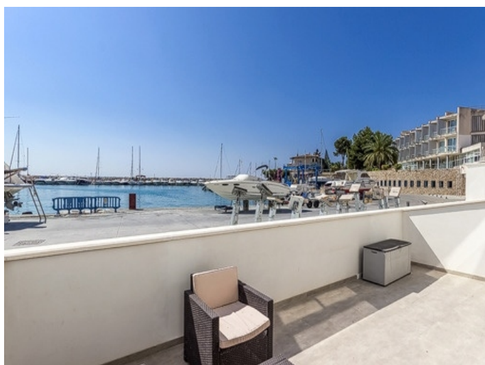
Terrace with impressive sea view