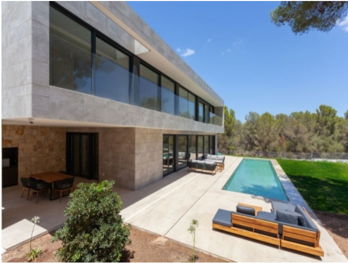
Spacious pool area