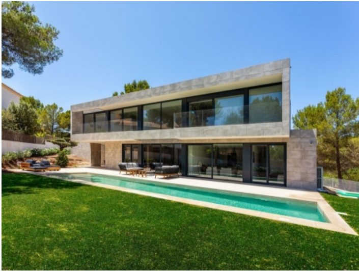
Exterior view and pool