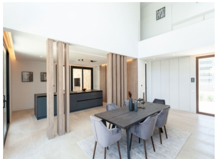
Dining area and open kitchen