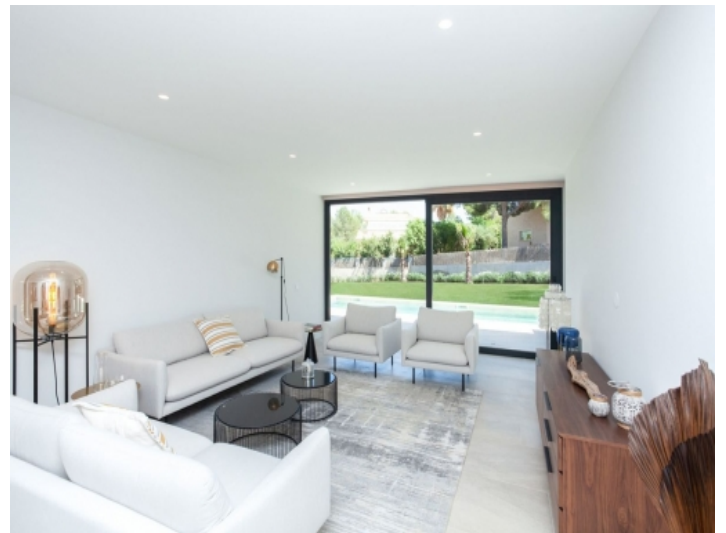
Living area with access to the terrace