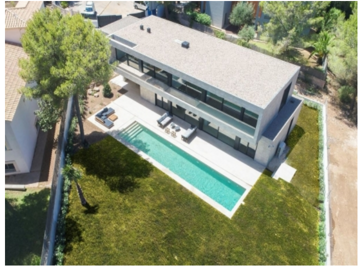
Bird's eye view of the property