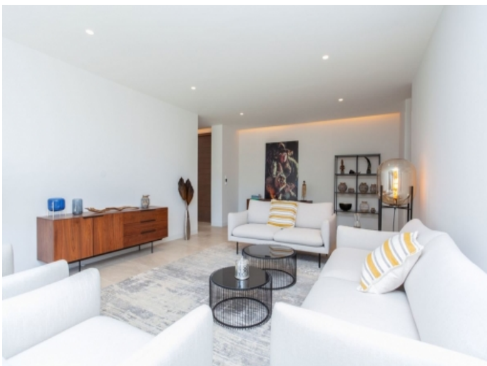
Light-flooded living area