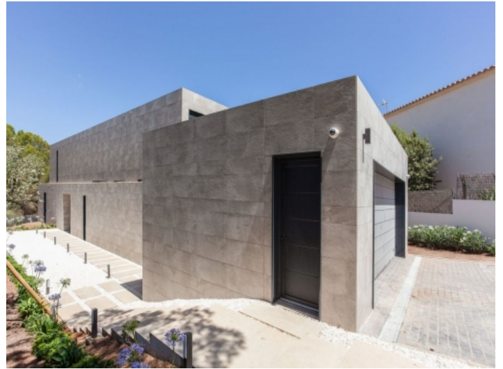
Entrance and garage