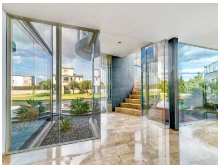
Garden and pool views from the ground floor