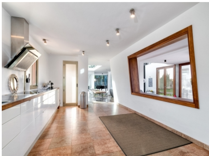
Modern and spacious kitchen