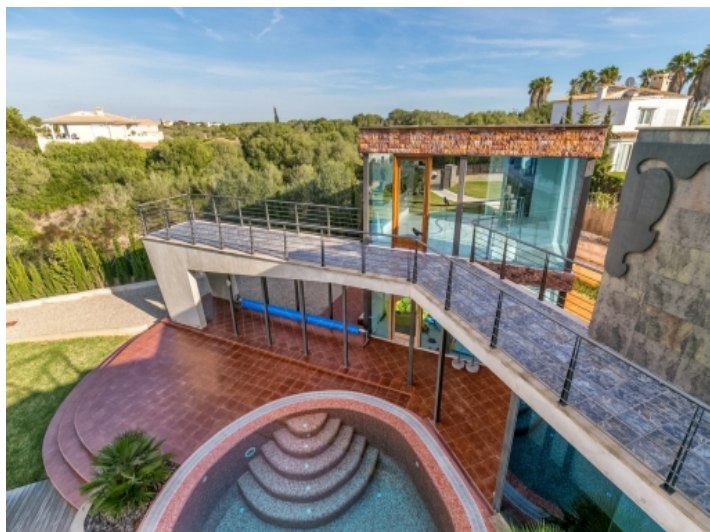
Great garden and pool area