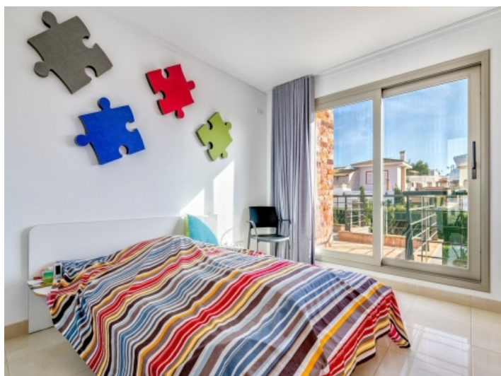
One out of 5 bedrooms