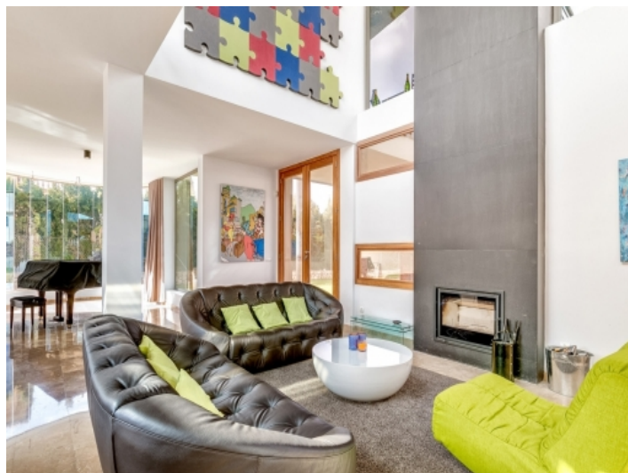
Light flooded living area with fireplace