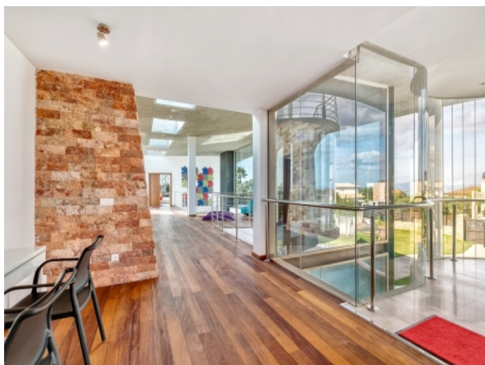
The completely glazed areas are a highlight