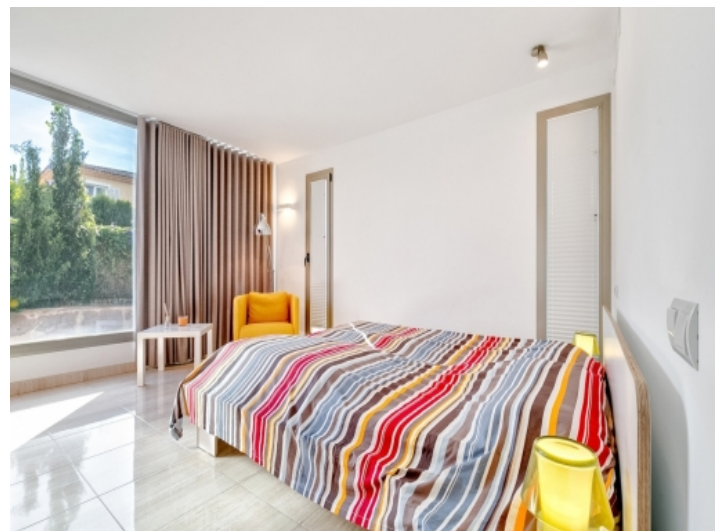
Friendly guest bedroom