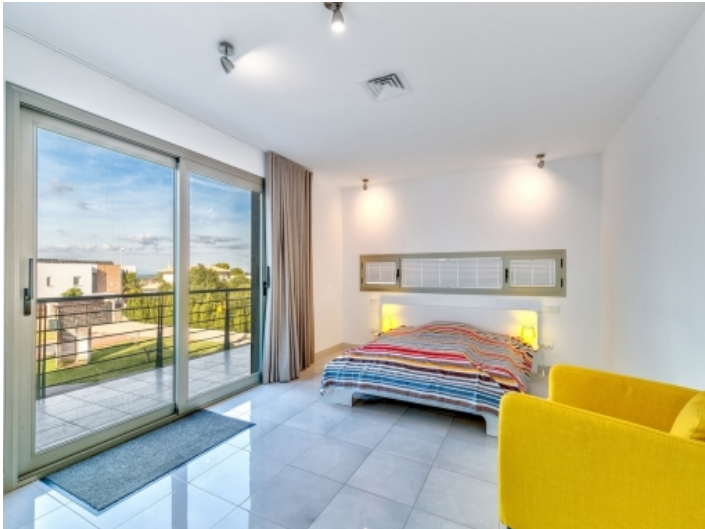
Double bedroom with balcony access