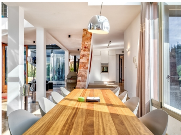
Large dining area