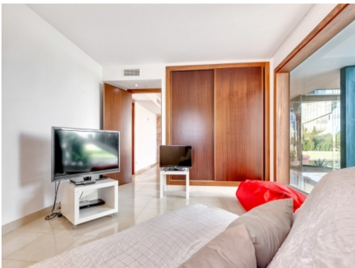
Guest room with built-in wardrobe