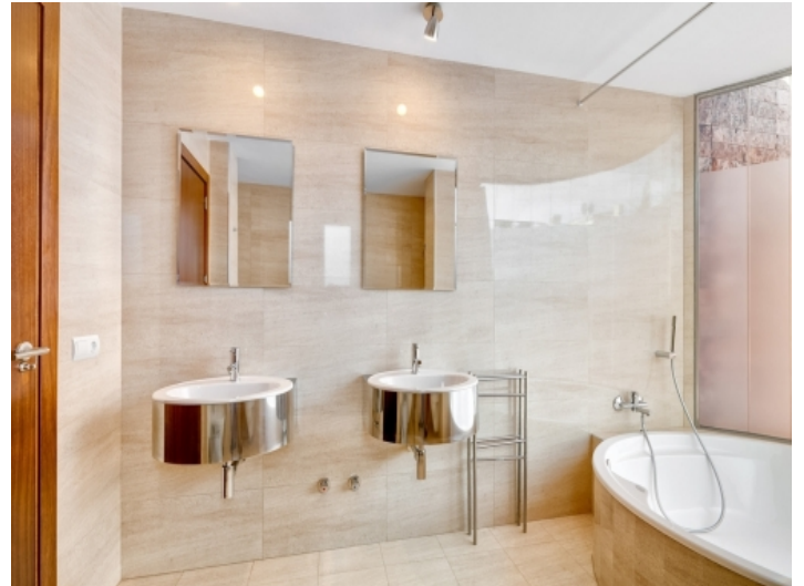
Noble bathroom with bathtub and natural light