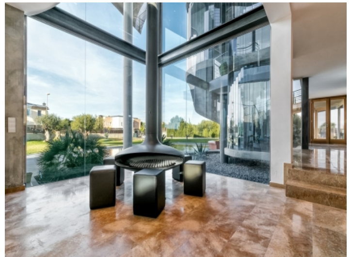
Stylish chillout area with garden views and fireplace