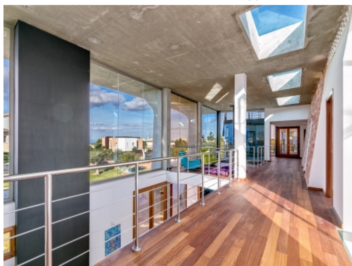
Extensive gallery with lounge area