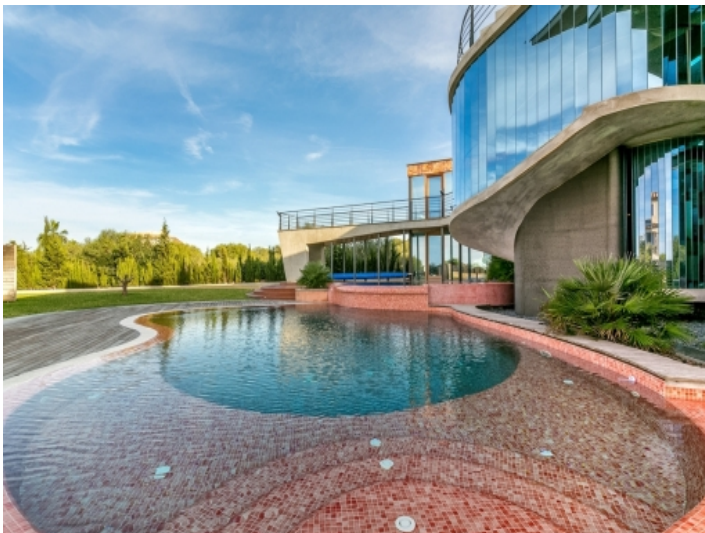
Breath-taking pool area