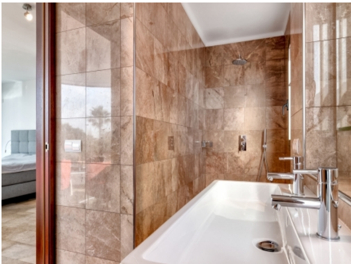
Master bathroom en suite with shower