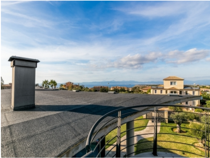
Wonderful panoramic views