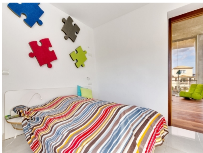
A further double bedroom on the upper floor