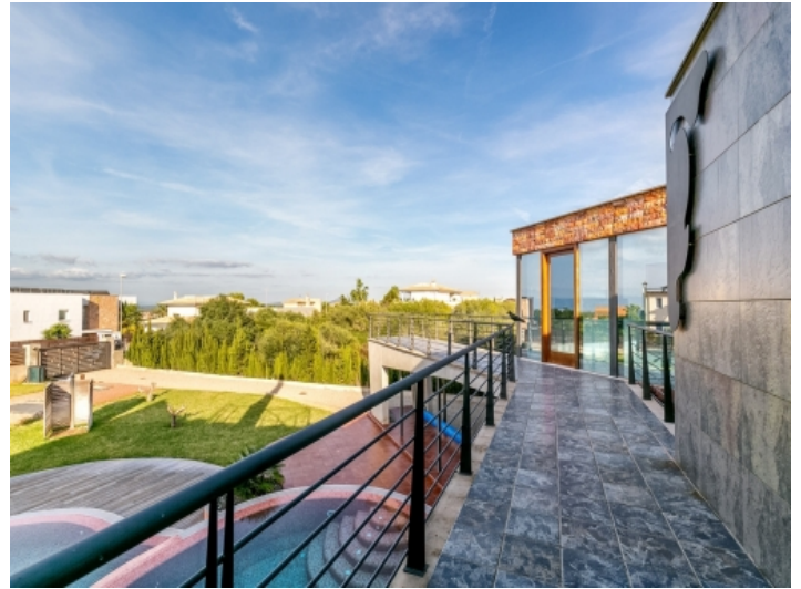
The villa has a separate guest house