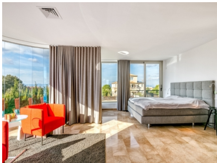
Capacious master bedroom with fantastic glass façade