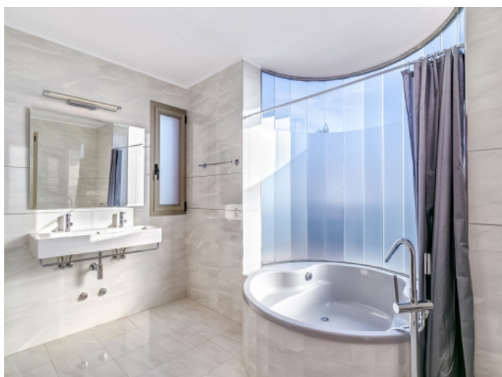
One out of 5 bathrooms with comfortable bathtub