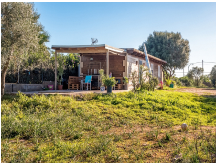
The constructed area will be 407 sqm