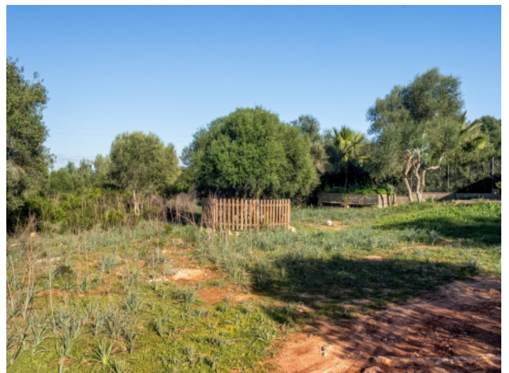
A lovely garden can be planted