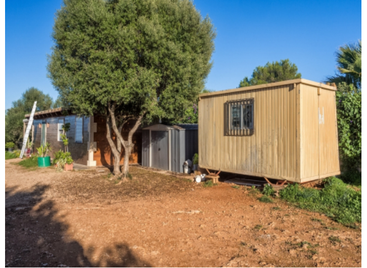
The project foresees a 2-floor stone finca