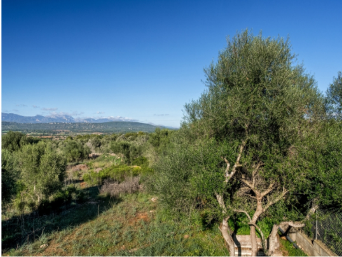
Amazing panoramic views