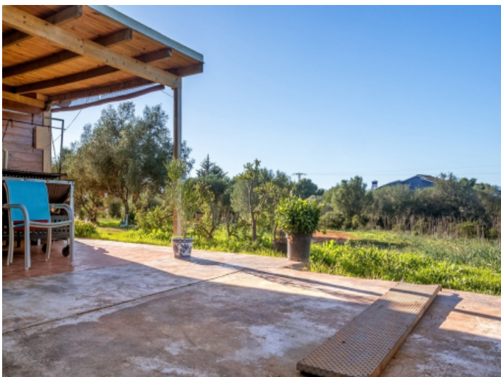
The future finca will have a living area of 60 sqm