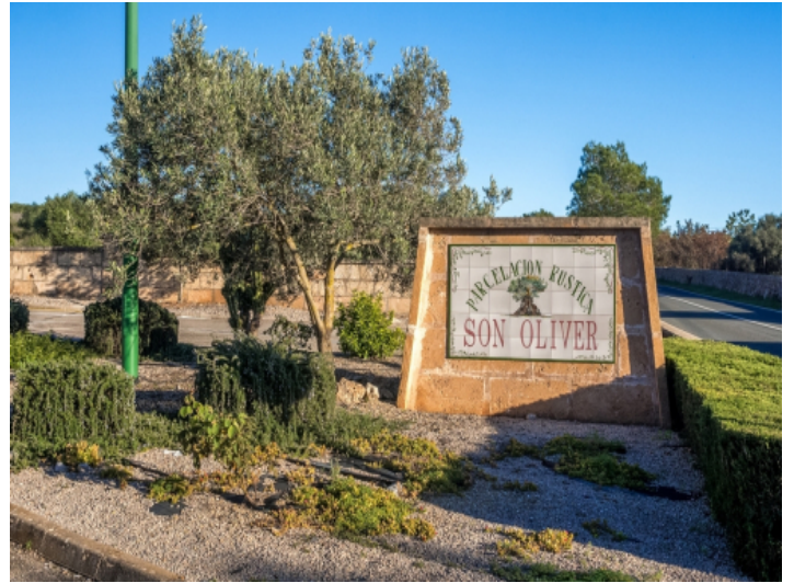
The plot is located in a rural area