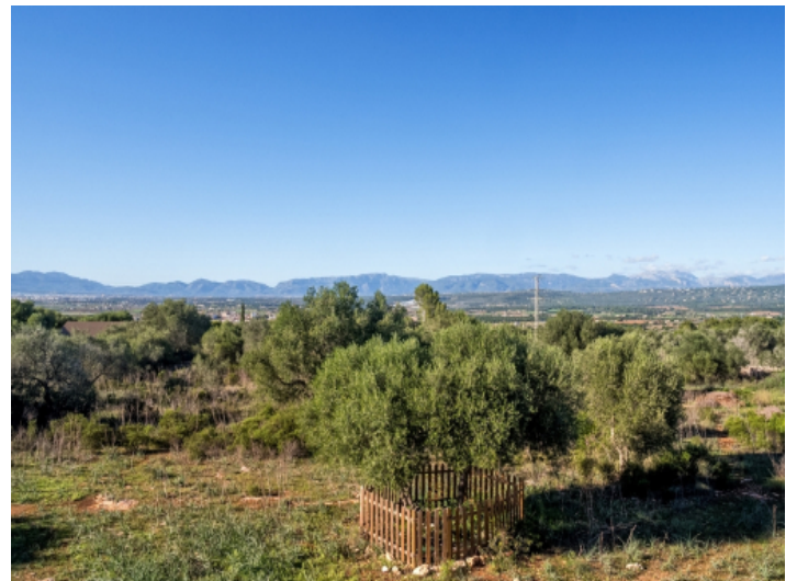
Idyllic views of the Tramuntana mountains