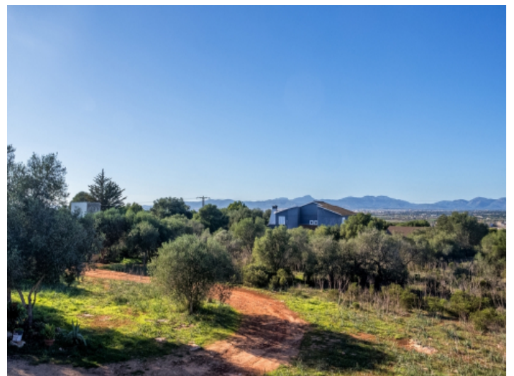
The plot can be easily reached via a paved road