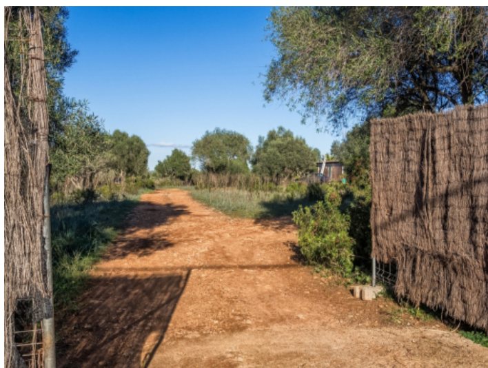
Entrance to the plot