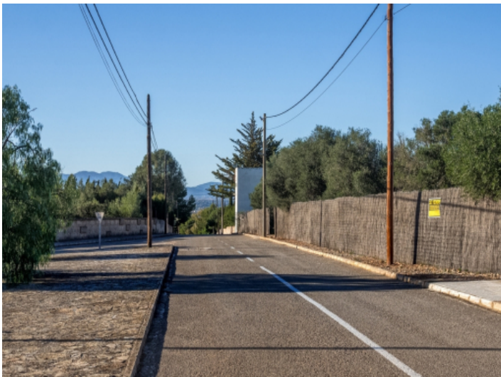
It takes only 15 minutes to Palma