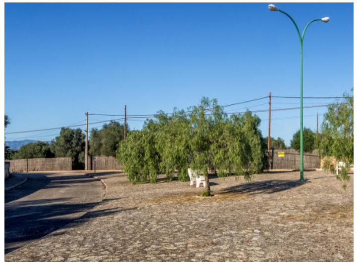
The urbanization is close to the airport