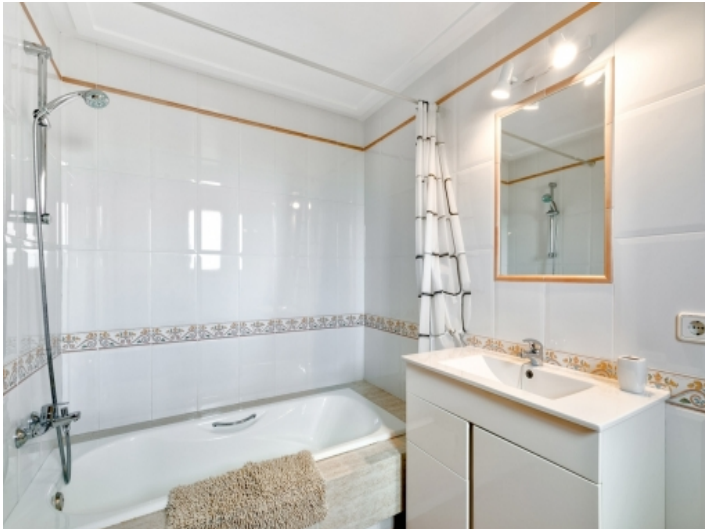
Second bathroom with bathtub