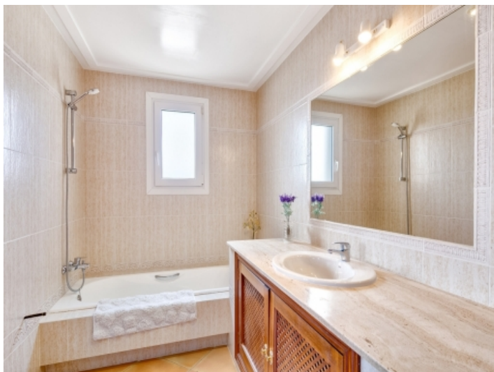
Bathroom en suite with bathtub and natural light