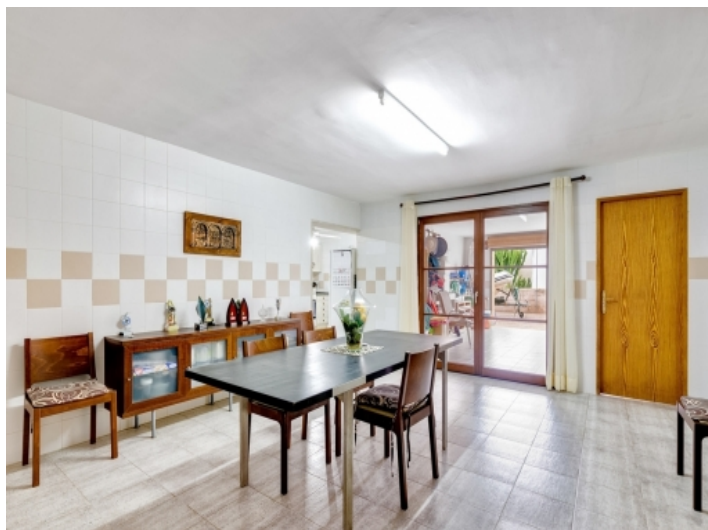
Another dining area