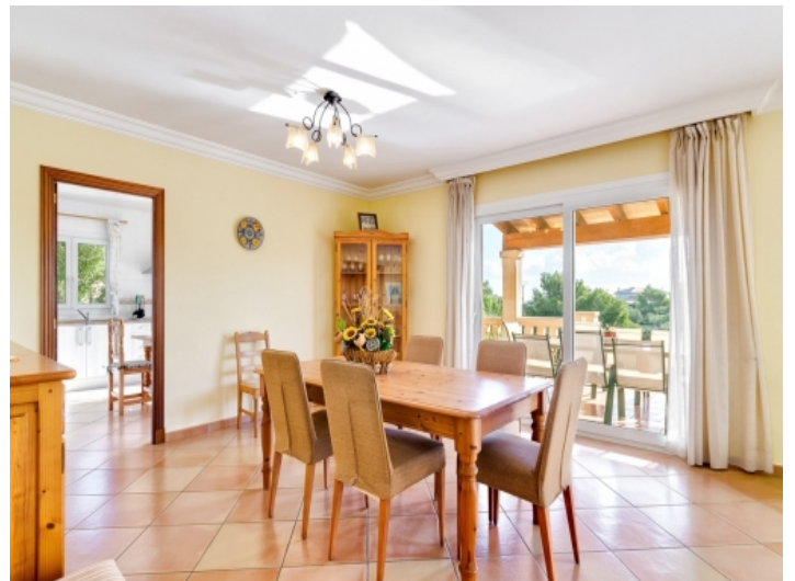
Bright dining area with terrace access