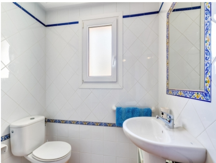
One out of 4 bathrooms