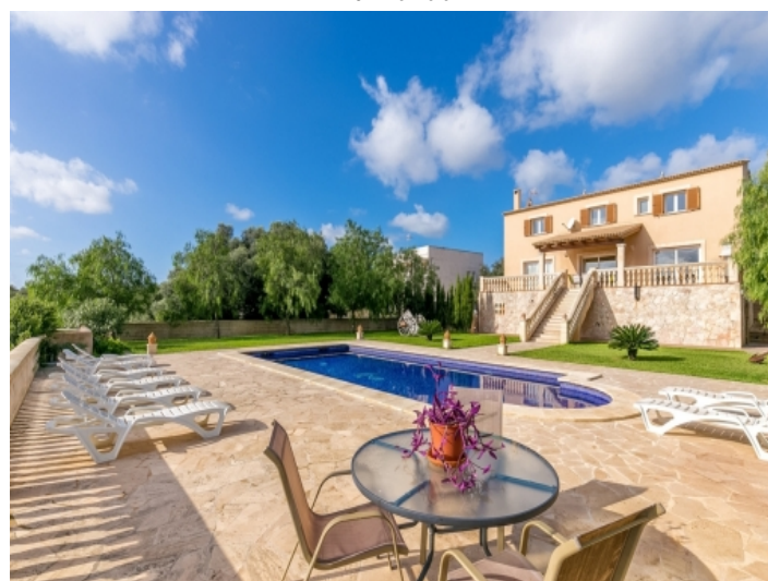
Idyllic garden and pool with chillout areas