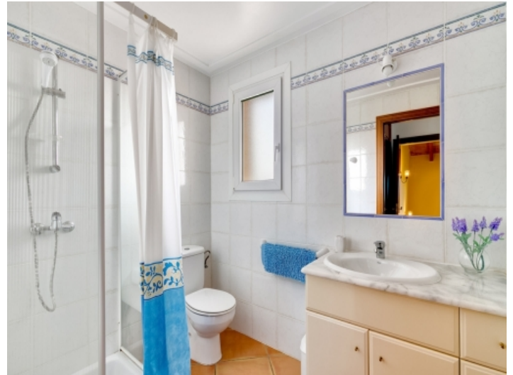
Bathroom with shower