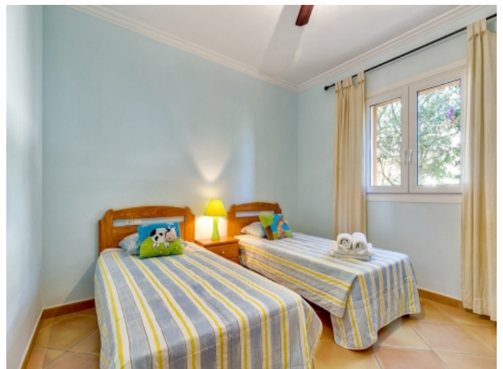
Children's room with 2 single beds