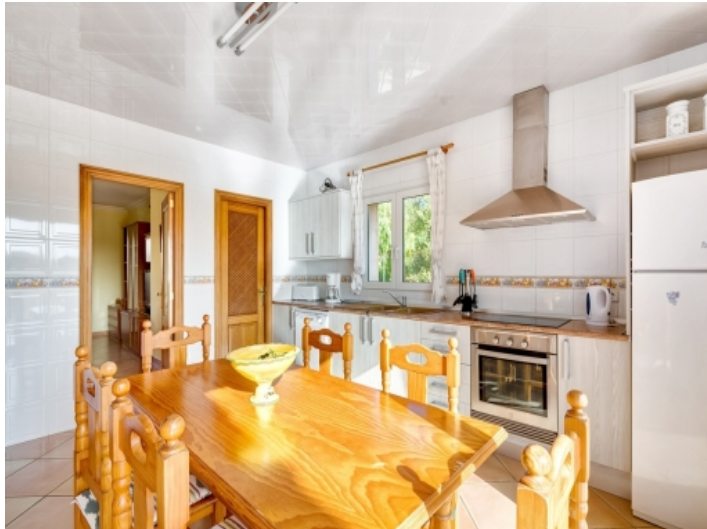
Light flooded kitchen with dining area