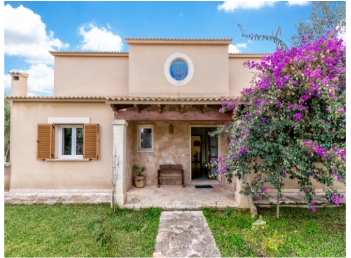
Front view and entrance to the property