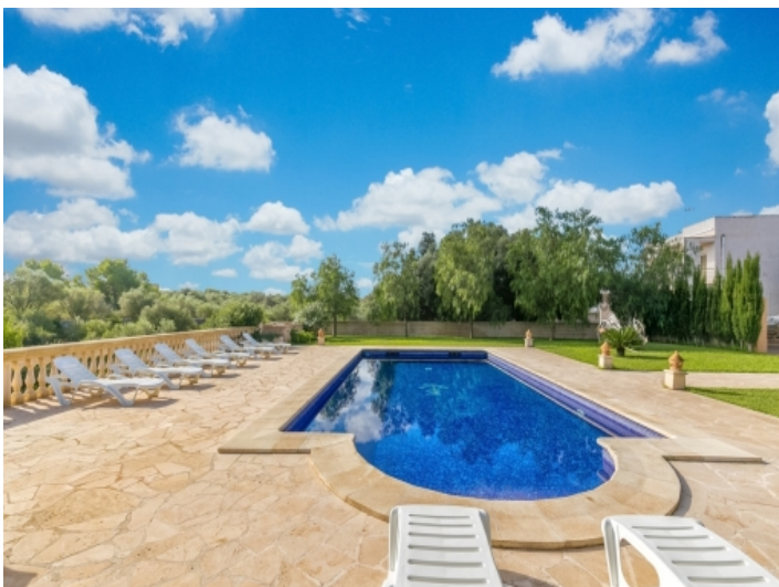
Amazing pool area and garden