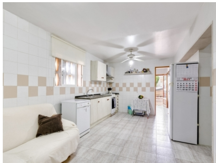
Second, fully equipped kitchen