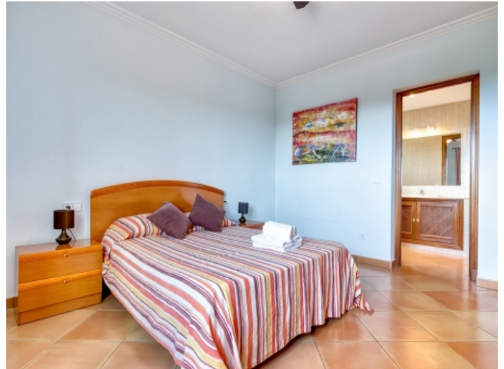
Double bedroom with bathroom en suite