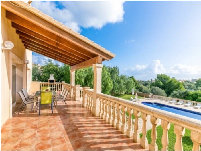
Large terrace with garden and pool views