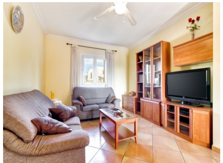
Second living area