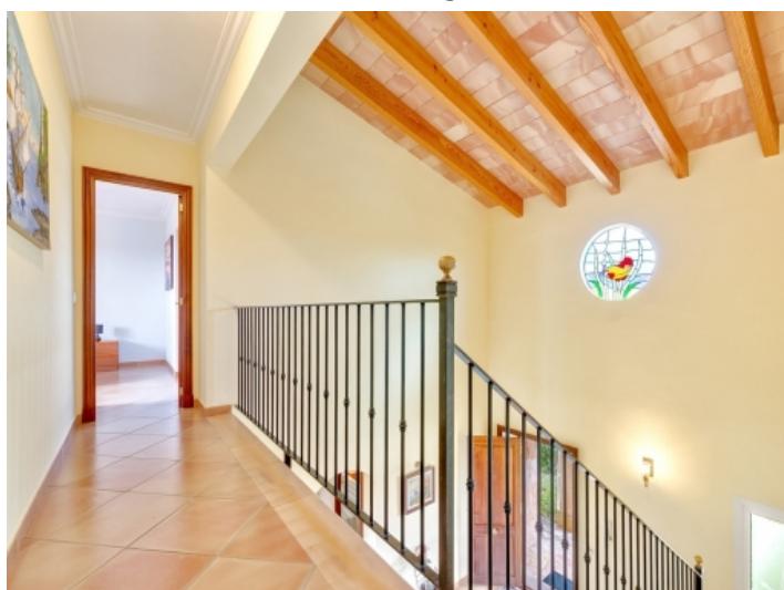
Staircase to the upper floor