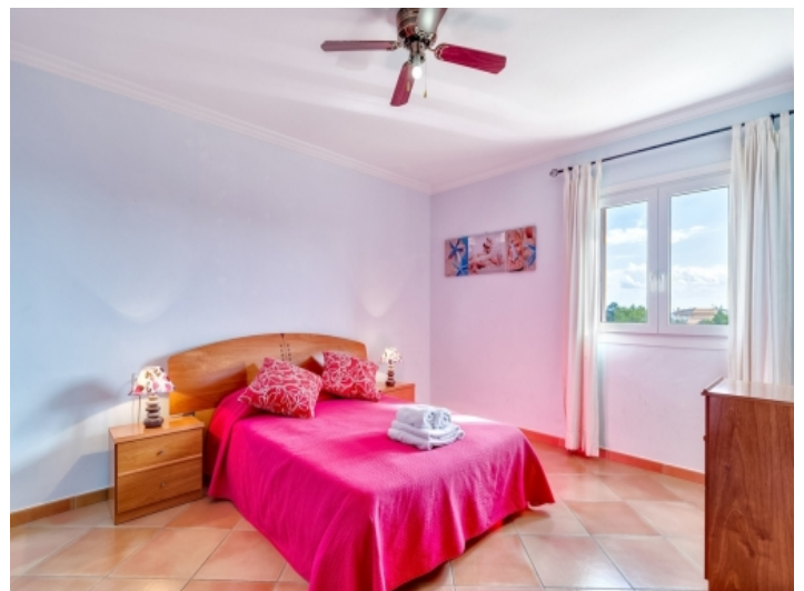
One out of 4 bedrooms