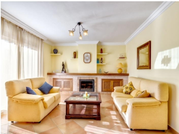
Cosy living area with fireplace