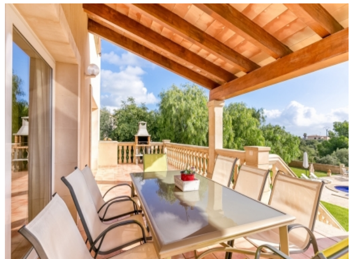
Covered terrace with seating and barbecue area