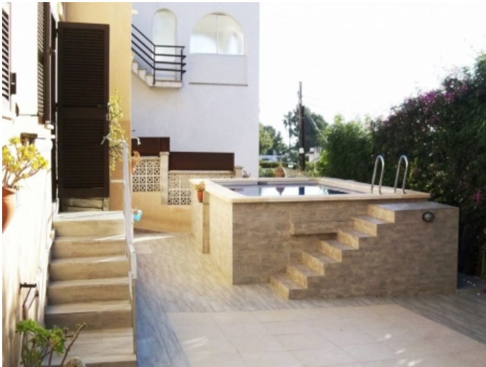
Terrace with pool