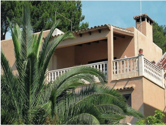
Exterior view of the chalet