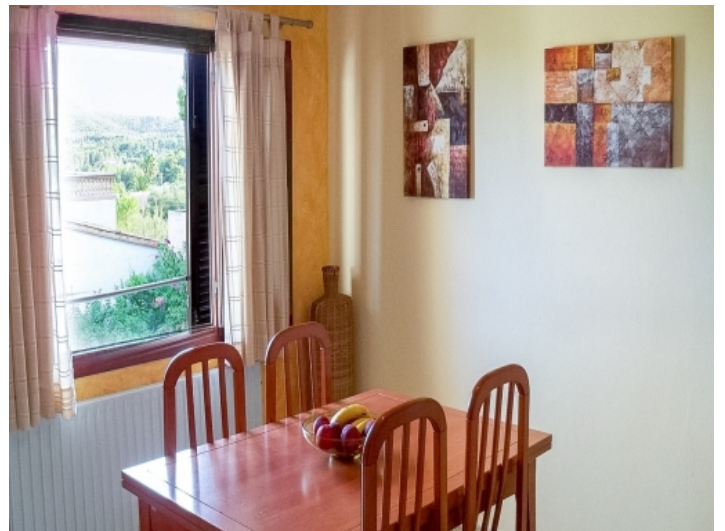
Small dining area