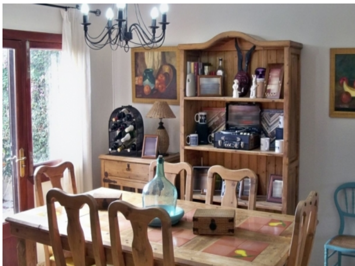
View of the dining area