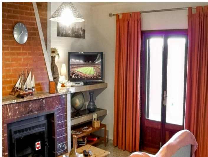
Living area with fire place