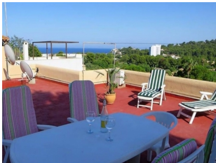
Spacious roof top terrace