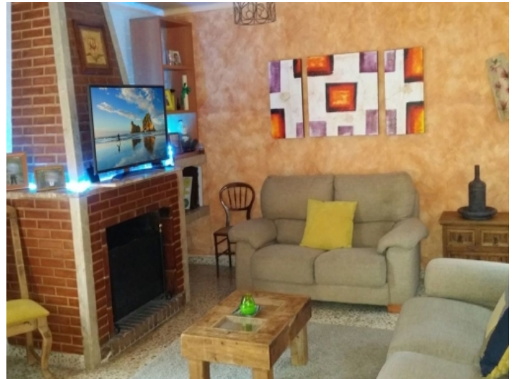
Living area of the upper apartment