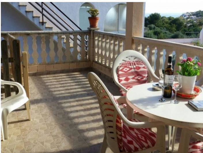
Terrace with a view