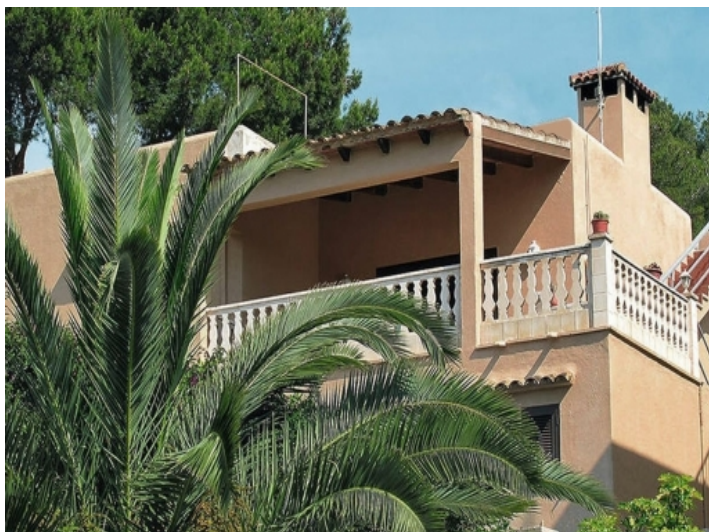
Exterior view of the chalet