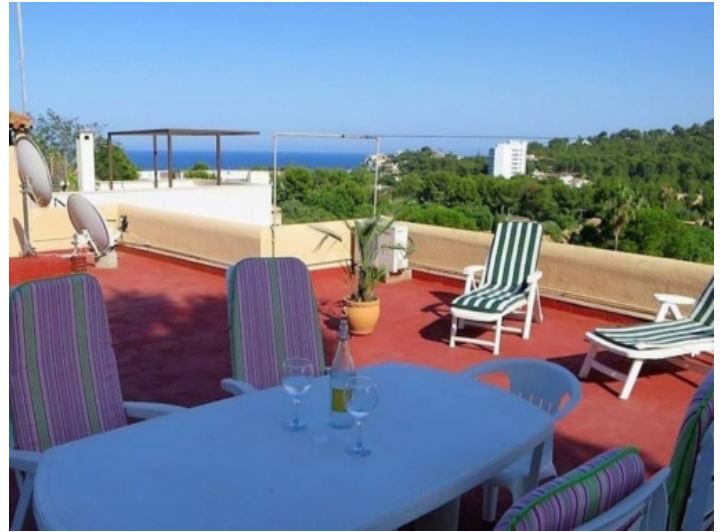
Spacious roof top terrace