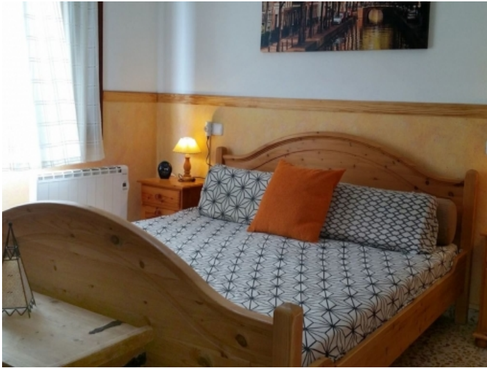
One of 3 double bedrooms