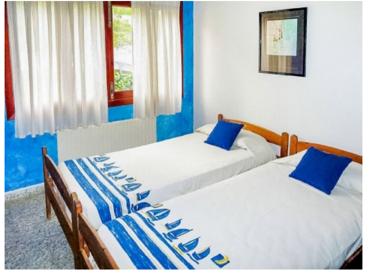
One of 3 double bedrooms