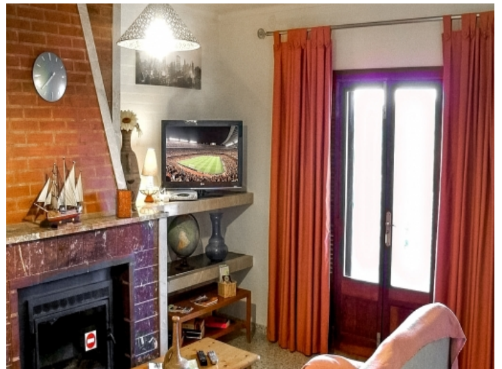
Living area with fire place