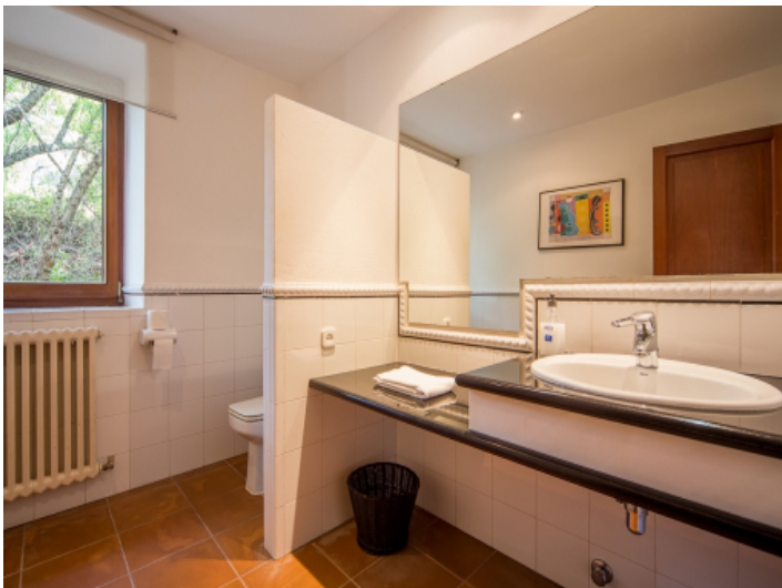
Bathroom with heating