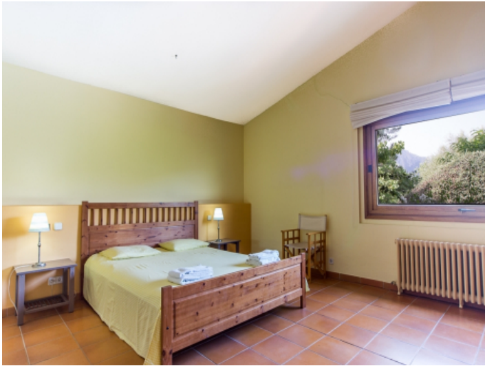
Bedroom with heating