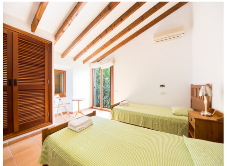
Bedroom with built-in wardrobe