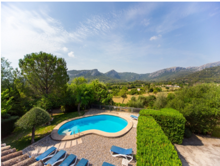
Unique landscape views from the upper floor