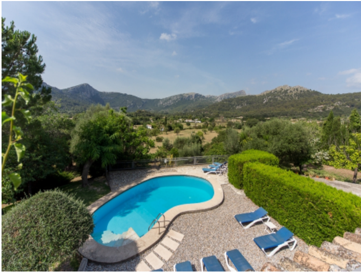
Well-tended pool area