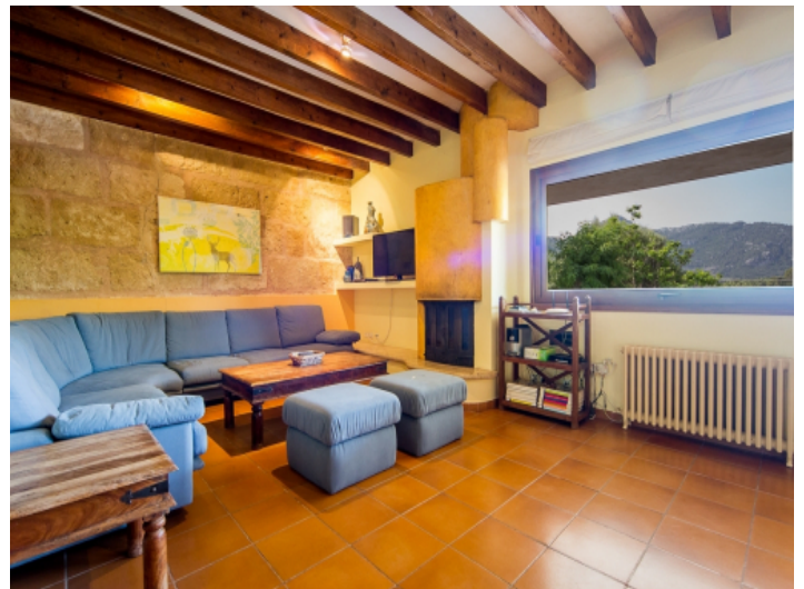
Gorgeous living area