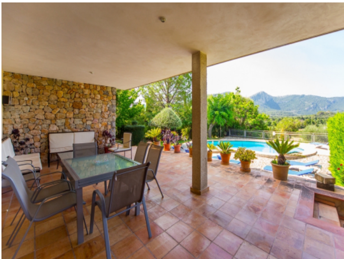
Views from the covered terrace to the pool area