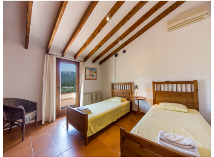
Bedroom with air condition