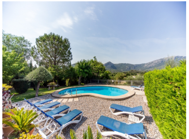
Mallorquin pool area