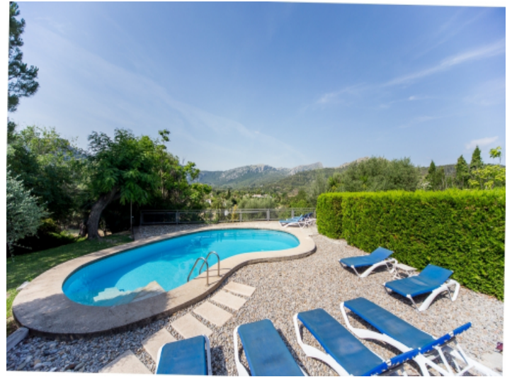
The pool is surrounded by a terrace with sunbeds