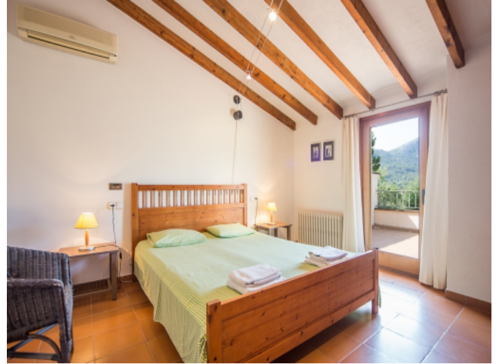
Bedroom with balcony