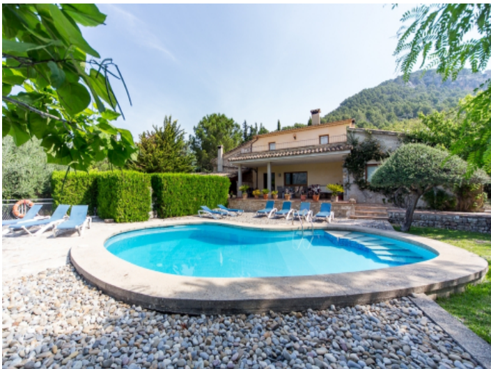
Idyllic pool area