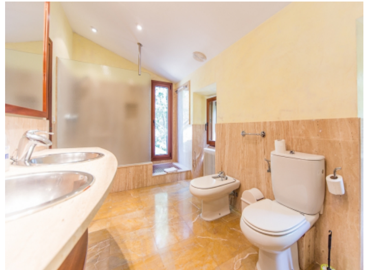
Bathroom with daylight and bathtub