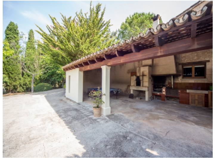
Covered terrace with barbecue area