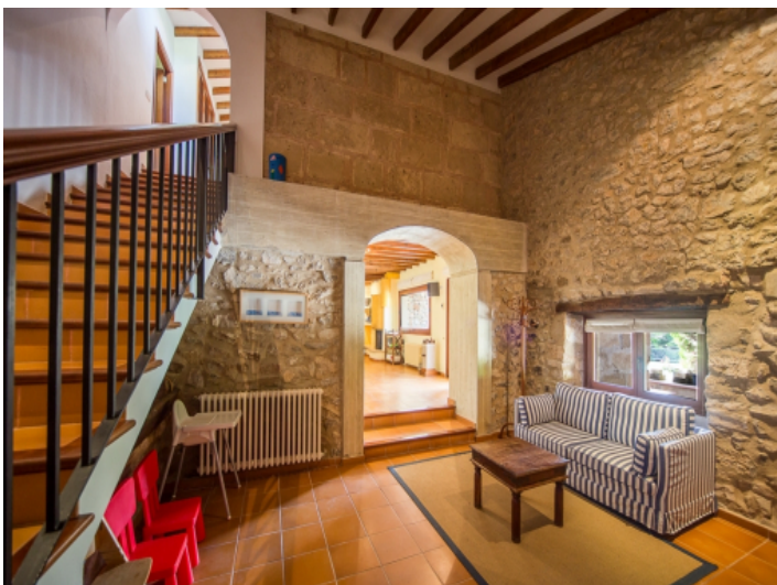
Lounge area from the finca