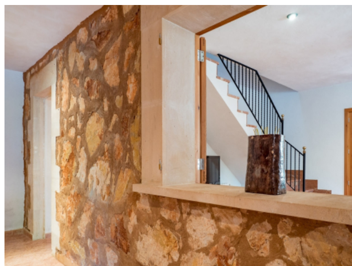
Views to the corredor from the finca