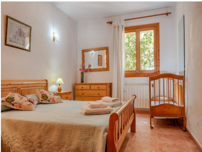
Bedroom with heating