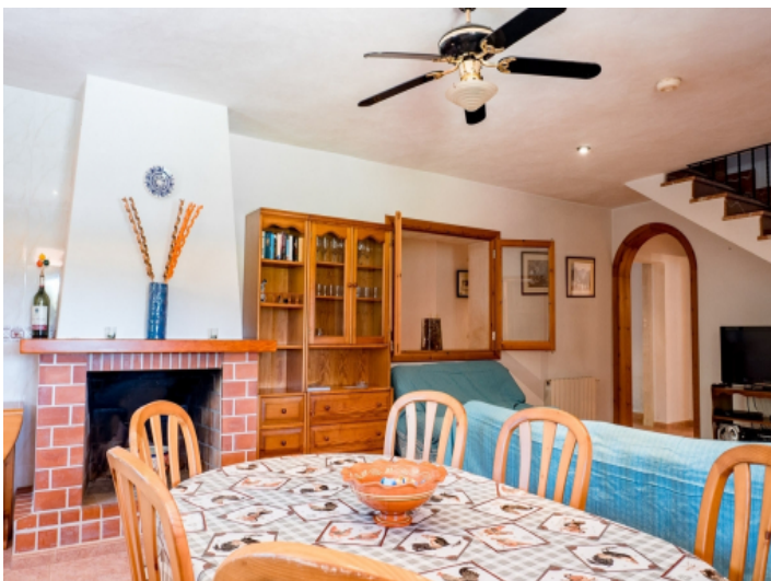
Dining area with fireplace