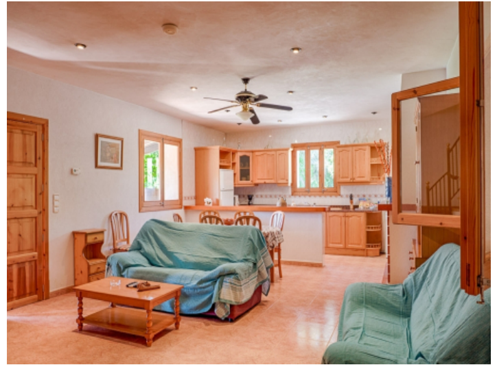
Light flooded https://smart.onoffice.de//smart20/Objekte/Port