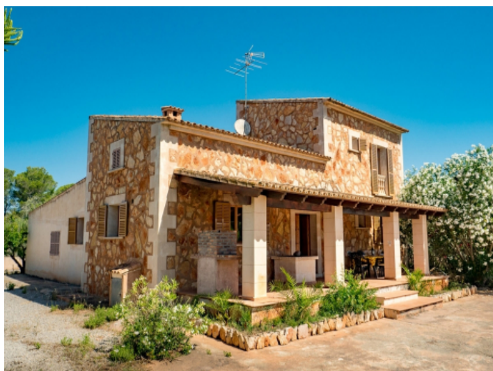
Views from the terrace to the finca