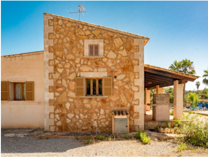
Finca with natural stone wall