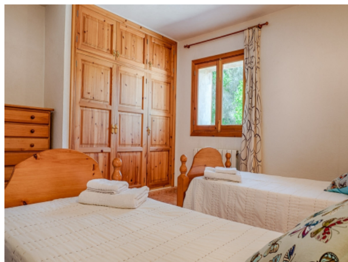
Bedroom with tow beds