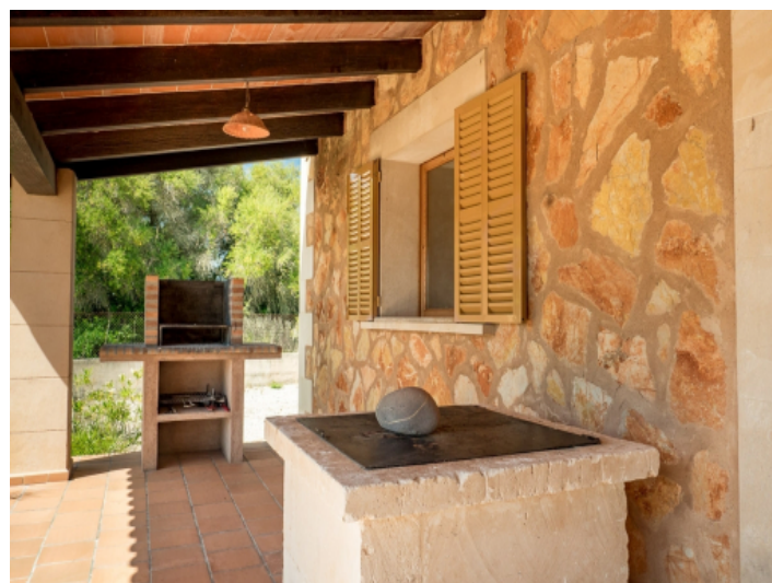
Covered terrace with barbecue