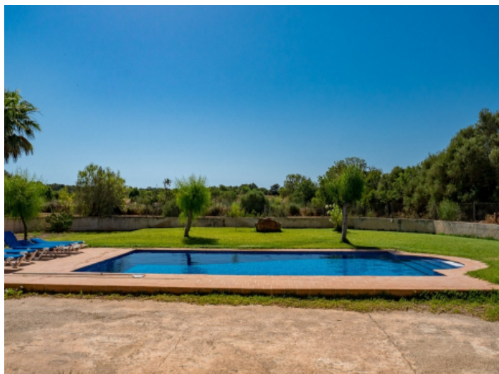
Views from the finca to the pool and garden