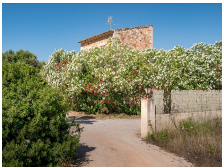
Access to the finca