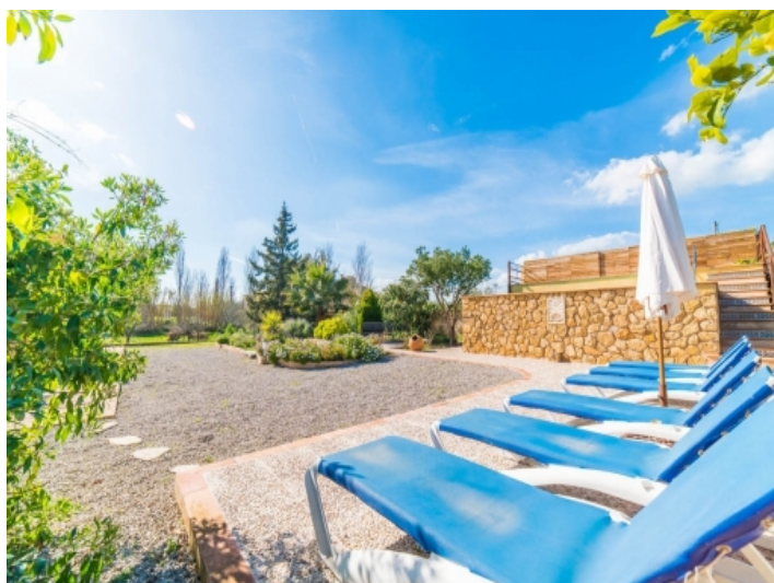
Chill-out area in the garden