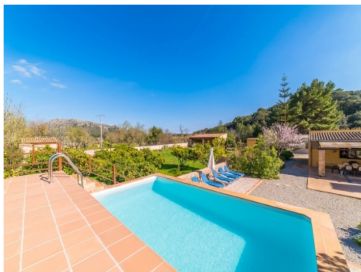
Views to the pool area from the terrace