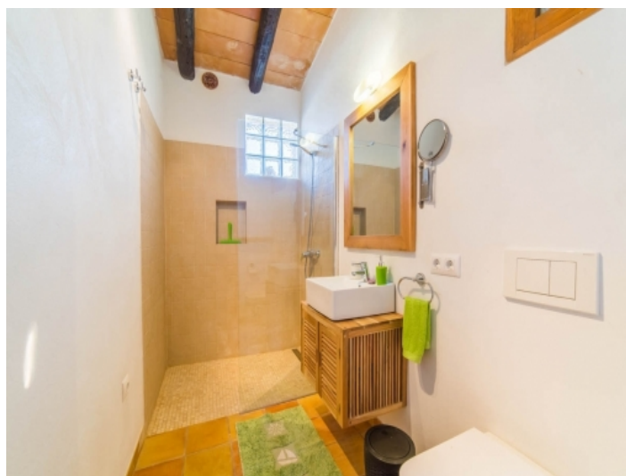
Bathroom with shower and daylight