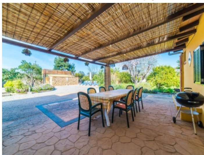
Covered terrace with dining area