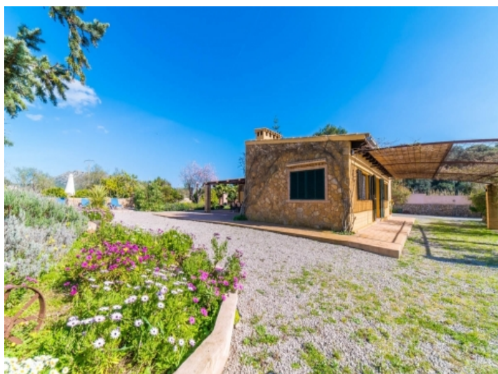
Views from the garden to the finca