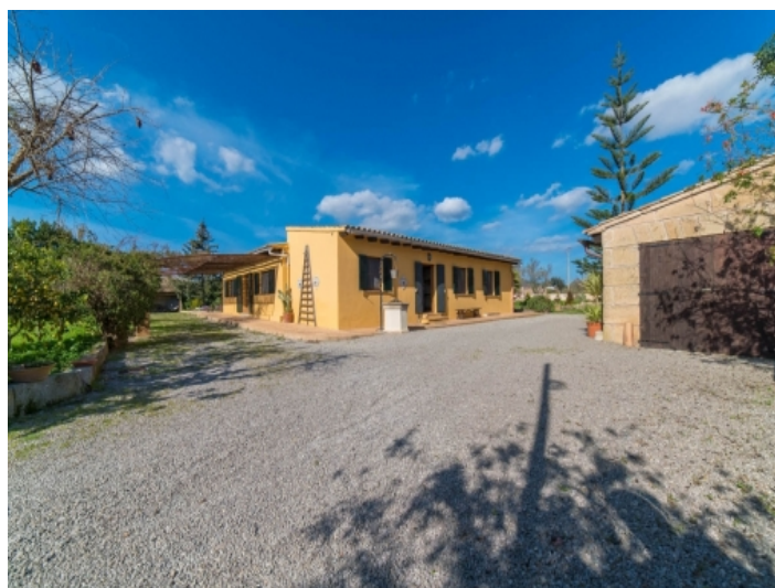
Spacious plot with garage