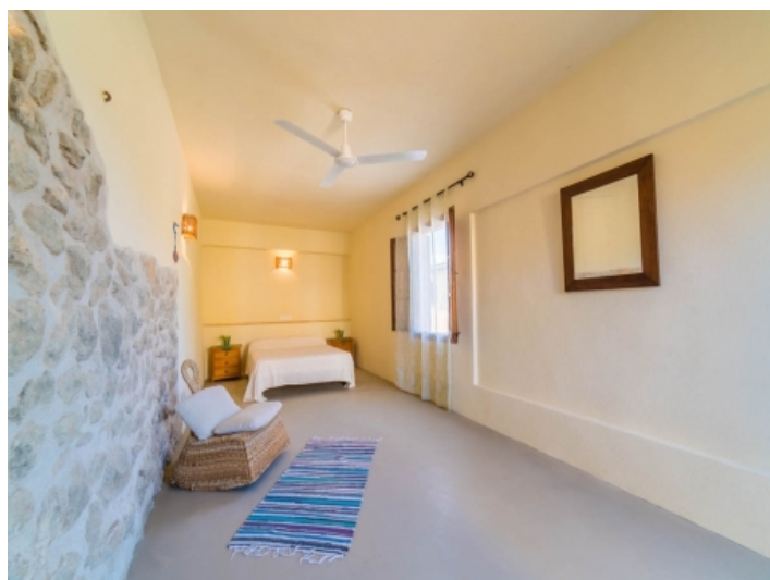
Bright master bedroom