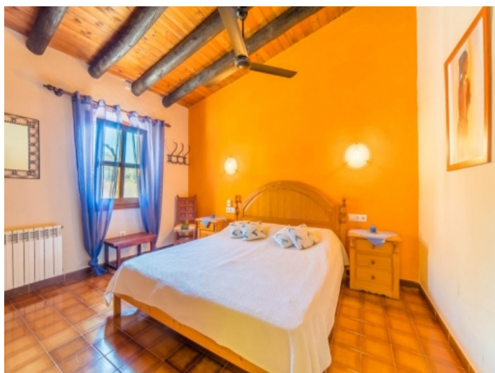
Bedroom with heating