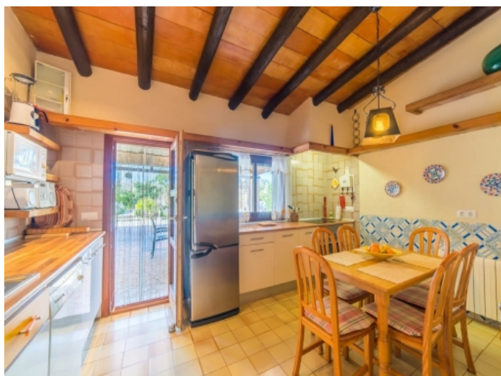
Dining area with terrace acces