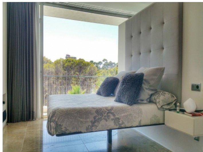
One of three bedrooms with views of the surrounding