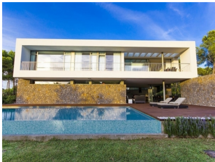
Terrasse beside the pool with lounge area