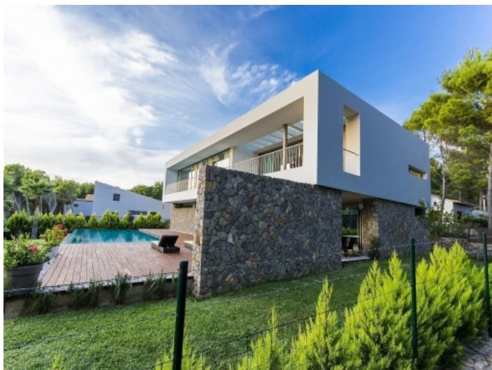
Well-tended garden with inviting pool area