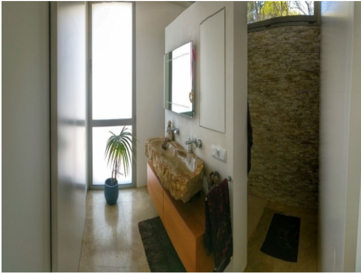
One of two bathrooms with designer washbasin