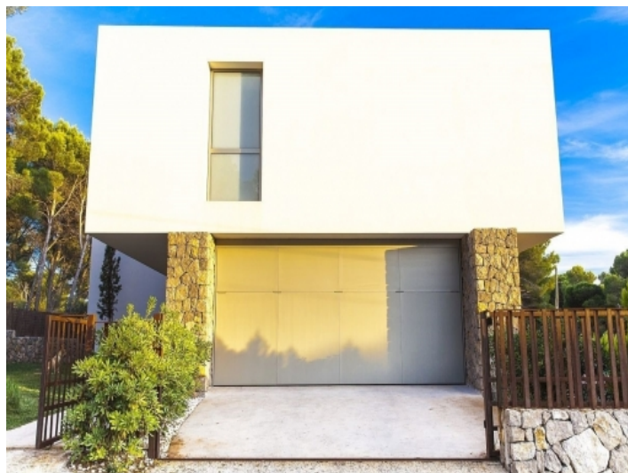
Access to the garage