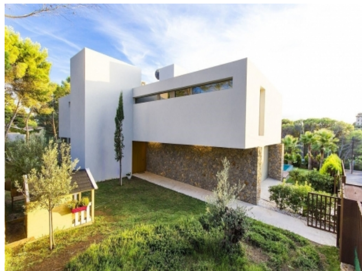
Exterior view of the villa with natural stone elements