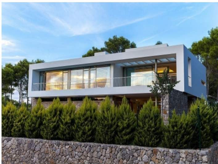
Exterior view of the house with privacy