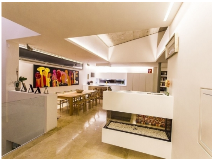
Inviting dining area on the first floor