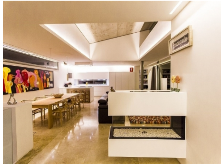
Bright dining area with fireplace