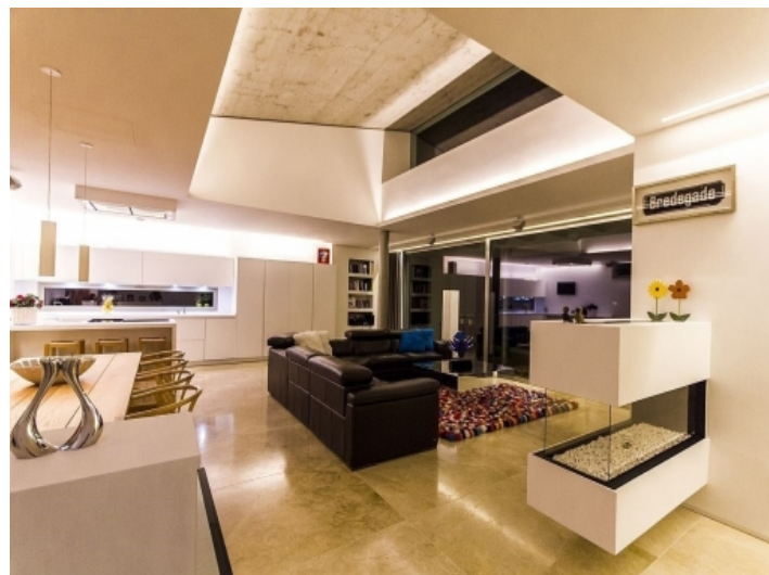
Open living and dining area with kitchen