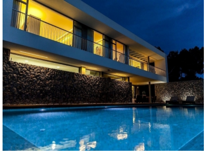
Illumination by night