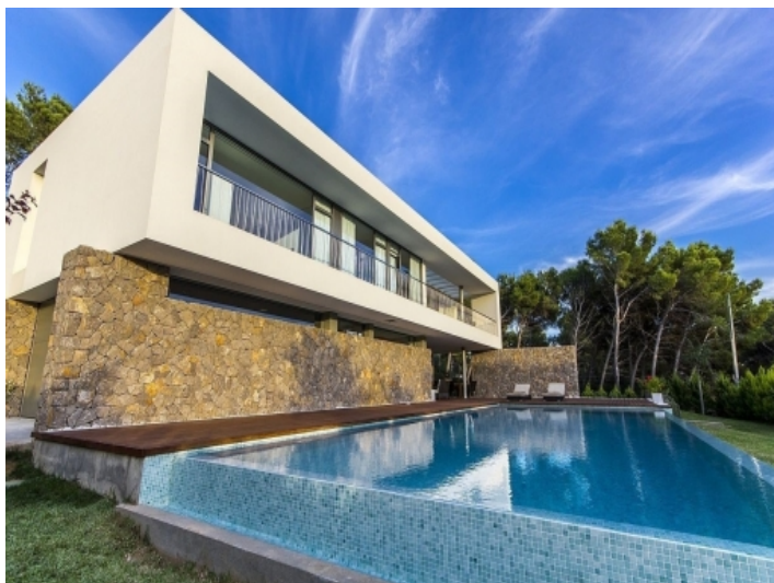
According to the latest energy standards