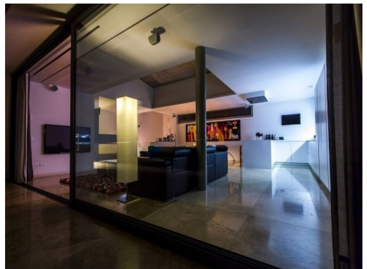
Stylish living area