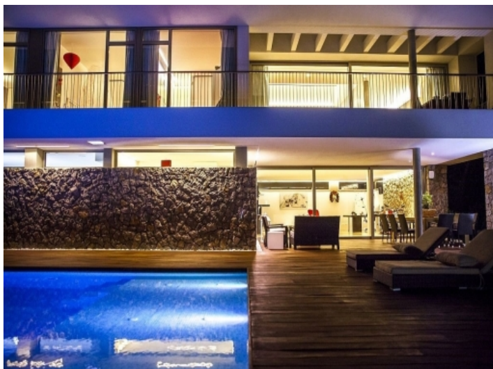
Very exclusive villa with special illumination