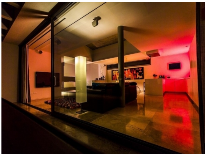
Nice light installation in the living room