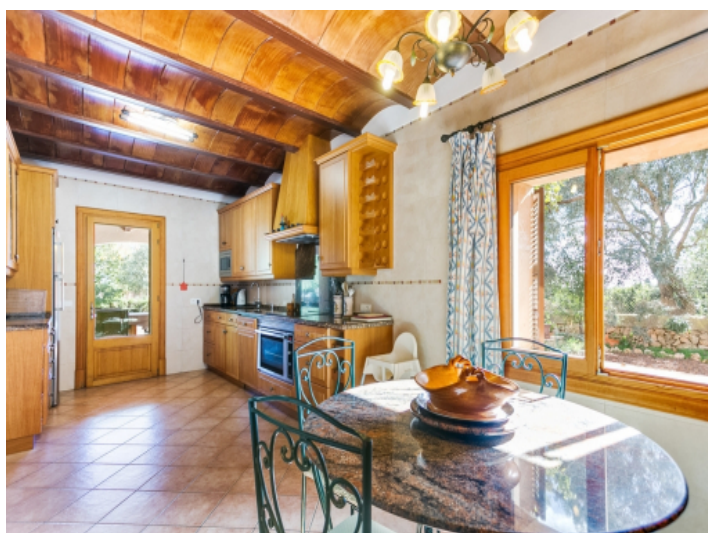
Small dining area in the kitchen