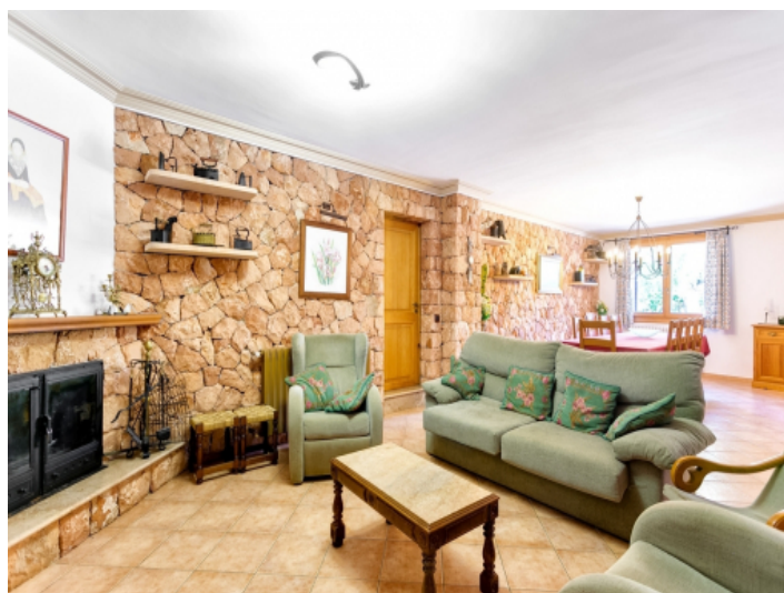
Spacious living and dining area with fireplace