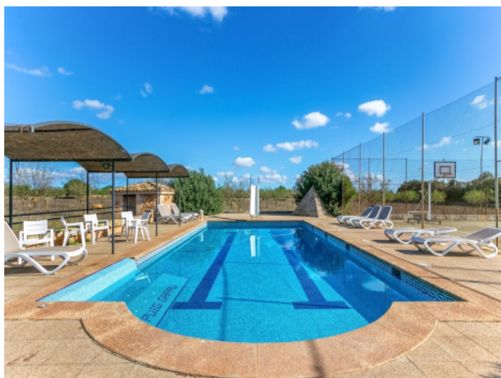
Large salt-water pool with slide