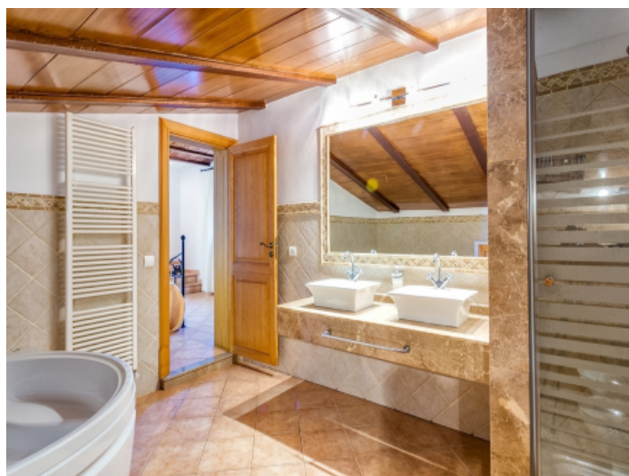
Bathroom with heating, bathtub and shower