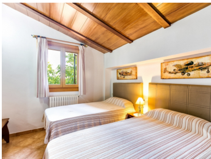
Comfortable bedroom with two single beds