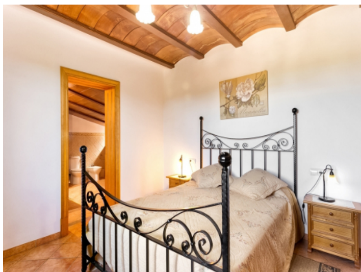
Cosy bedroom with bathroom en suite