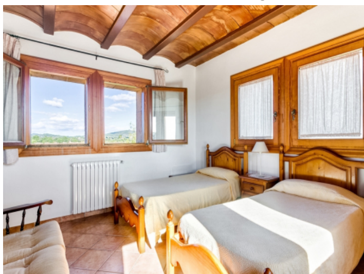
One of five bedrooms