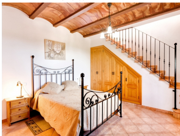
Bedroom with built-in wardrobes