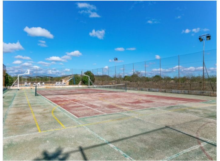
The finca has its own tennis and basketball court