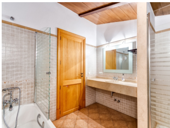
One of four modern bathrooms