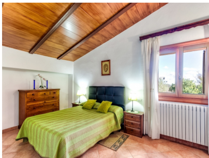
Beautiful bedroom with wooden ceiling