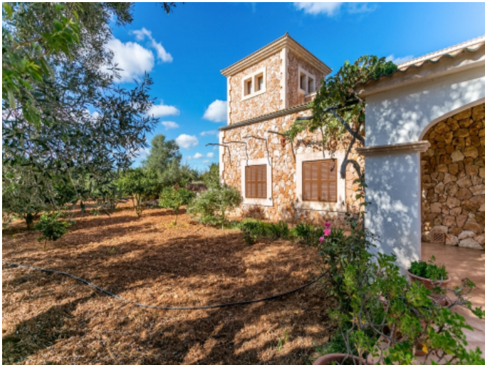
Romantic garden with fruit trees