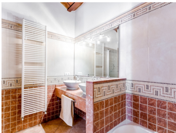
Modern bathroom with bathub and red tiles