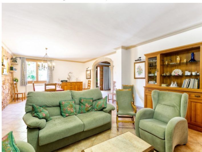
The finca has a living space of approx. 350 sqm