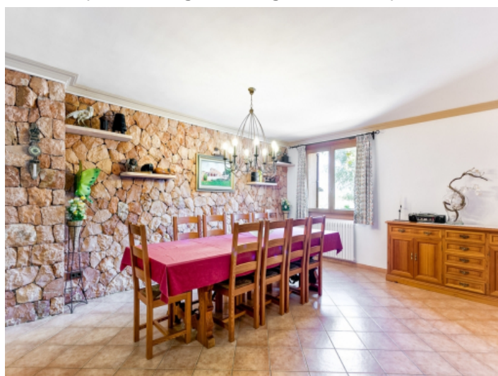
Country-style dining area with stone-wall