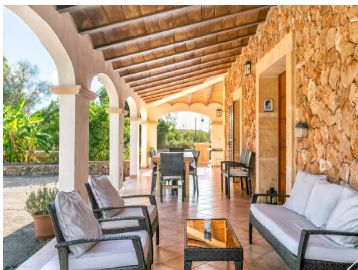
Idyllic, covered terrace with sitting area