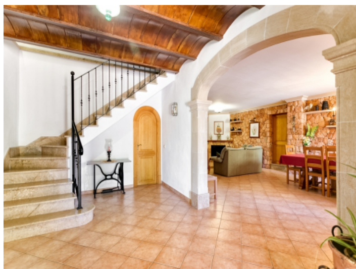
Entrance area with staircase which leads to the upper floors