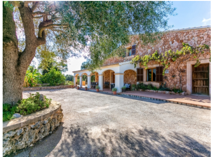
Forecourt with olive tree