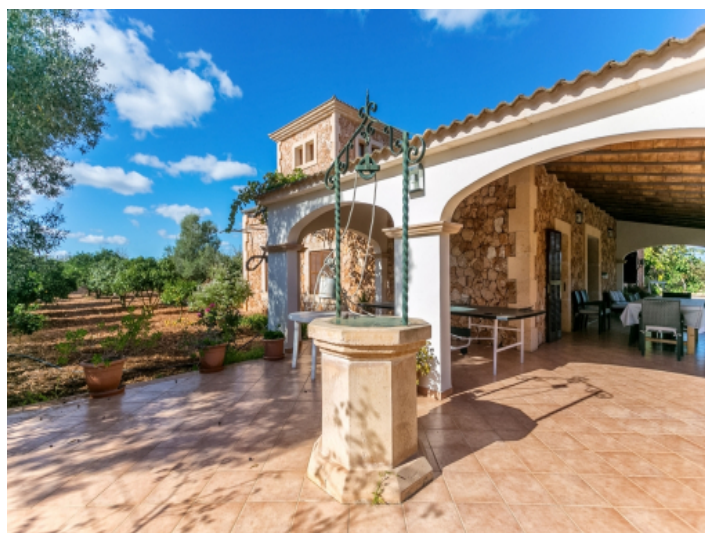
Mediterranean terrace with fountain