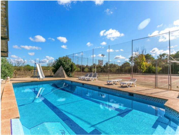
Fantastic pool area with sunloungers next to the tennis court