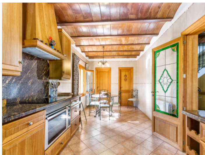
Fully equipped fitted kitchen