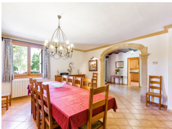
The dining area is separated by an open archway from the entrance hall